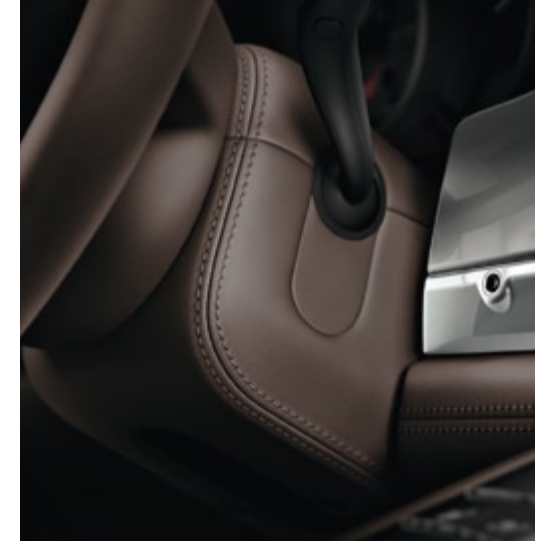
Steering-wheel column casing in leather