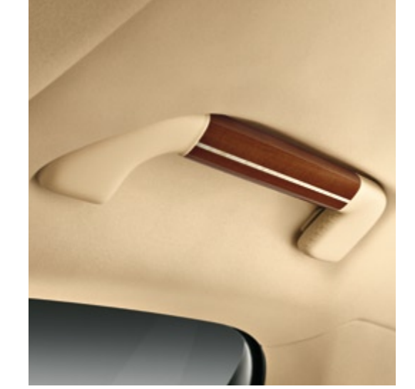
Roofliner grab handles in Yachting Mahogany