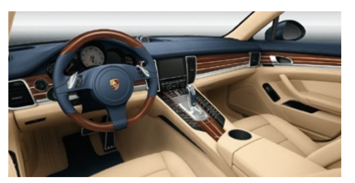
13 | Panamera 4S