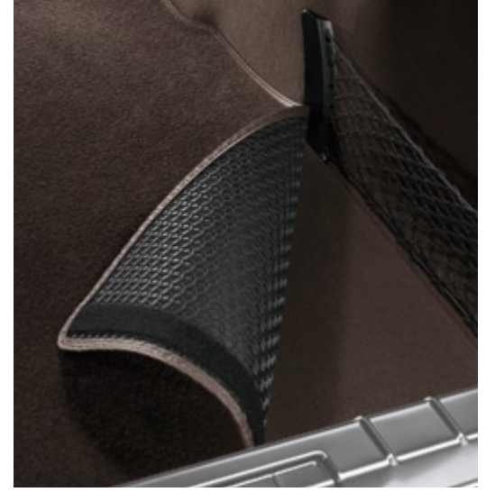
Personalized luggage space mats with leather edging