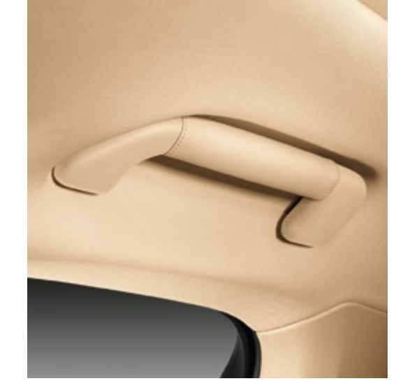
Roofliner grab handles in leather