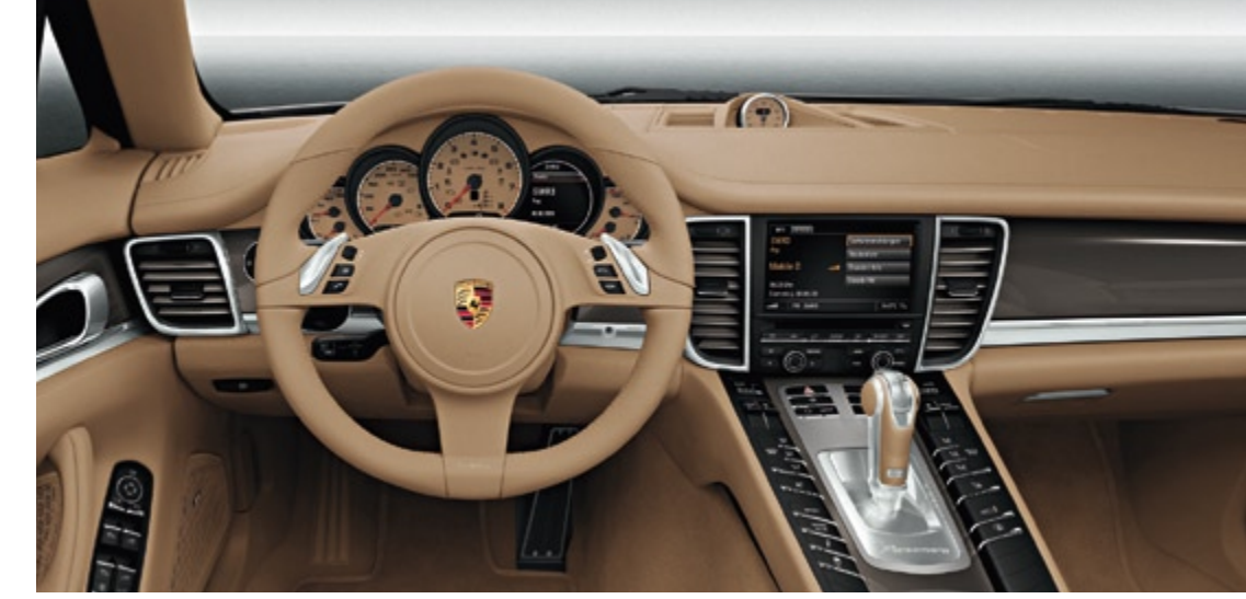
Interior package painted, air vent slats painted, instrument dials in Luxor Beige, Sport Chrono stop-clock dial face in Luxor Beige