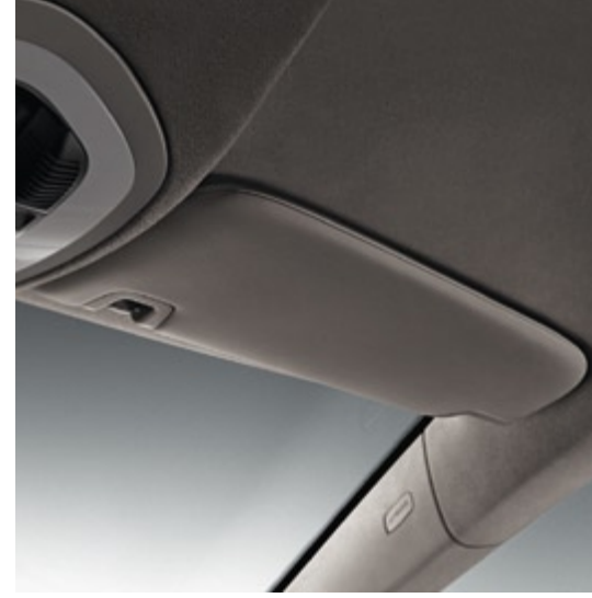
Sun visors in leather