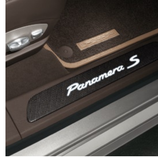
Door-entry guards in Carbon Fiber, illuminated