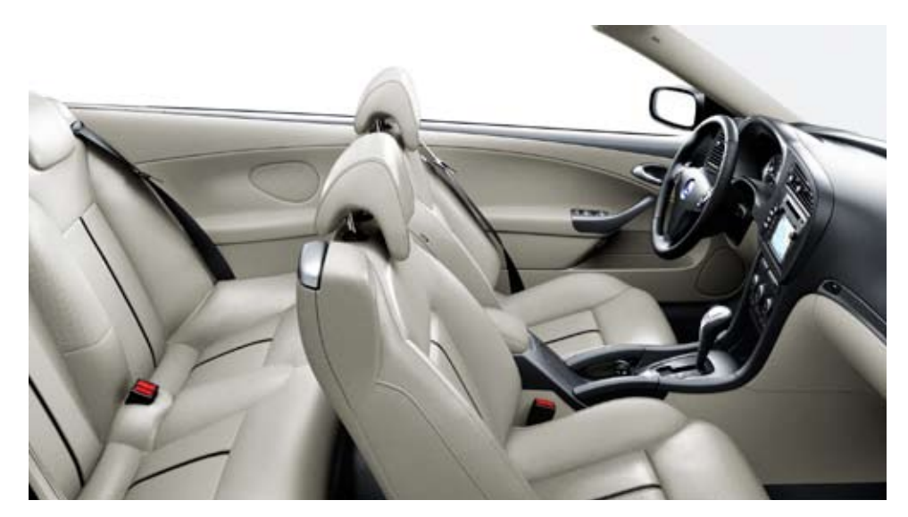
L65 Leather-appointed accent sport seats, Parchment (Saab 9-3 Convertible, Optional).

Leather-appointed upholstery refers to leather seating surfaces. Sport seats have pronounced extra side and thigh support.