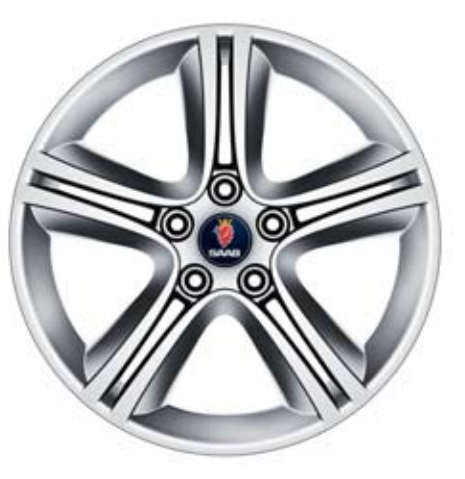
V-spoke 17×7" (ALU 79) (XWD only)