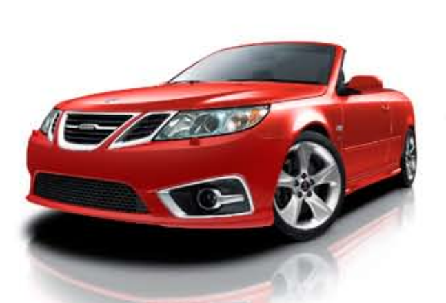
Saab 9-3 Convertible. A four-season, four-seater with a top that opens up in 20 seconds.

Saab 9-3 Sport Sedan. Designed around the driver. With 220 hp at hand.