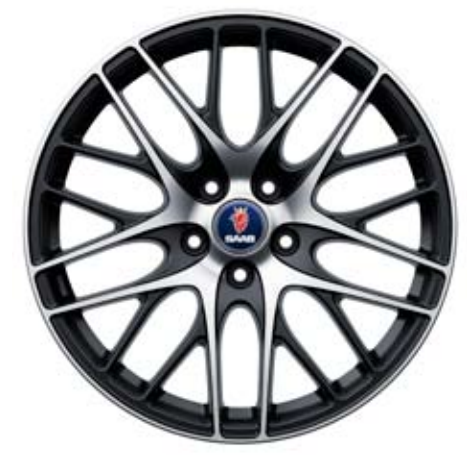
10-spoke Double Bridge 18 \times 7\frac{1}{2} " (ALU 108) ^*