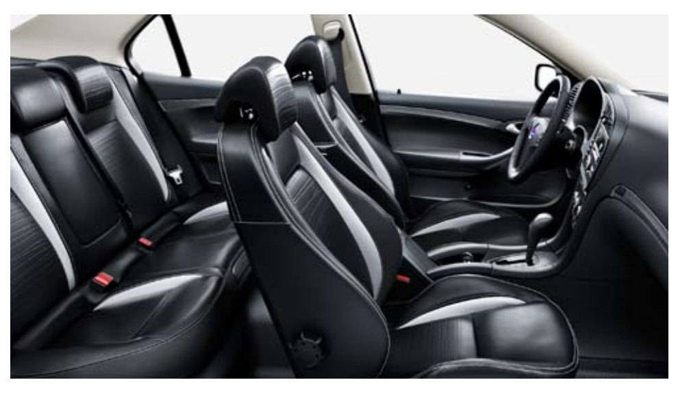
B63 Leather-appointed sport seats, Black (Saab 9-3 Sport Sedan, Optional).