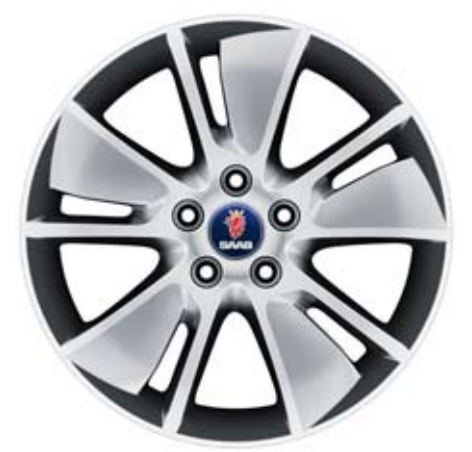
5-spoke 17×7½" (ALU 81)