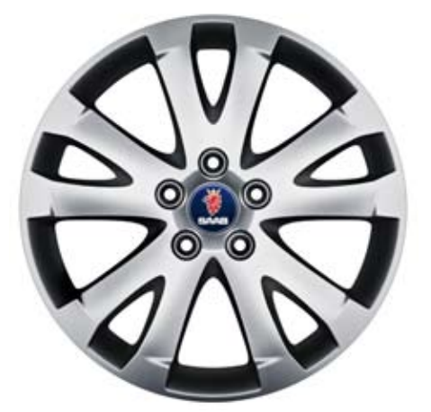
5-spoke Aktiv 17×7" (ALU 82) (9-3X only)