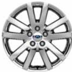
18" Chrome-Clad Aluminum Available on SEL