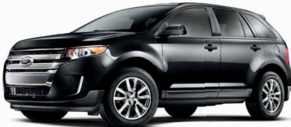
SEL. Tuxedo Black Metallic. Available equipment.