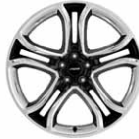
22" Polished Aluminum with Black Spoke Accents Standard