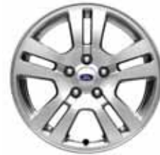
17" Painted Aluminum Standard on SE V6 FWD 2