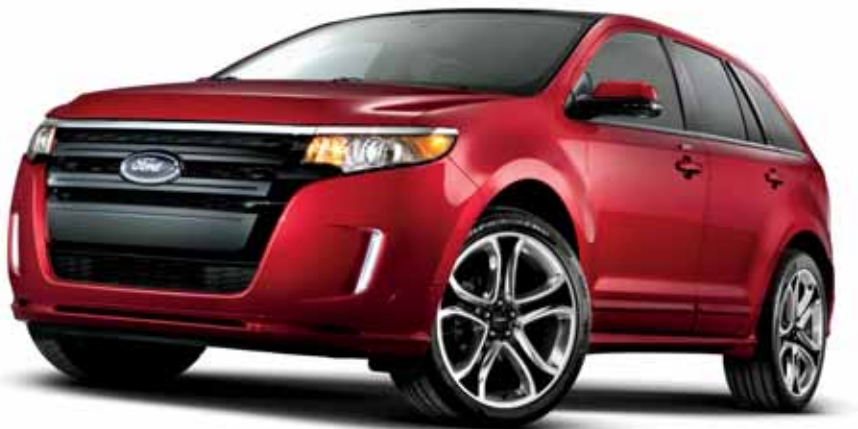
Ruby Red Metallic Tinted Clearcoat. Available equipment.

Visit accessories.ford.com to shop the complete collection