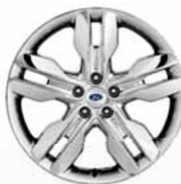
20" Chrome-Clad Aluminum Available on SEL