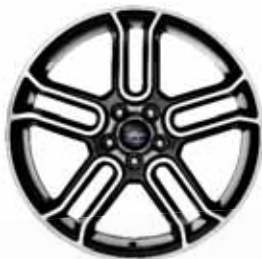
20" Painted-Black Aluminum with Machined Face Included with SEL Appearance Package

7 Charcoal Black Leather with Gray Alcantara ® Suede Perforated Inserts – Standard on SEL Appearance Package