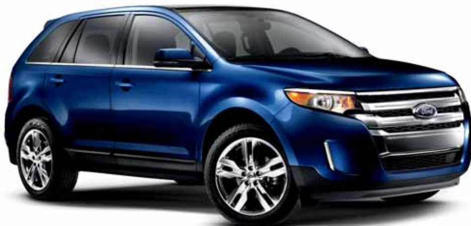
Deep Impact Blue Metallic. Available equipment.

Visit accessories.ford.com to shop the complete collection