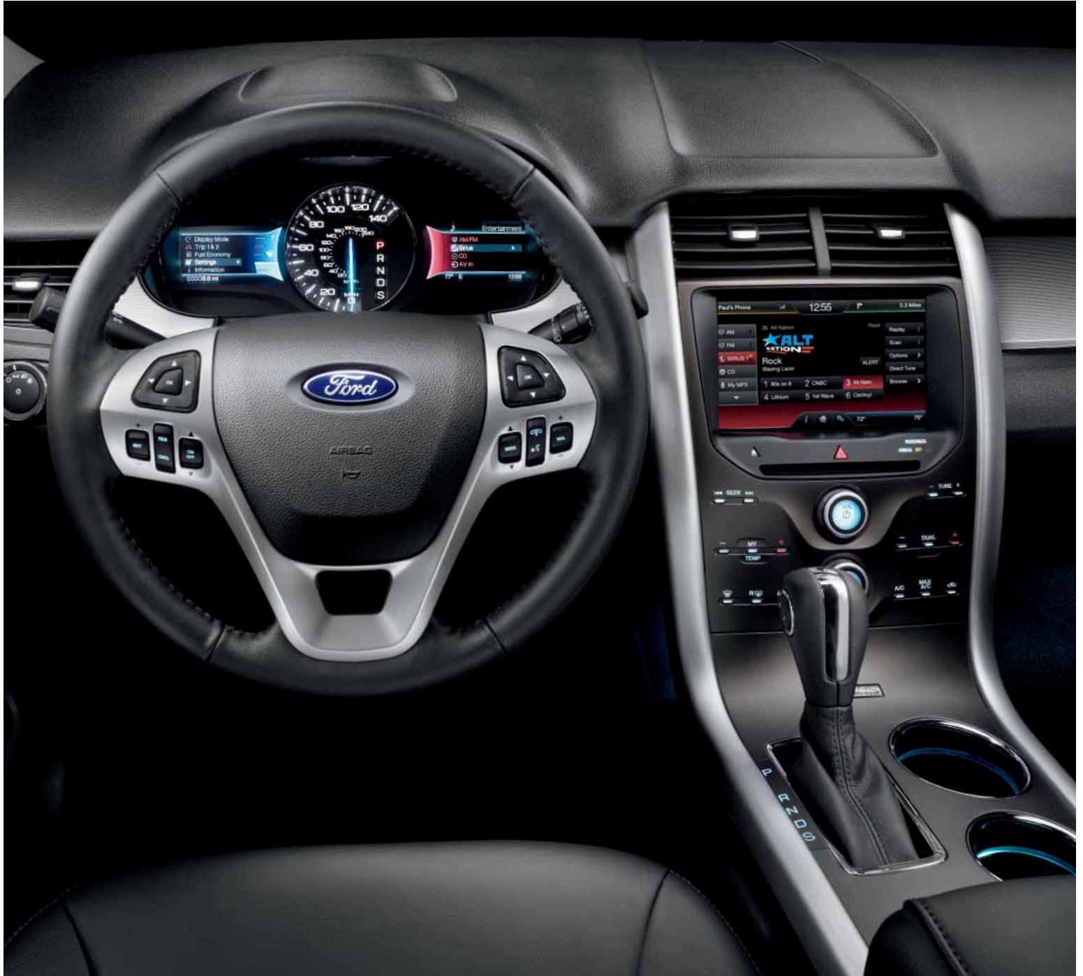
SEL. Charcoal Black leather trim. Available equipment. | 2.0L EcoBoost® I-4 engine! | MyFord® 4.2" color LCD display. | SEL Appearance Package. Charcoal Black leather with gray Alcantara® suede perforated inserts. | 12-volt powerpoint, one of 4.