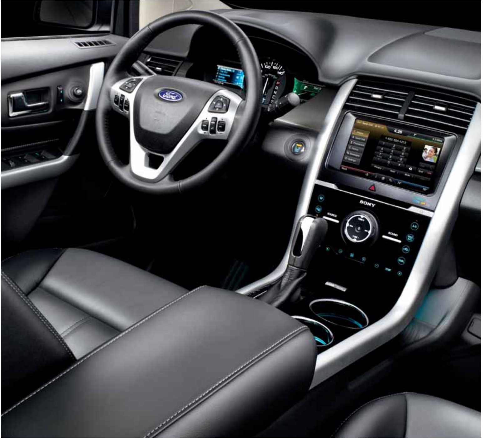
Charcoal Black leather trim. Available equipment. | Ambient lighting. | Chrome, oval exhaust tips. | Aluminum pedal covers. | 6-speed SelectShift Automatic® paddle shifters.