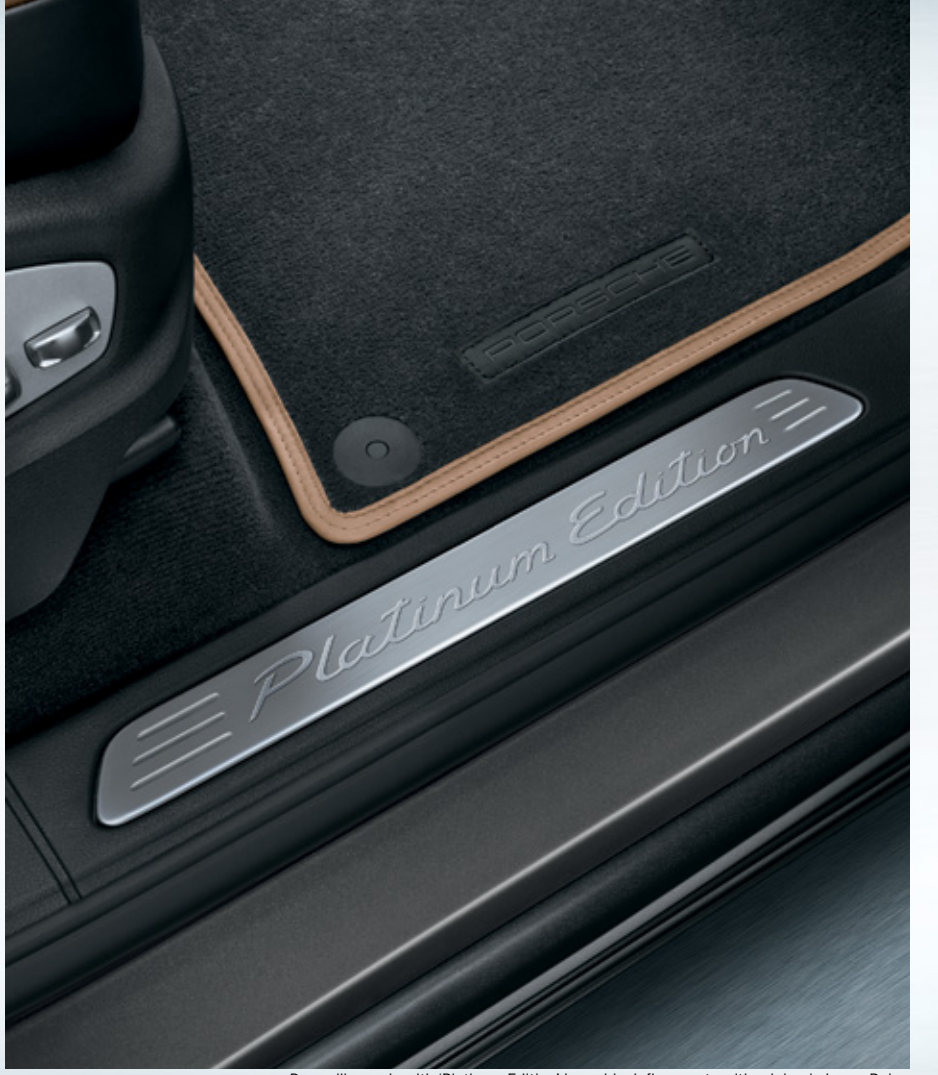
Door-sill guards with 'Platinum Edition' logo, black floor mats with edging in Luxor Beige

An interior that leaves nothing to be desired. The only thing that's missing is you.