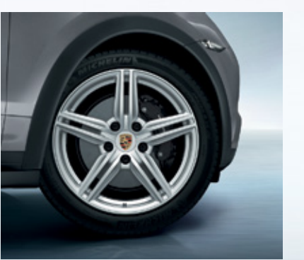
19-inch Cayenne Design II wheel, wheel center with full-color Porsche Crest

The dynamic suspension is matched by 19-inch Cayenne Design II wheels. Featuring wheel centers with full-color Porsche Crest, they perfectly underline the character of the car.