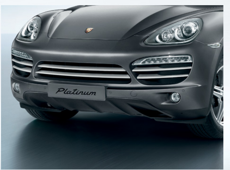
Slats in the front fascia