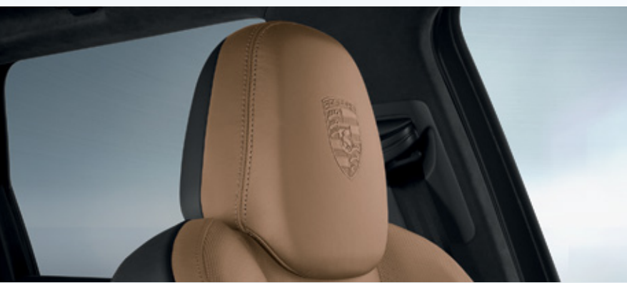
Porsche Crest embossed on head restraint