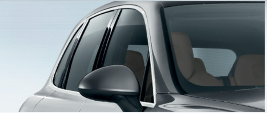
Side window surround and privacy glass

The Cayenne Platinum Edition models: pure-bred athletes worthy of precious metal.