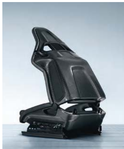
Sports bucket seats