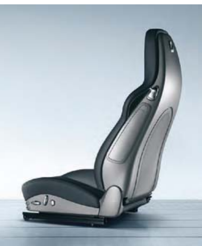
Adaptive sports seats