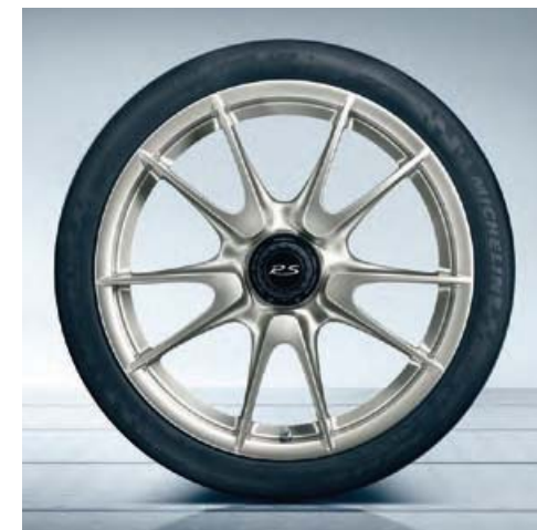
19-inch GT2 RS wheel

The dimensions: on the front axle 9 J x 19 with sports tyres 1) 245/35 ZR 19 and on the rear axle 12 J x 19 with sports tyres 1) 325/30 ZR 19. Tyre Pressure Monitoring (TPM) comes as standard and provides early warning of any tyre pressure loss via a display on the on-board computer.