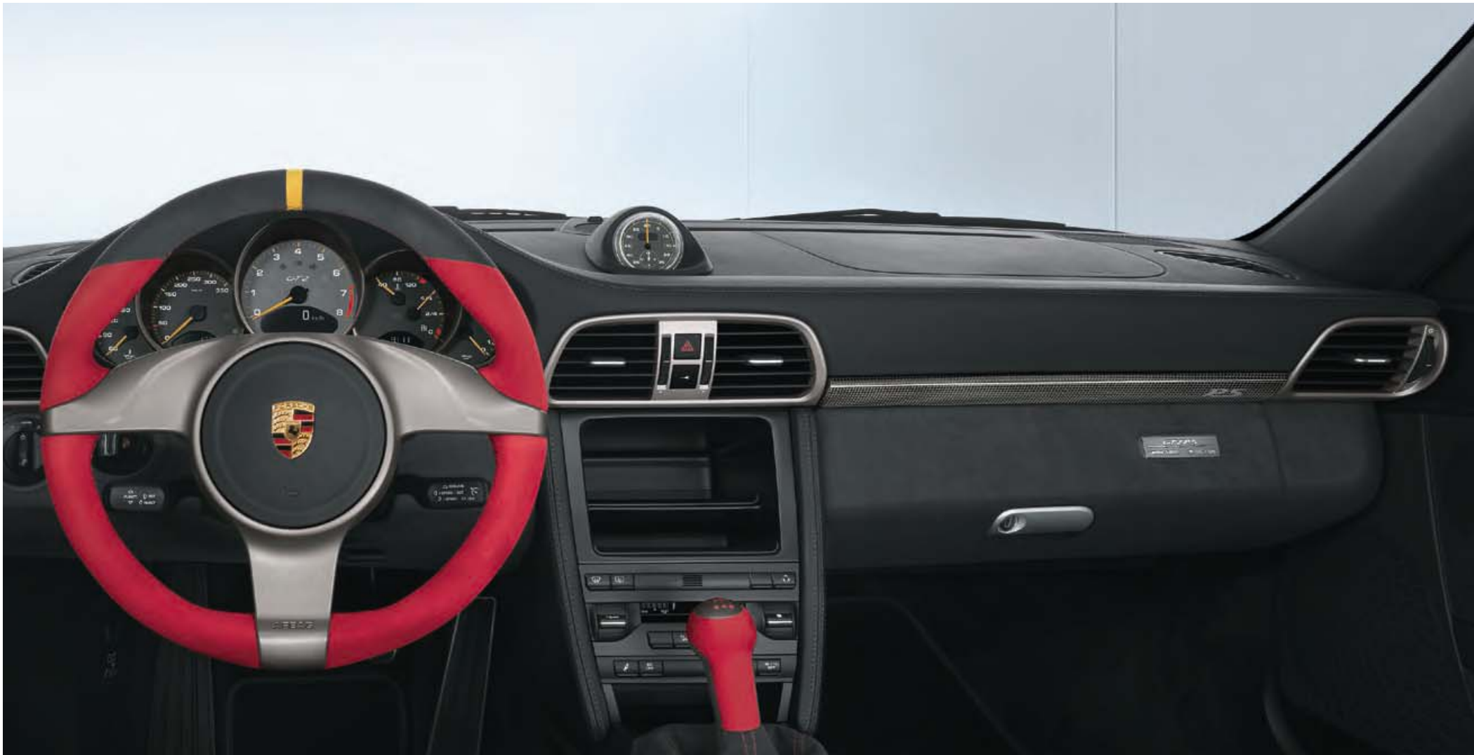
Leather/Alcantara trim in black/red and other optional equipment, including deletion of air conditioning and audio system, Chrono Package