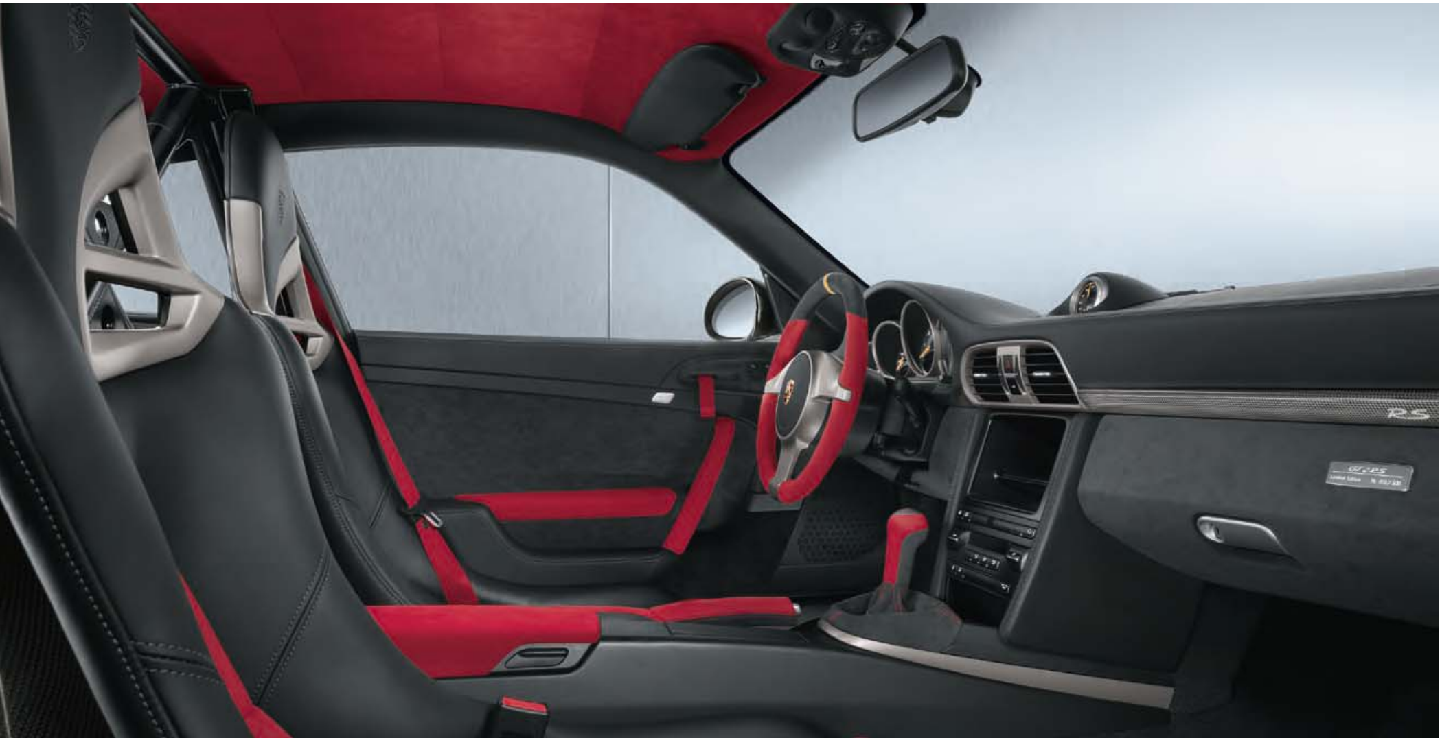
Leather/Alcantara trim in black/red and other optional equipment, including deletion of air conditioning and audio system, Chrono Package