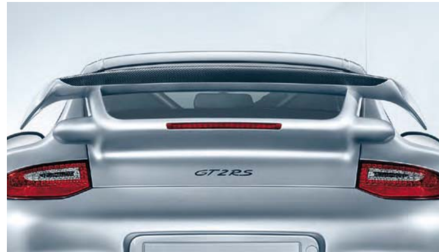
Rear middle section and rear wing lip in carbon