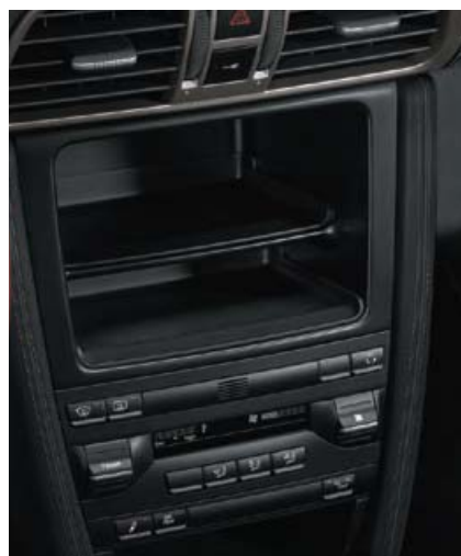
Deletion of air conditioning, audio system