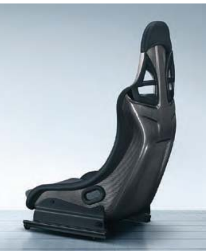
Lightweight bucket seats