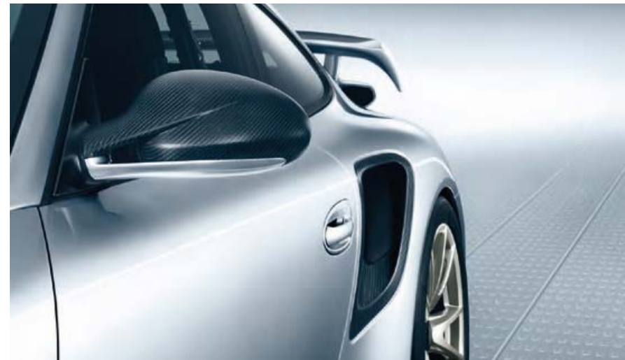
Exterior mirrors with carbon casing