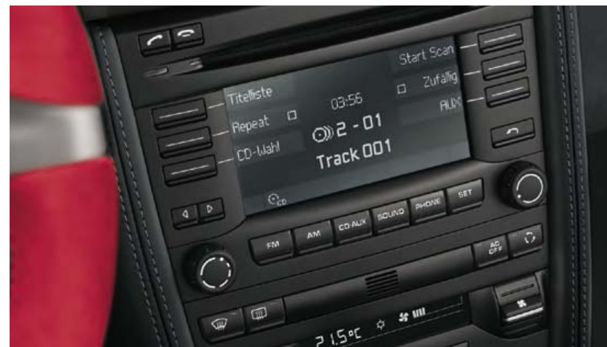
CDR-30 audio system

○ extra-cost option • standard equipment W available at no extra cost For more information on the individual options featured in this catalogue, please refer to the separate price list.