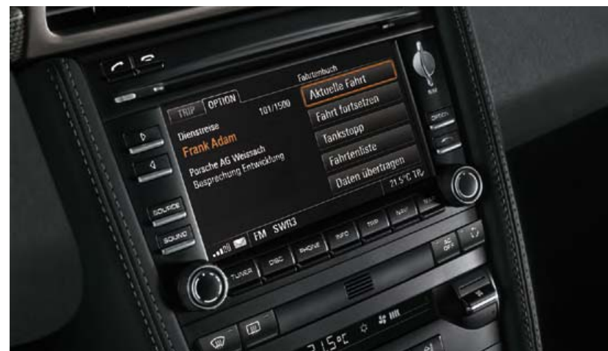
Porsche Communication Management (PCM)