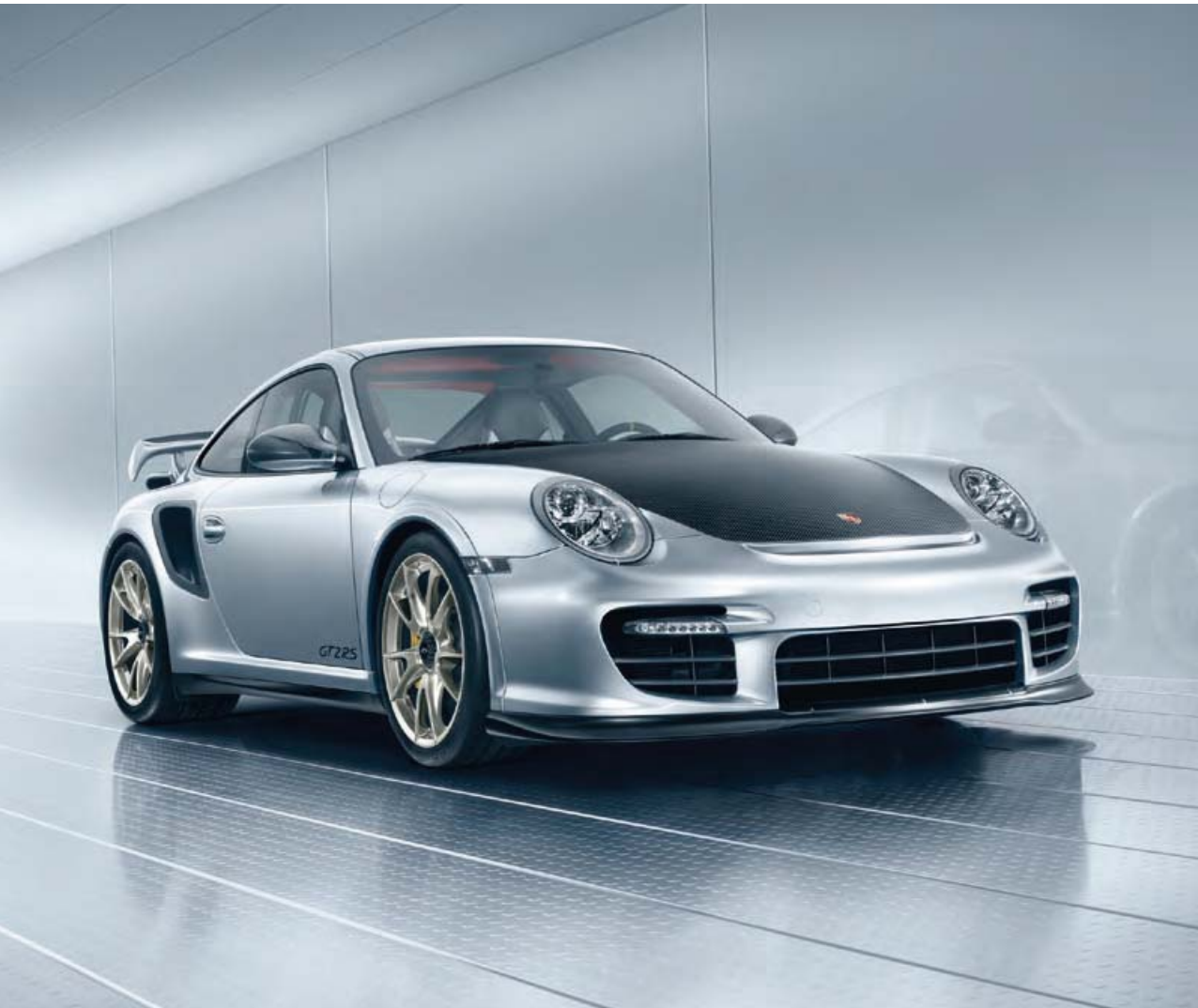
Front lid and side air intakes for the charge air cooler in carbon