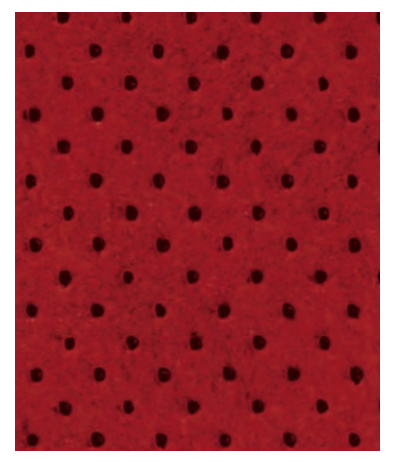
Black Leather/Red Alcantara® Inserts NISMO