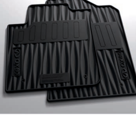
CARGO NET WITH CARPETED CARGO AREA PROTECTOR<sup>3</sup> ALL-SEASON FLOOR MATS