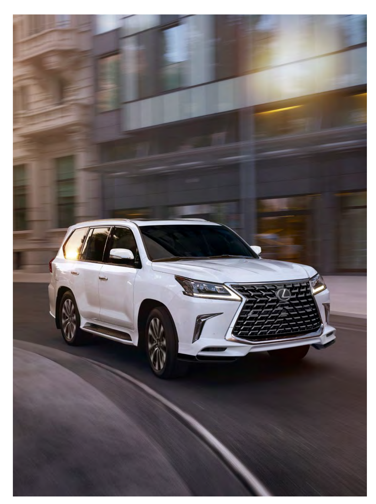
LX with Sport Package shown in Eminent White Pearl<sup>5</sup>