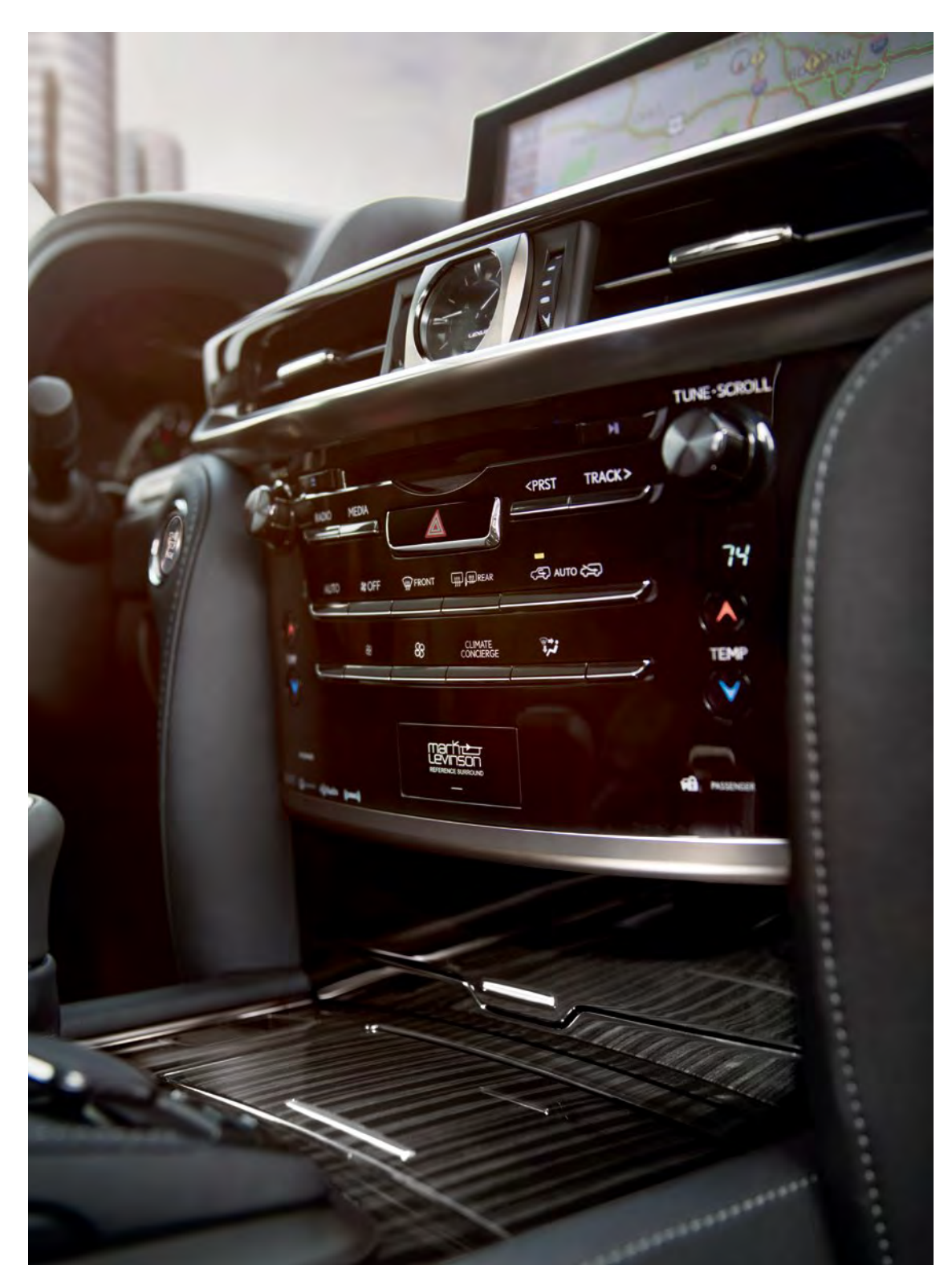
LX shown with Linear Espresso wood interior trim

With new Amazon Alexa<sup>13</sup> compatibility, you can enjoy the personalized convenience of your in-home assistant on the road. And with Lexus Enform<sup>14</sup> smartwatch functionality,<sup>15</sup> Lexus Safety System+<sup>3</sup> and premium features such as four-zone climate control and available Mark Levinson<sup>®16</sup> audio, the LX delivers innovation for the entire family to see and feel.