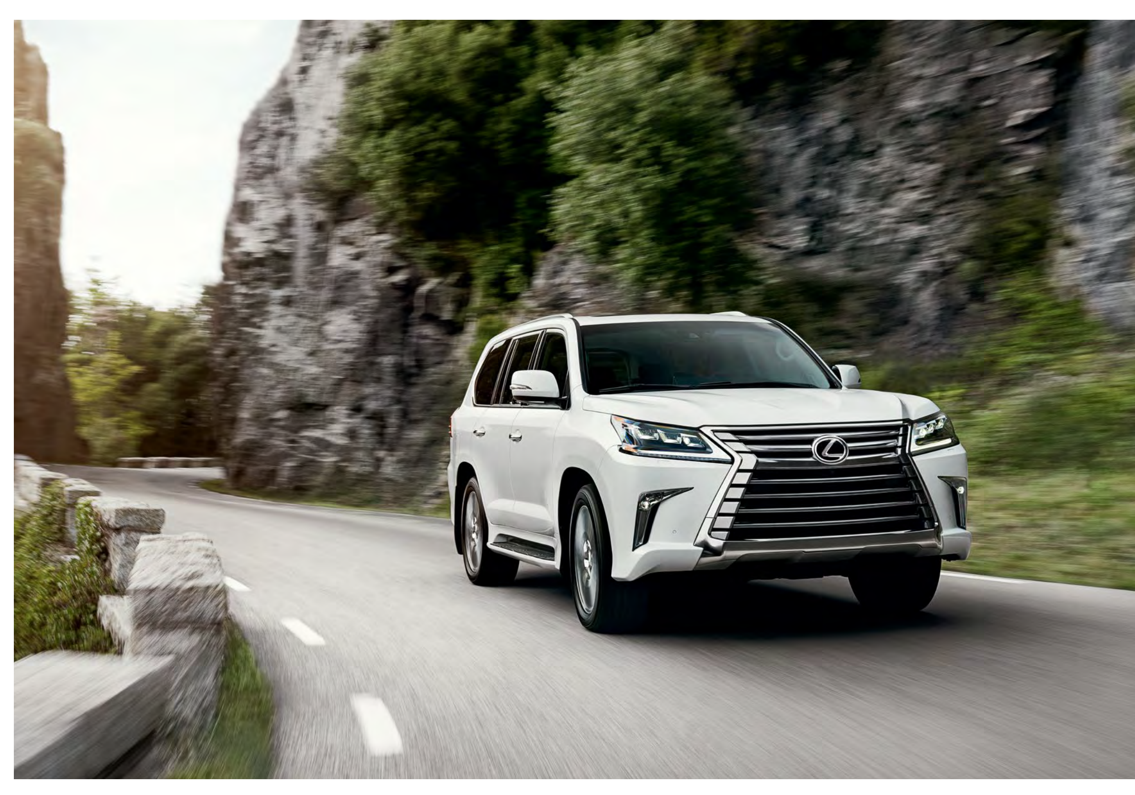
LX shown in Eminent White Pearl<sup>5</sup>

automatic transmission with paddle shifters