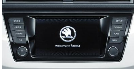
Radio Bolero - with telephone control, Mirror Link, USB, SD Card

Note: temporary spare wheel can be ordered as an option.