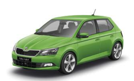
Rallye Green metallic