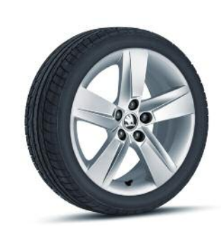
16" Rock alloys 7J x 16"