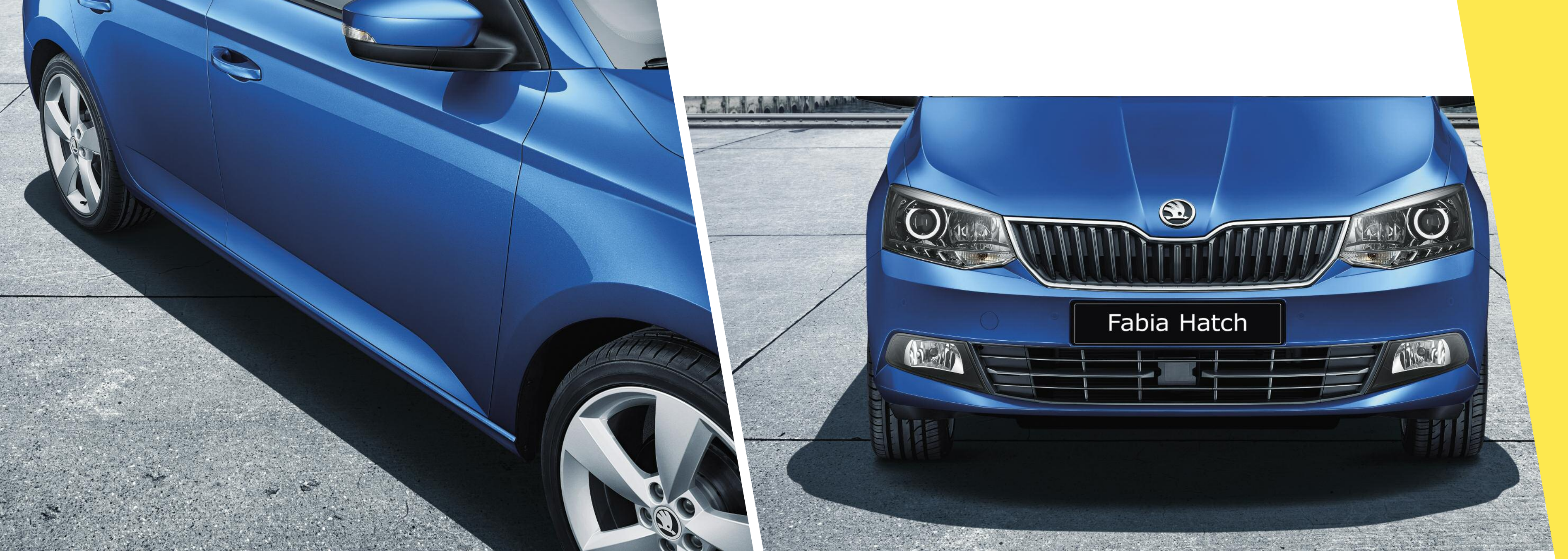
The new Fabia is as beautiful as it is dynamic. The dance between light and shadow continues, with strong distinctive lines running parallel across the body of the Fabia.