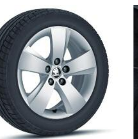
15" Mato alloys