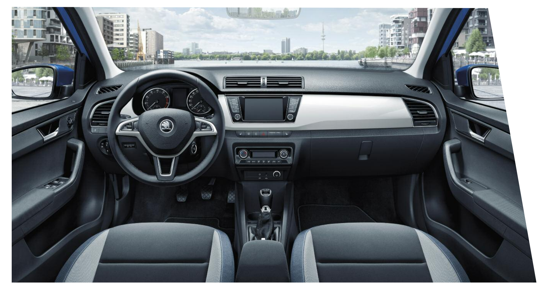
Personalise the interior with Blue upholstery and a white insert for the dashboard (available on SE and SE L).

Equally captivating is the car's interior, with quality materials and precise workmanship wherever you look. An emphasis on horizontal lines and fine-tuned ergonomics makes the interior of the new Fabia a comfortable, and surprisingly spacious place to be.