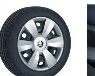
15" Dentro steel wheels