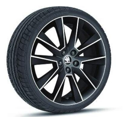
17" Savio metallic black Alloy wheel - The Fabia's distinct style can be further enhanced with the 17" Savio alloy wheels in metallic black. £200 each

These products are ŠKODA Genuine Accessories. You can also find information on the complete assortment of accessories at your authorised ŠKODA retailer. Prices include VAT.