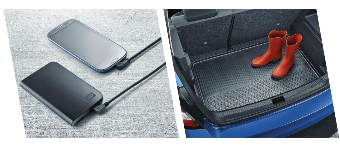
USB connecting cable - Mini / Micro / Apple The USB cable allows you to connect your mobile phone to the car for a range of functionalities. £23 / £30 (Apple)

Make life a work-in-progress. Keep building and keep tweaking until it's exactly what you want. Don't settle for mere extras. Let the add-ons add to who you are.