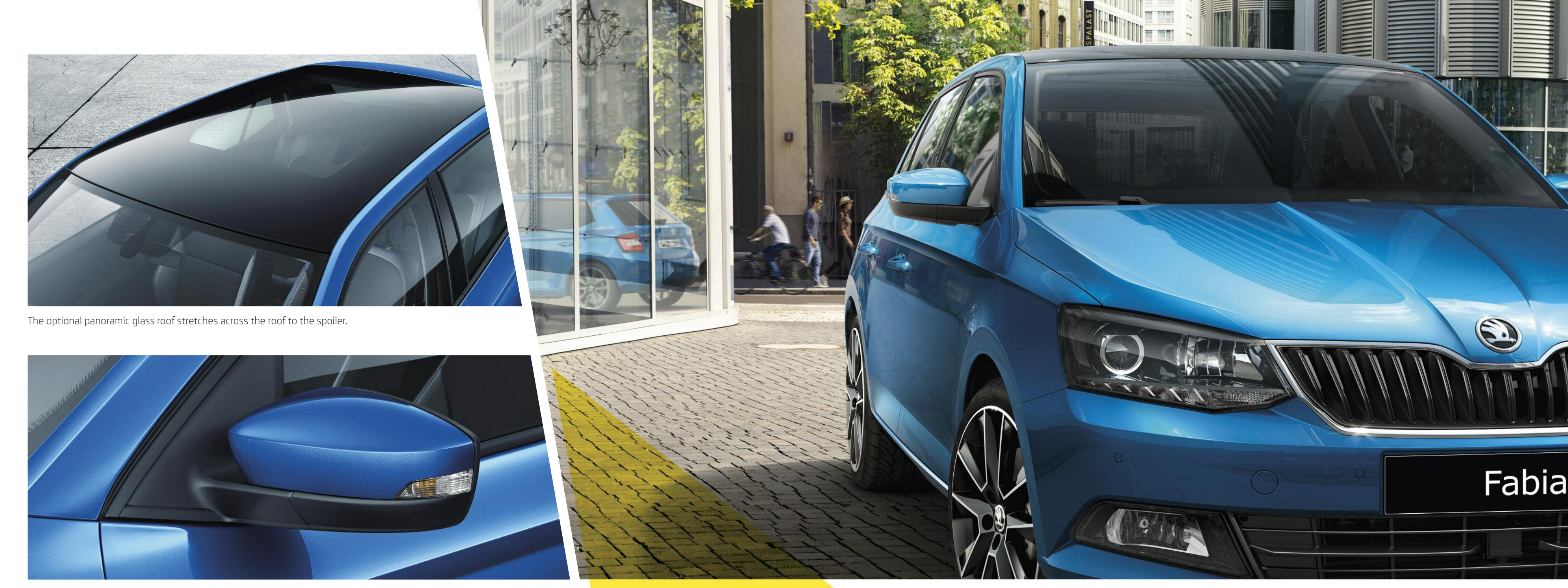
The side indicators have now been moved into the door mirrors creating a clean and sharp side profile.

The front grille contains 19 vertical slats, with the badge positioned in a prominent position on the bonnet. Daytime running lights with LED are available (optional on SE, standard on SE L) and front fog lights are also available with a cornering function (front fog lights are standard on SE L, cornering front fog lights are optional on SE and SE L).