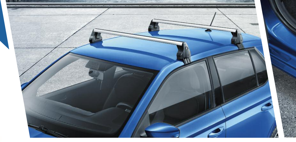
Basic roof rack - You can securely attach racks and holders onto the basic roof rack. £175