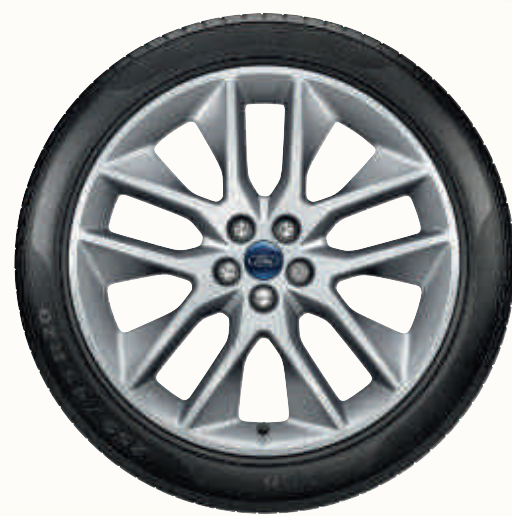
20" 5x2-spoke alloy wheel Option on Titanium (Fitted with 255/45 tyres)