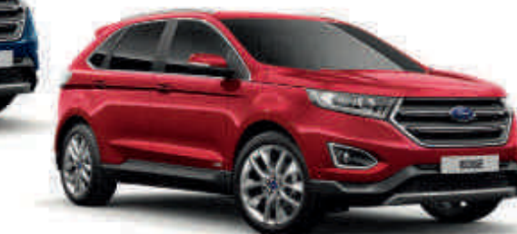
Ruby Red Exclusive Paint*