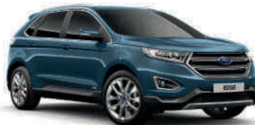
Nautilus Blue † Premium Paint*

Want to try different Edge configurations?