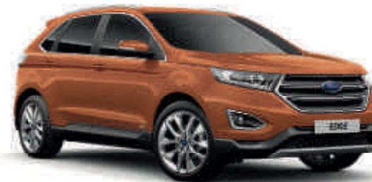
Canyon Ridge o Premium Paint*