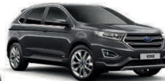
Magnetic Premium Paint*