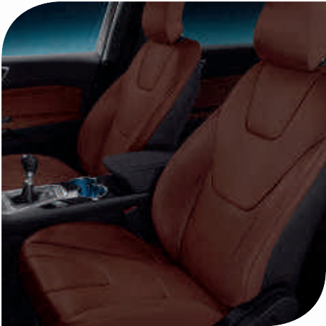
Salerno Micro Perf Leather in DarkSaddle*