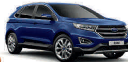
Kona Blue † Premium Paint*