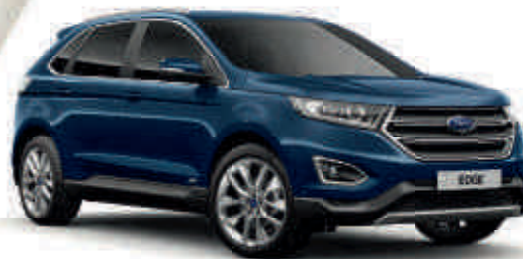
Blue Jeans o Premium Paint*