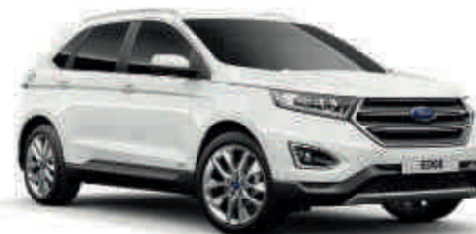
Oxford White Standard

† Available for production until the end of October 2016. o Available for production commencing early November 2016. *Premium and Exclusive paints are optional at extra cost. Your Edge is covered by the Ford Perforation Warranty for 12 years from the date of first registration. Subject to terms and conditions. Note The car images used are to illustrate body colours only and may not reflect current specification or product availability in certain markets. Colours and trims reproduced within this brochure may vary from the actual colours, due to the limitations of the printing processes used.