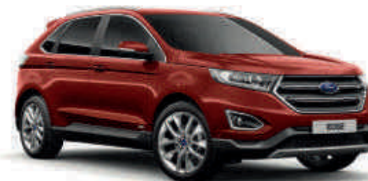
Bronze Fire † Exclusive Paint*