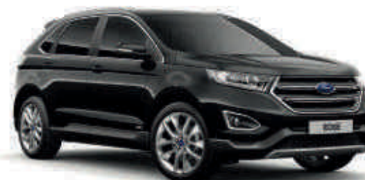
Shadow Black Premium Paint*