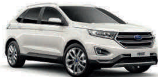
White Platinum Exclusive Paint*

The Ford Edge owes its beautiful and durable exterior to a special multi-stage painting process. From the wax-injected steel body sections to the protective top coat, new materials and application processes ensure your Edge will retain its good looks for many years to come.