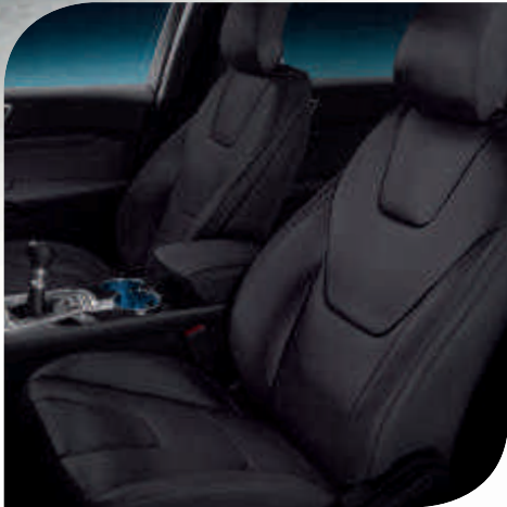
Salerno Leather in Ebony*