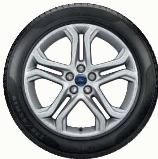
19" 5x2-spoke alloy wheel Standard on Titanium (Fitted with 235/55 tyres)