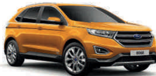
Electric Spice † Premium Paint*