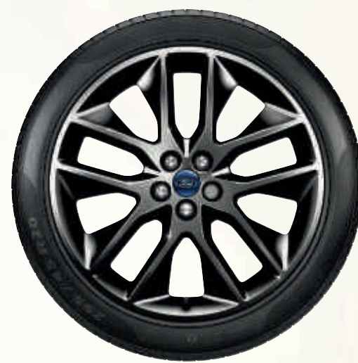
20" 5x2-spoke alloy wheel Standard on Sport (Fitted with 255/45 tyres)