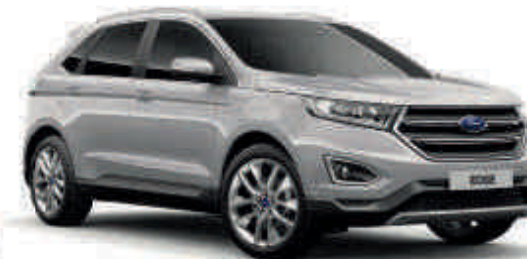
Ingot Silver Premium Paint*