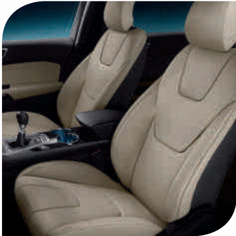
Perforated Leather in Ceramic*

Experience more with the Interactive Brochure. To access, simply download the FordStand App from the Google Play or App Store.