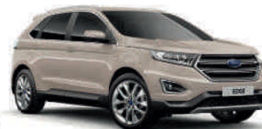
White Gold o Premium Paint*