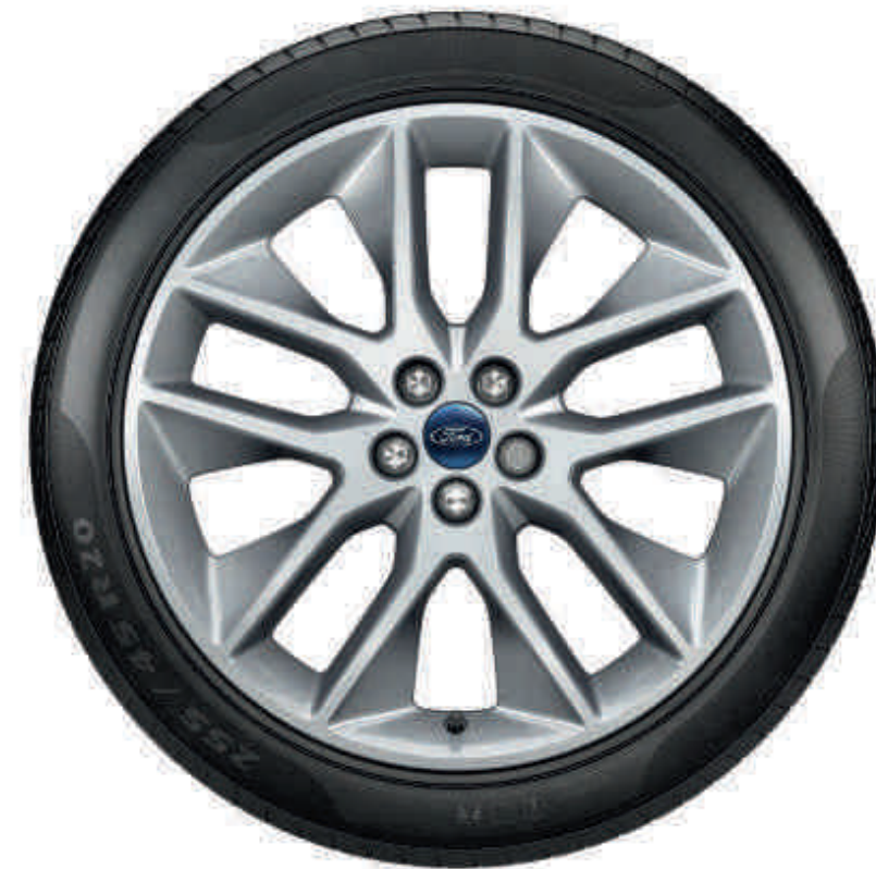
20" 5x2-spoke alloy wheel (Option and accessory on Titanium only)

Contoured mudflaps help to keep your Ford Edge clean by protecting it from road spray and stone chips. Available as sets for front and rear. (Accessory, not available on Sport)