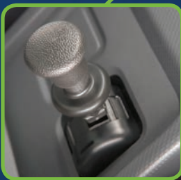
Parking Air Brake