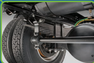
Rear Leaf Springs