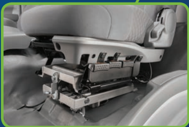
Suspension Seat with Adjustable Height Control