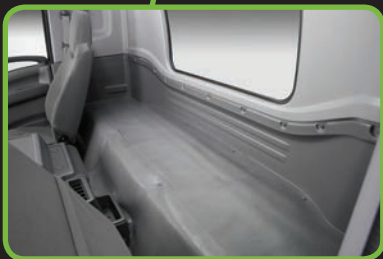
Large Storage Area Behind Seats