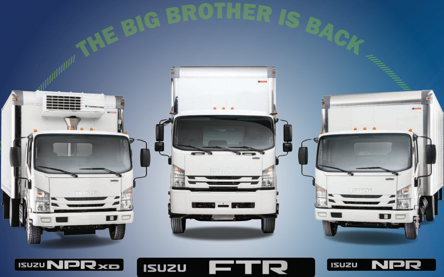
ISUZU NPR XD