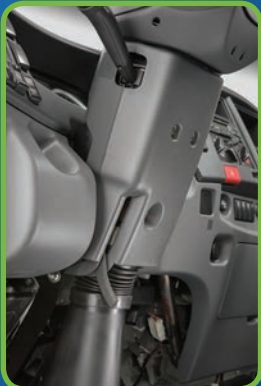
Tilt and Telescopic Steering Column