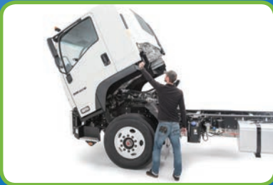
Tilt Cab for Ease of Maintenance