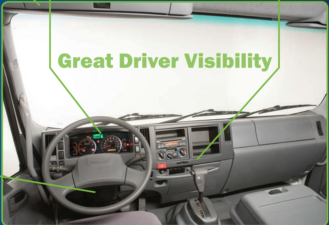
Great Driver Visibility