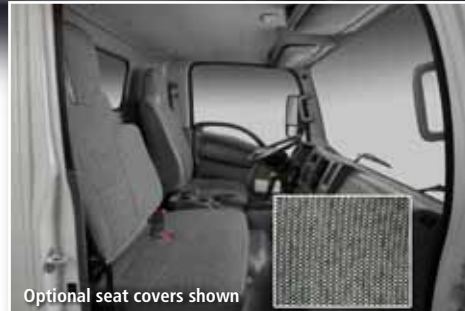
Optional seat covers shown