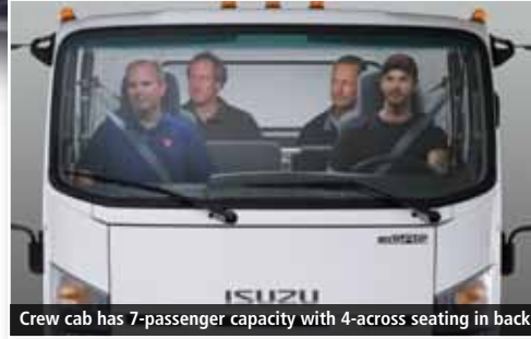
Crew cab has 7-passenger capacity with 4-across seating in back