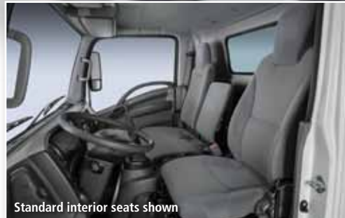
Standard interior seats shown