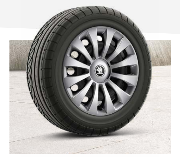
15" COSTA STEEL WHEELS