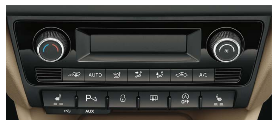
CLIMATE CONTROL AIR CONDITIONING