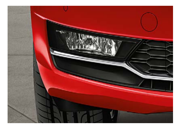
CORNERING FRONT FOG LIGHTS