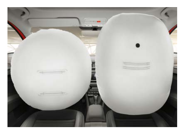
DRIVER AND PASSENGER AIRBAGS