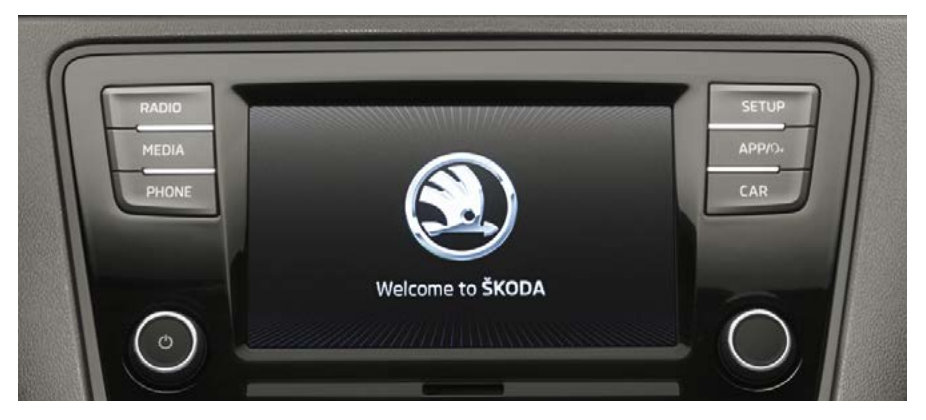
SWING RADIO WITH 6.5" TOUCHSCREEN DISPLAY