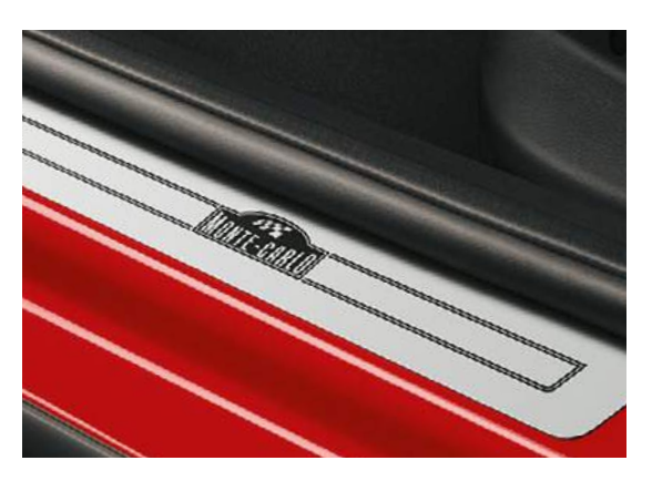
DOOR SILL INSERTS WITH MONTE CARLO LOGO (FRONT ONLY)