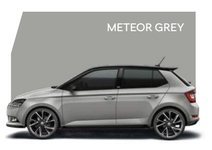
*Not available on Monte Carlo