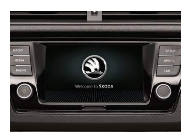
SWING RADIO WITH 6.5" TOUCHSCREEN DISPLAY