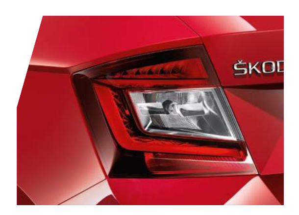
LED REAR LIGHTS

A celebration of ŠKODA's success at the legendary Monte Carlo Rally, this premium level combines luxury and glamour with pulse-racing sports styling.