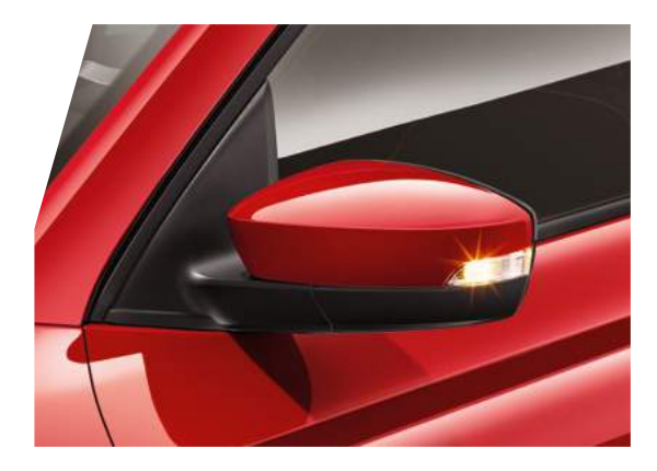
ELECTRICALLY ADJUSTABLE AND HEATED DOOR MIRRORS

Loaded with standard equipment and thoughtful touches, this entry-level trim impresses at every turn.