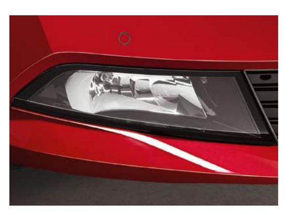
FRONT FOG LIGHTS