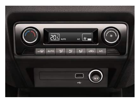
CLIMATE CONTROL AIR CONDITIONING