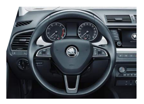
THREE-SPOKE MULTIFUNCTION LEATHER STEERING WHEEL

Offering increased security, enhanced comfort and more driver assist systems, the SE delivers style with distinction.