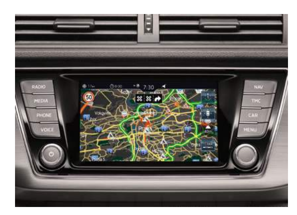
AMUNDSEN SATELLITE NAVIGATION