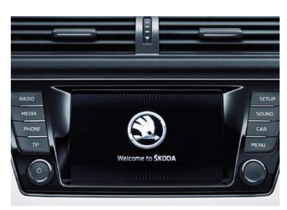
SWING PLUS RADIO WITH 6.5" TOUCHSCREEN DISPLAY