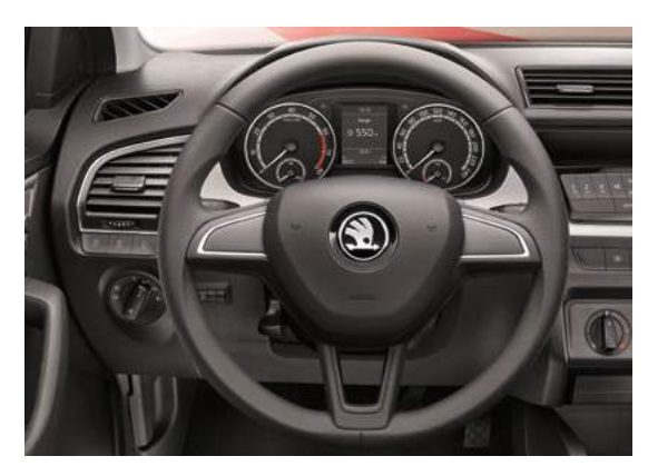
HEIGHT AND REACH ADJUSTABLE THREE-SPOKE STEERING WHEEL