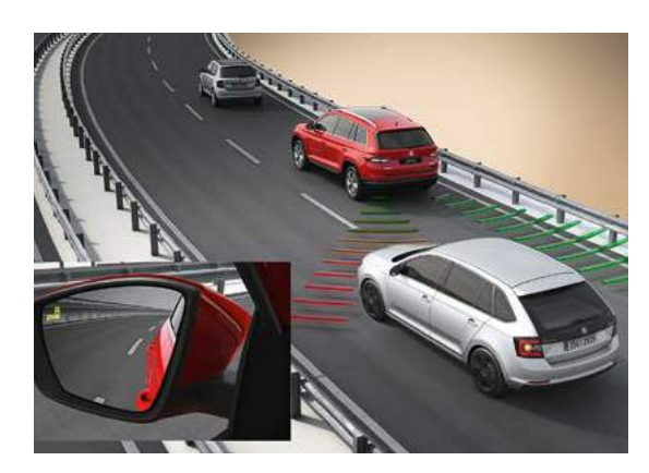
BLIND SPOT DETECTION