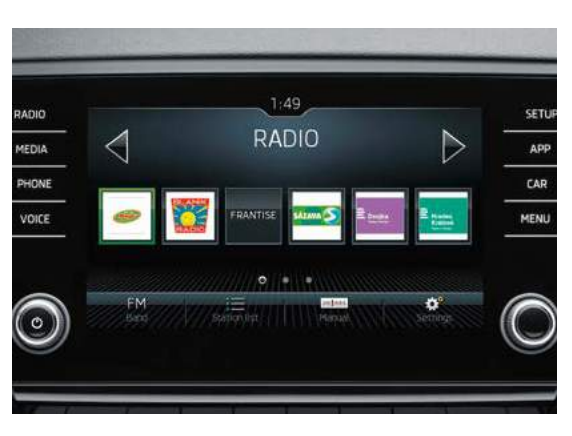
BOLERO RADIO WITH 8" TOUCHSCREEN DISPLAY