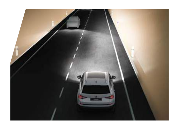
LIGHT ASSIST WITH HIGH BEAM CONTROL

To showcase the best features the KODIAQ has to offer, the Edition features an extensive range of connected and assist systems fit for any adventure.