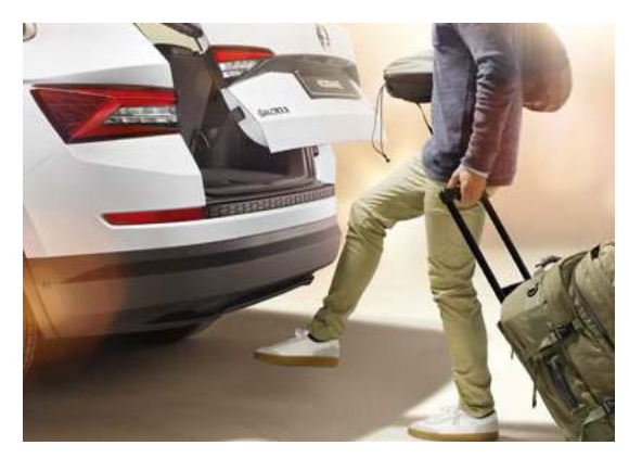
ELECTRICALLY OPERATED BOOT AS STANDARD, WITH OPTIONAL KICK ACTIVATION (VIRTUAL PEDAL)