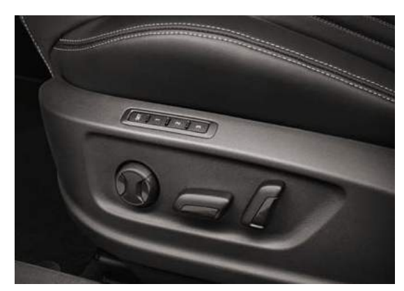
ELECTRICALLY ADJUSTABLE FRONT SEATS WITH MEMORY FUNCTION