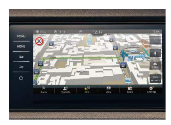
COLUMBUS SATELLITE NAVIGATION WITH 9.2" TOUCHSCREEN DISPLAY AND INTEGRATED WI-FI