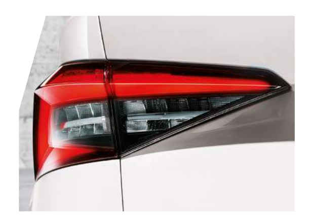
REAR LED LIGHTS (HIGH FUNCTIONALITY)

With an impressive amount of standard equipment, the KODIAQ SE L is the perfect blend of practicality and specification.