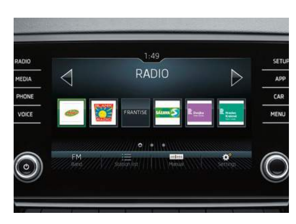
BOLERO RADIO WITH 8" TOUCHSCREEN DISPLAY