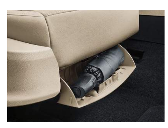
UMBRELLA UNDER PASSENGER SEAT