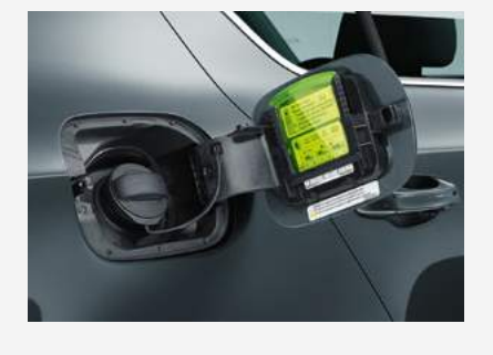
FUEL DOOR With fuel-fill protection, you'll never load up with the wrong fuel again. You'll also find a handy ice scraper on the fuel door for those frosty mornings.