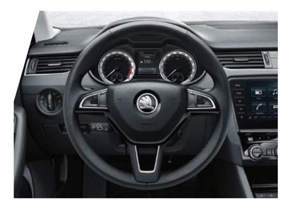
3-SPOKE LEATHER MULTIFUNCTION STEERING WHEEL

Featuring impressive comfort enhancing features and intuitive driver assist systems, the SE adds further distinction to the car.