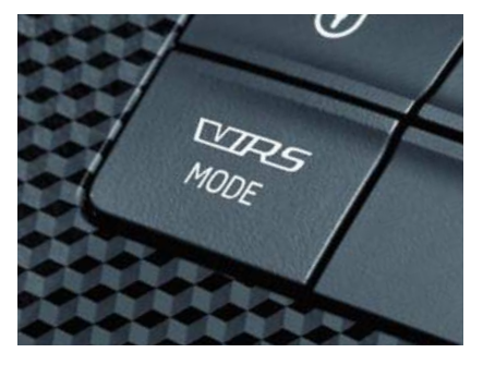
PERFORMANCE MODE SELECT

Proof that practicality can still be striking, the door sill strips feature the vRS inscription to further enhance the car's character.