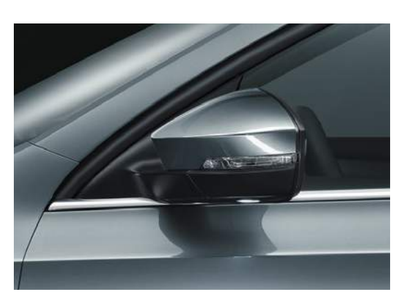
BODY COLOURED DOOR MIRRORS AND HANDLES