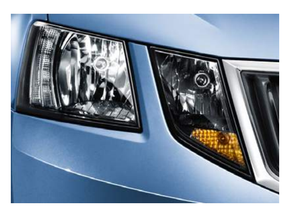
HALOGEN HEADLIGHTS WITH LED DAYTIME-RUNNING LIGHTS