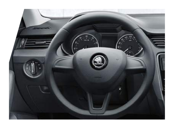
3-SPOKE LEATHER STEERING WHEEL

Anything but standard, this entry-level trim is packed with features and thoughtful touches.