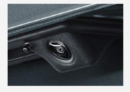
Located on the boot handle, the rearview camera makes light work of reverse parking, with an integrated washer to keep obstacles visible.