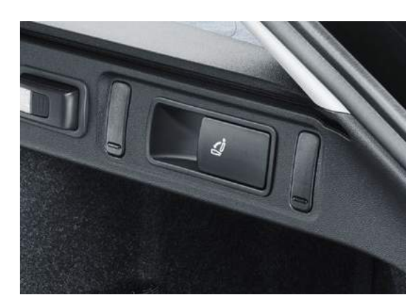
REAR BACKREST RELEASE