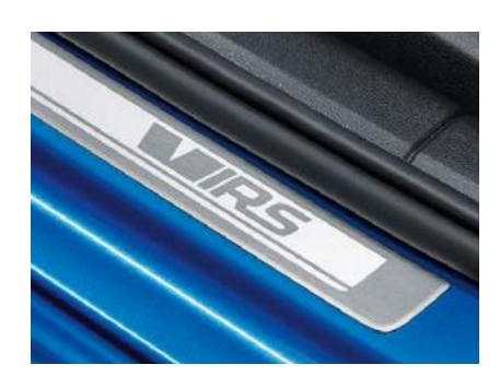
DOOR SILL STRIPS

Enhance the sportiness of the exterior with a choice of alloy wheels.