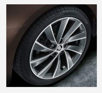
18" TURBINE ALLOY WHEELS