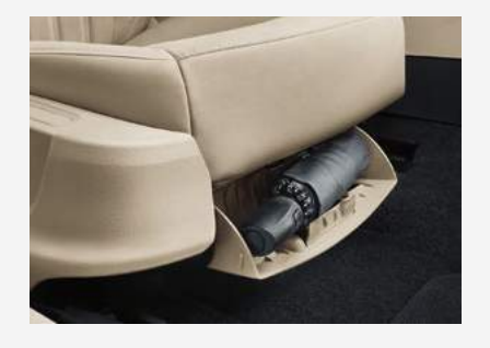
UMBRELLA STORAGE A spot of rain will never dampen your spirits again thanks to the umbrella located under the passengers seat.