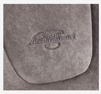
EMBROIDERED LOGO ON SEAT BACKRESTS