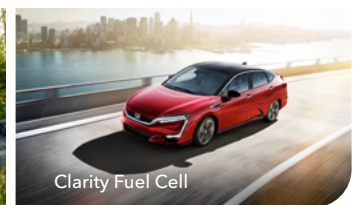
Clarity Fuel Cell