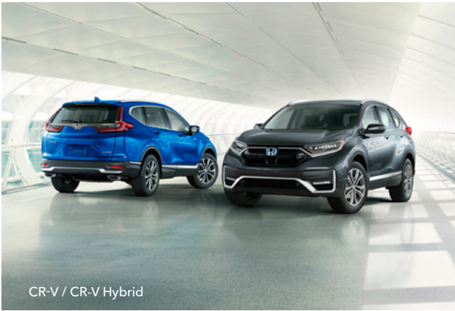
CR-V / CR-V Hybrid