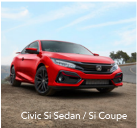
Civic Si Sedan / Si Coupe