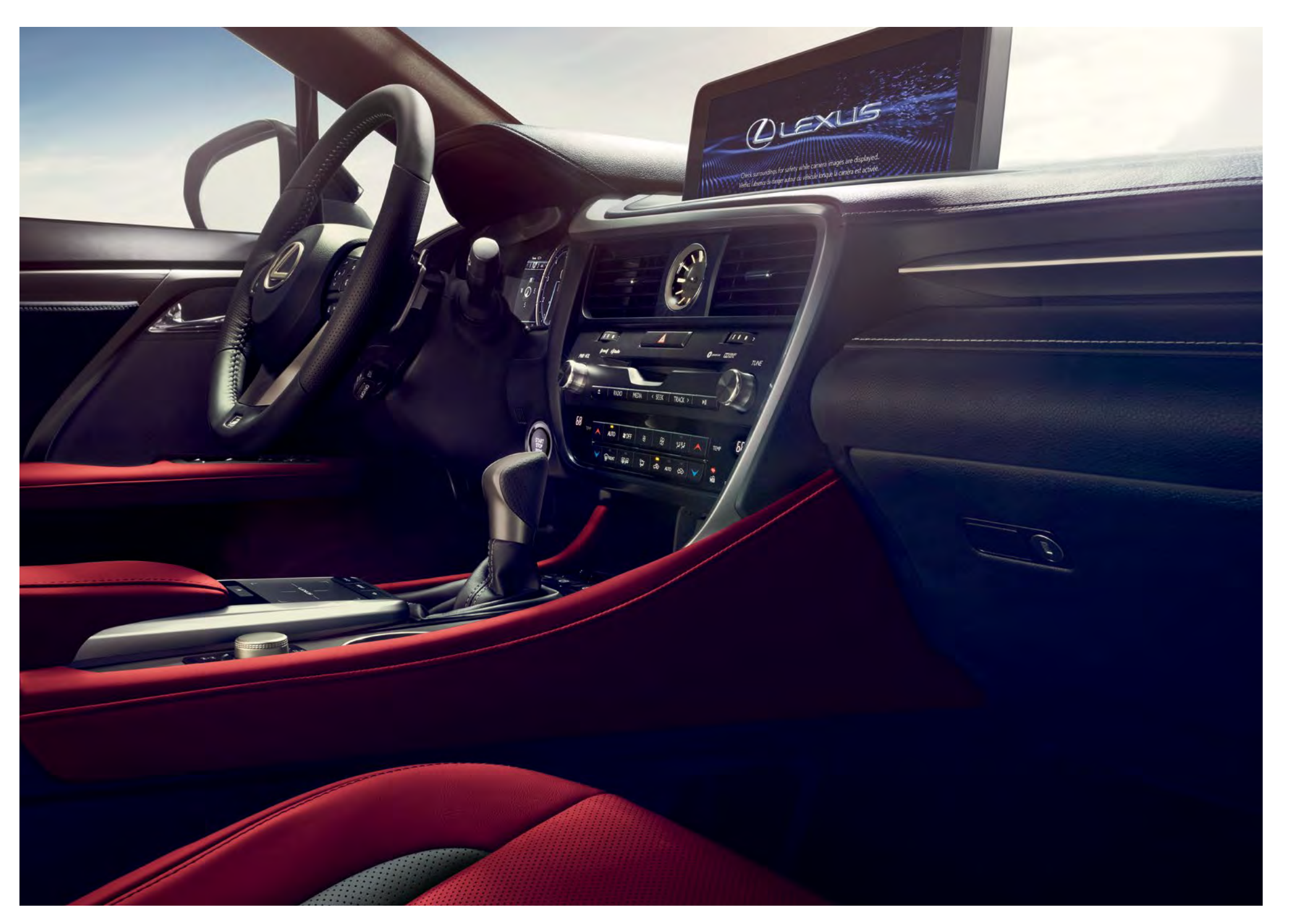
RX FSPORT shown with Circuit Red NuLuxe ^{@10} and Scored Aluminum interior trim

Customize the climate around you. Individual settings allow the driver and front passenger to adjust their preferred temperatures. Plus, the RX 350L and RX 450hL feature dedicated climate control for passengers in the third row. To help ensure the cabin stays fresh, an available smog-sensing climate-control system automatically switches into recirculation mode if it senses high levels of pollutants outside.