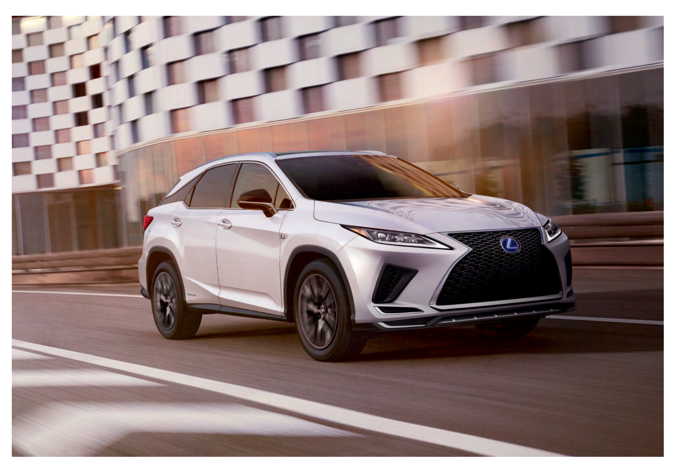
RXh F SPORT shown in Ultra White<sup>9</sup>

Craving more of an edge? The RX 450h F SPORT adds bold styling and offers an Adaptive Variable Suspension that takes exhilaration even further.