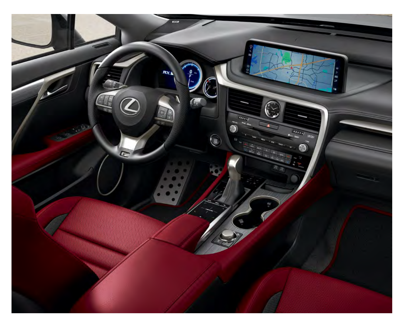
RX F SPORT shown with Circuit Red NuLuxe®10 and Scored Aluminum interior trim

The bold F SPORT perspective is obvious throughout the driver-centric interior. In addition to exclusive race-inspired instrumentation and bold aluminum accents, you'll find performance upgrades, including bolstered sport seats, a black headliner, a perforated leather-trimmed sport steering wheel and shift knob, plus aluminum pedals and more.