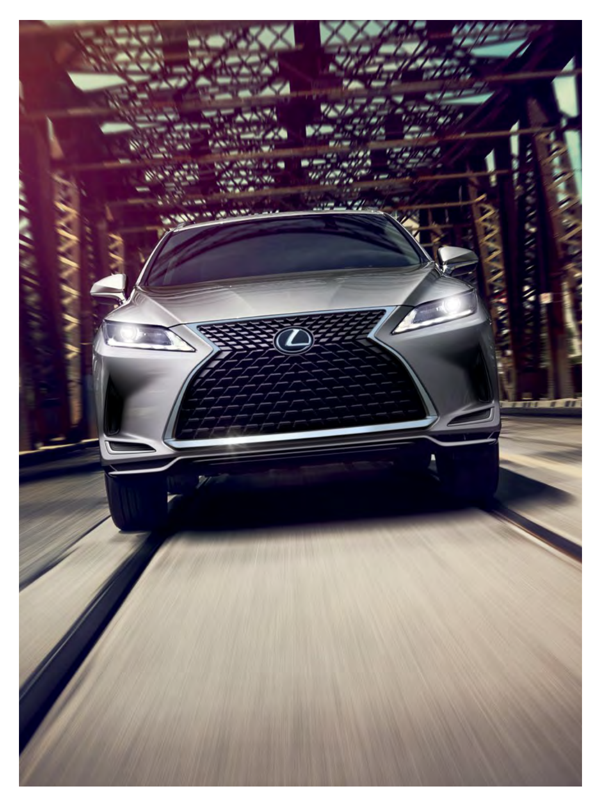
RX shown in Atomic Silver