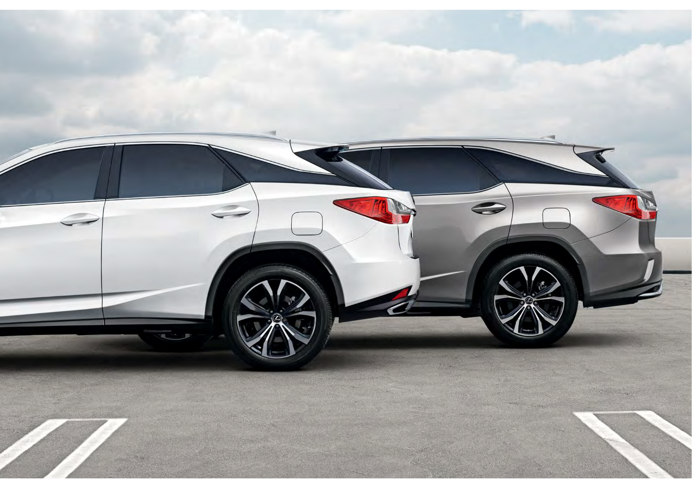
EXPECTATIONS Discover refined styling, or