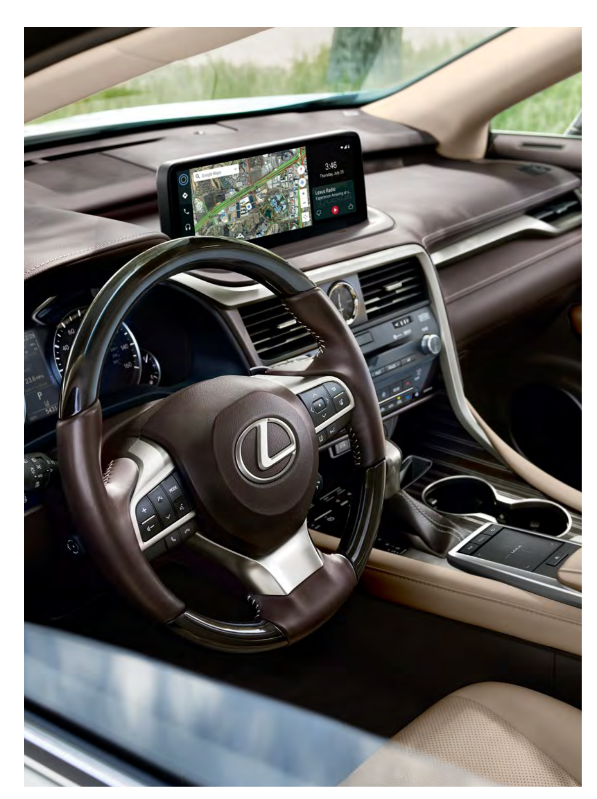
RXL shown with Parchment semi-aniline leather and Gray Sapele wood with Aluminum interior trim