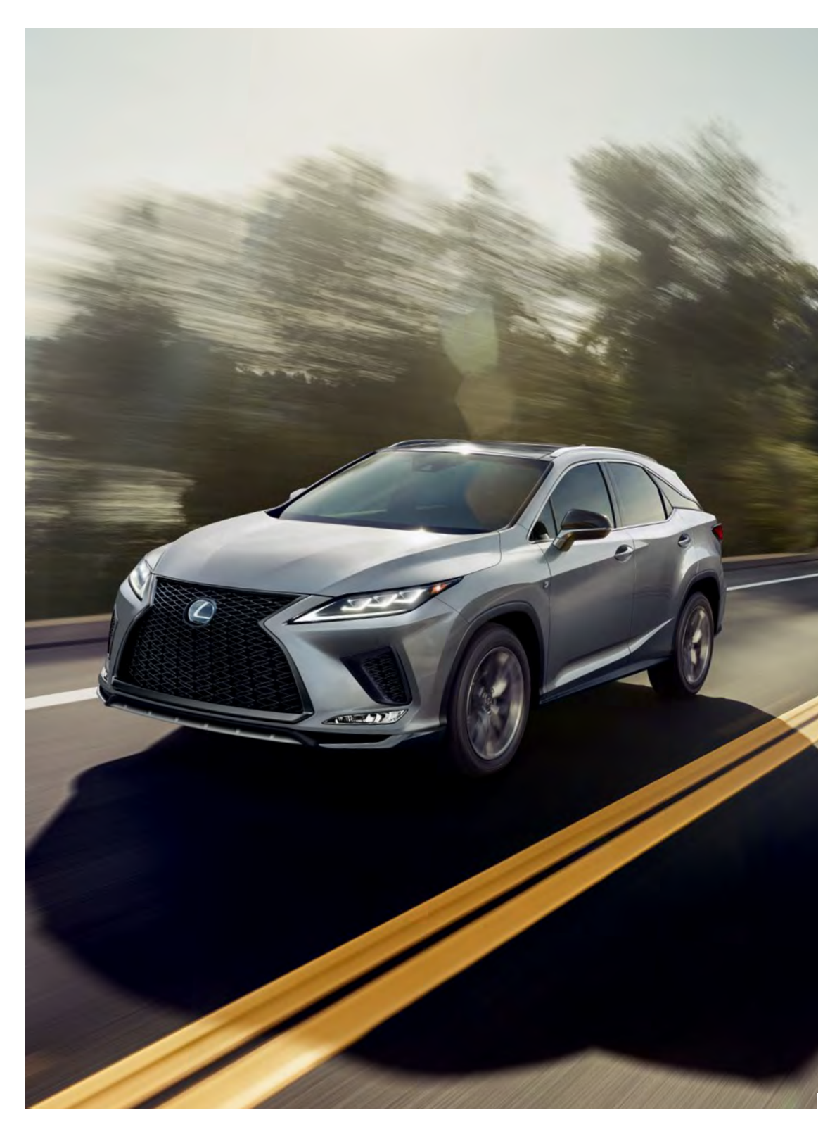
RX F SPORT shown in Atomic Silver