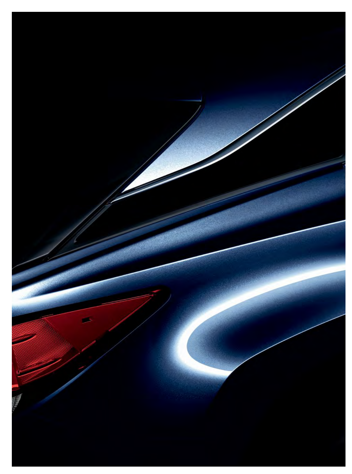
RX shown in Nightfall Mica