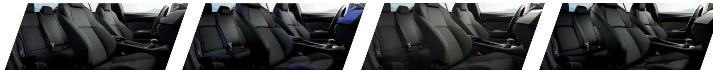
LE fabric shown in Black with Gunmetal accent