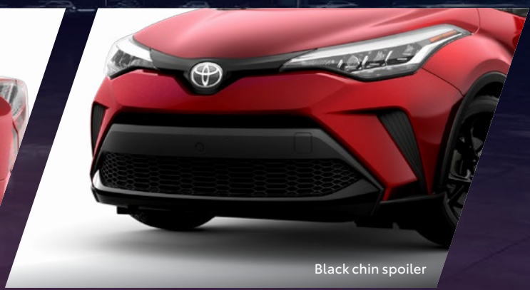
Black chin spoiler