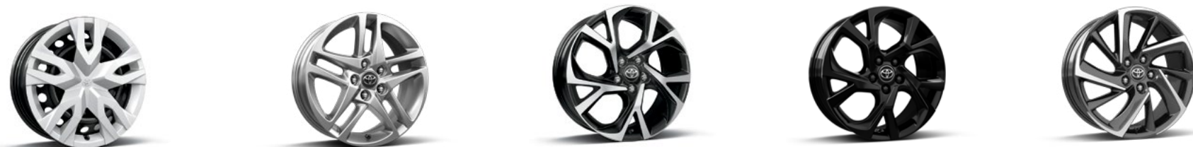
17-in. steel wheel