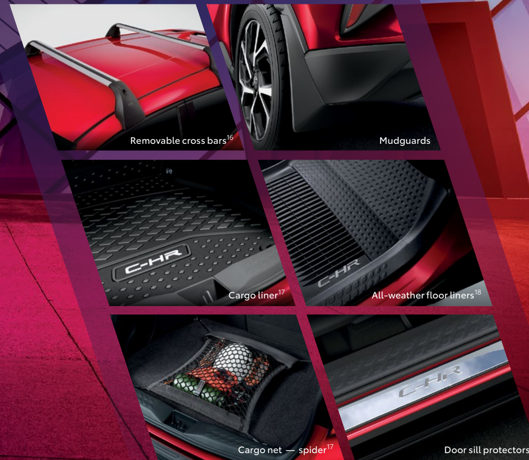
Removable cross bars 16

Add a personal touch to your C-HR with Genuine Toyota Accessories.