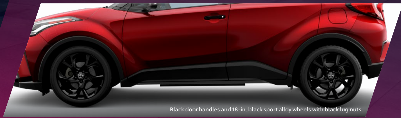
Black door handles and 18-in. black sport alloy wheels with black lug nuts