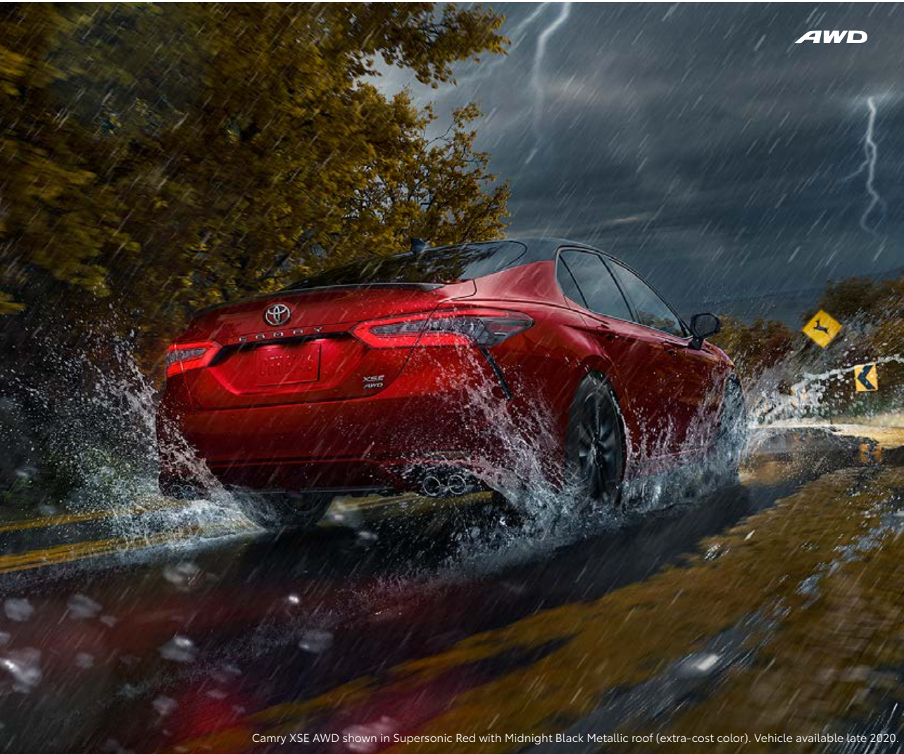
Camry XSE AWD shown in Supersonic Red with Midnight Black Metallic roof (extra-cost color). Vehicle available late 2020.