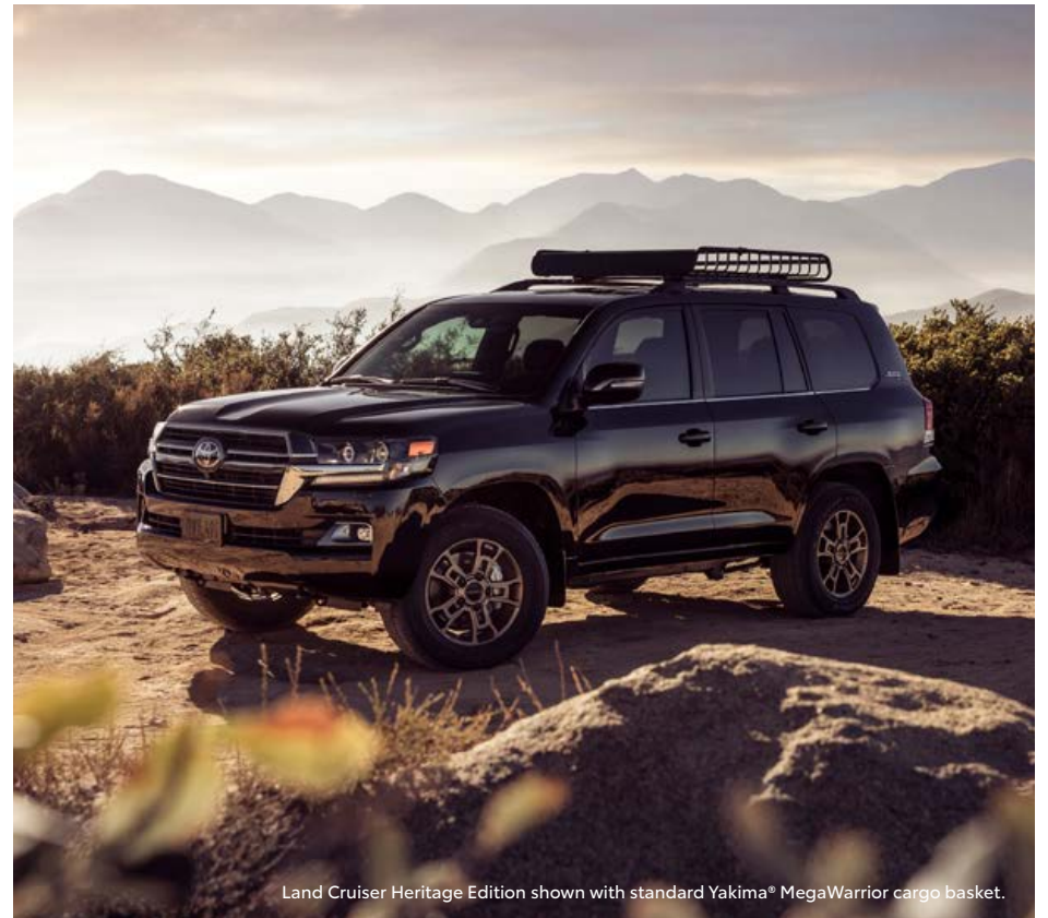
Land Cruiser Heritage Edition shown with standard Yakima® MegaWarrior cargo basket.