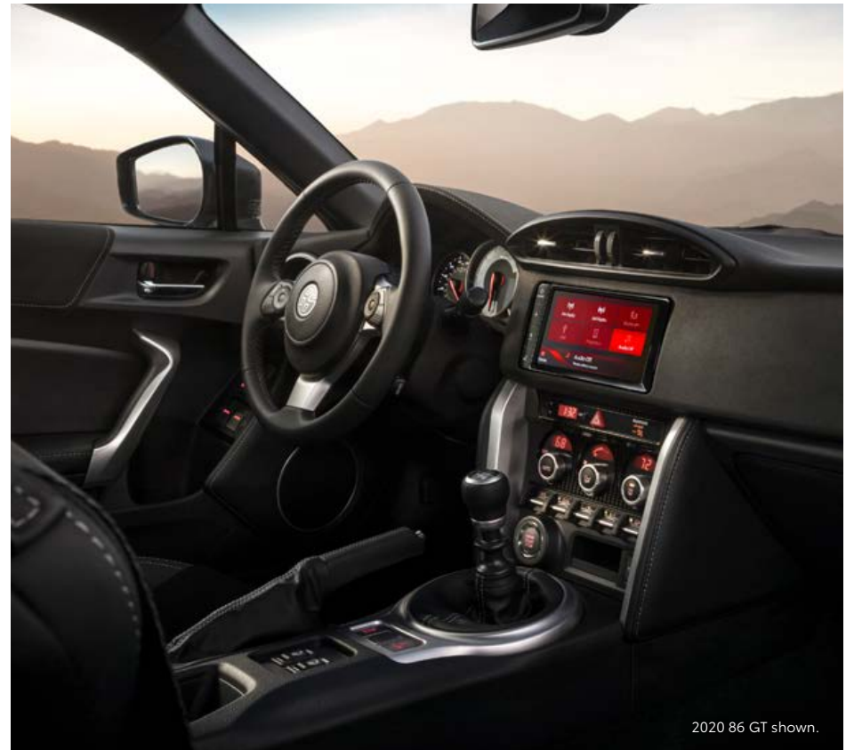
2020 86 GT shown.