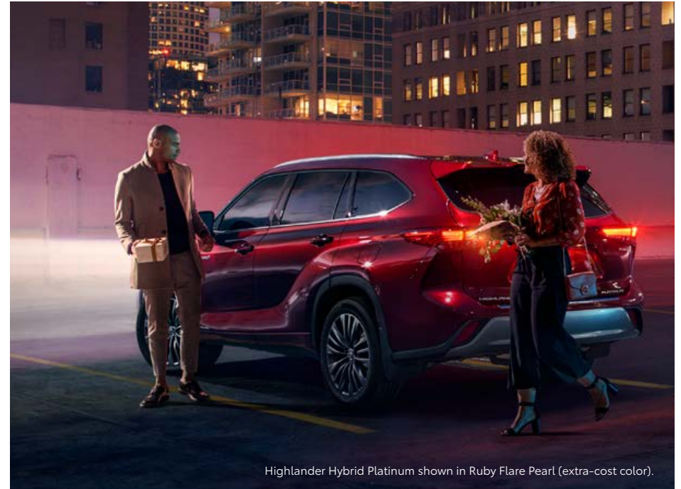
Highlander Hybrid Platinum shown in Ruby Flare Pearl (extra-cost color).

The hybrid for families, Highlander Hybrid has the efficiency you want with the space you need.