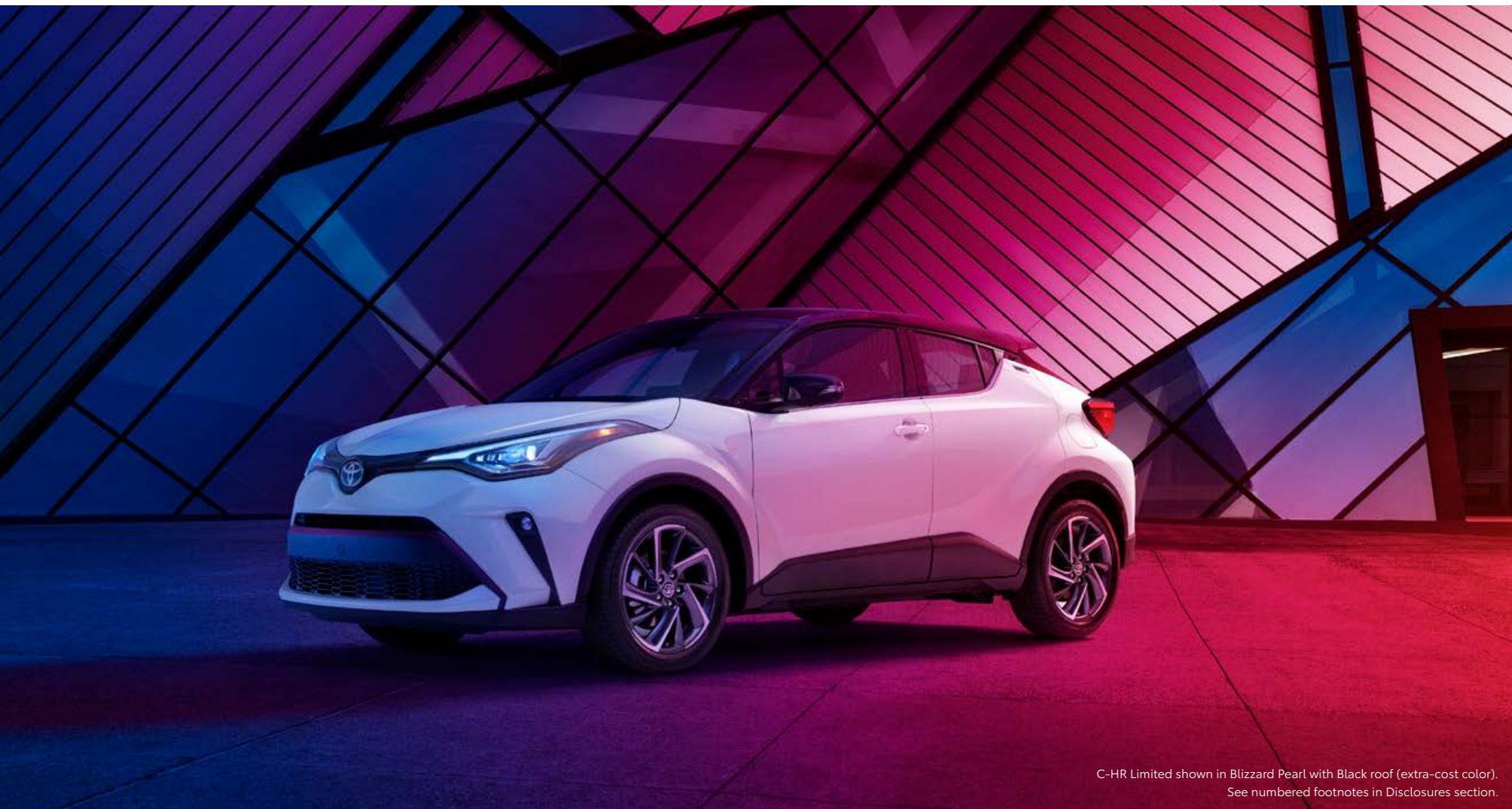
C-HR Limited shown in Blizzard Pearl with Black roof (extra-cost color). See numbered footnotes in Disclosures section.