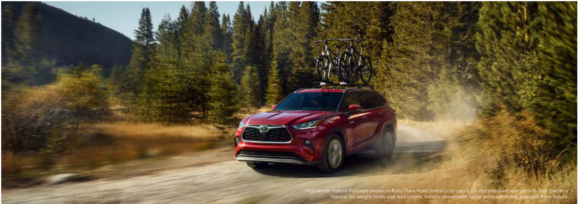
Highlander Hybrid Platinum shown in Ruby Flare Pearl (extra-cost color). Do not overload your vehicle. See Owner's Manual for weight limits and restrictions. Vehicle shown with some accessories not available from Toyota.