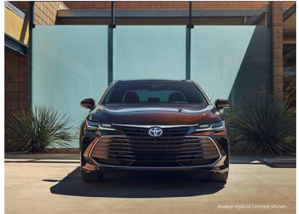
Avalon Hybrid Limited shown.