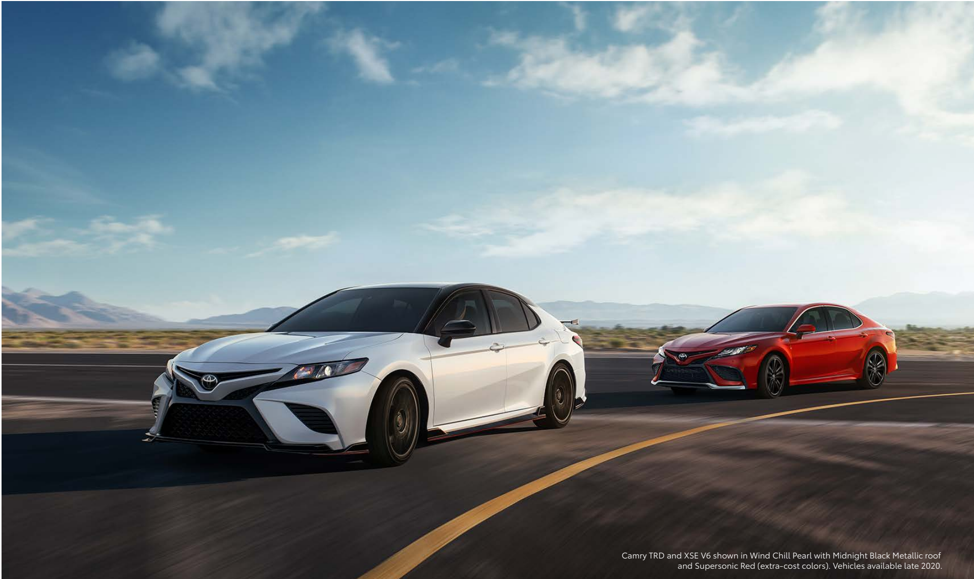
Camry TRD and XSE V6 shown in Wind Chill Pearl with Midnight Black Metallic roof and Supersonic Red (extra-cost colors). Vehicles available late 2020.