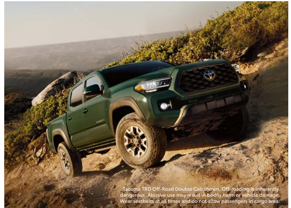
Tacoma TRD Off-Road Double Cab shown. Off-roading is inherently dangerous. Abusive use may result in bodily harm or vehicle damage. Wear seatbelts at all times and do not allow passengers in cargo area.