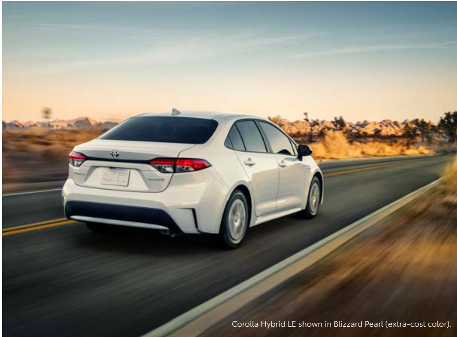
Corolla Hybrid LE shown in Blizzard Pearl (extra-cost color).