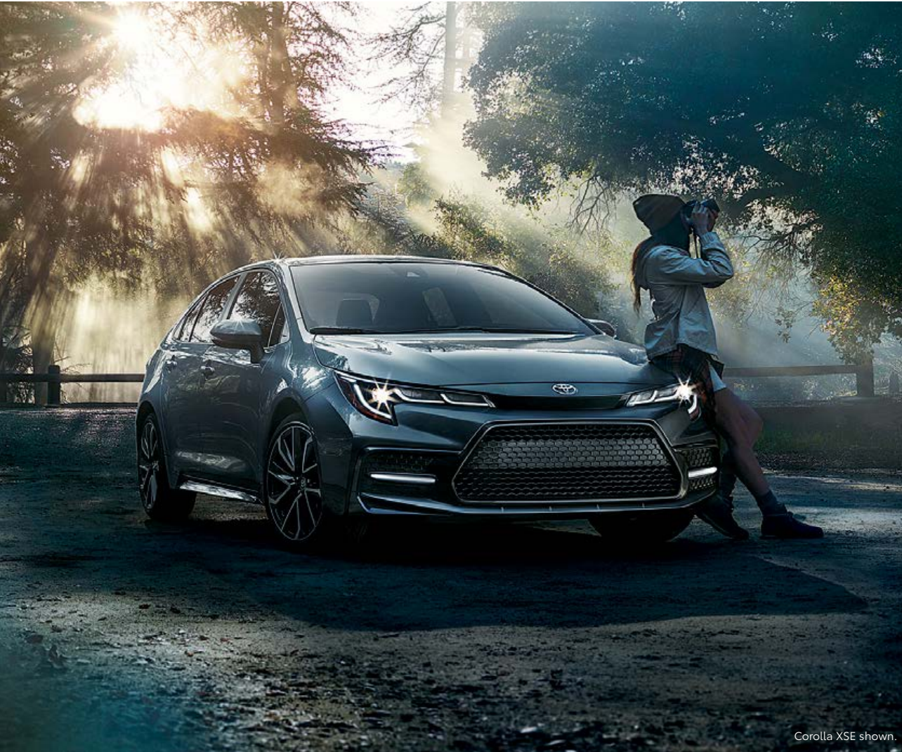
Corolla XSE shown.