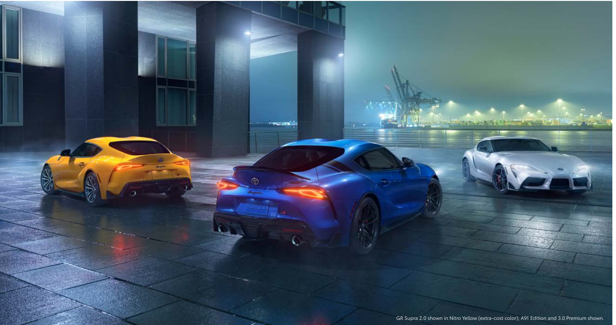
GR Supra 2.0 shown in Nitro Yellow (extra-cost color); A91 Edition and 3.0 Premium shown.