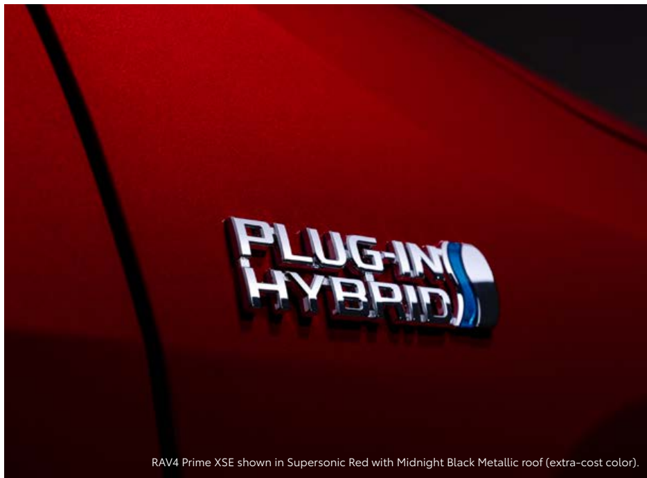
RAV4 Prime XSE shown in Supersonic Red with Midnight Black Metallic roof (extra-cost color).

RAV4 Prime takes charge as the quickest, most powerful RAV4 yet with an impressive 302 combined net horsepower.