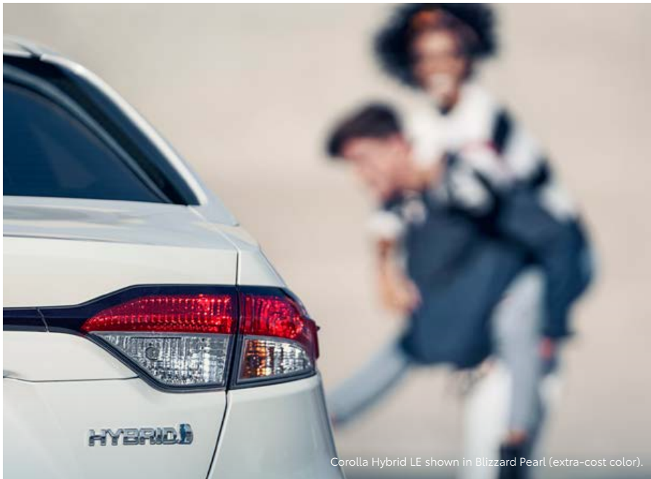
Corolla Hybrid LE shown in Blizzard Pearl (extra-cost color).