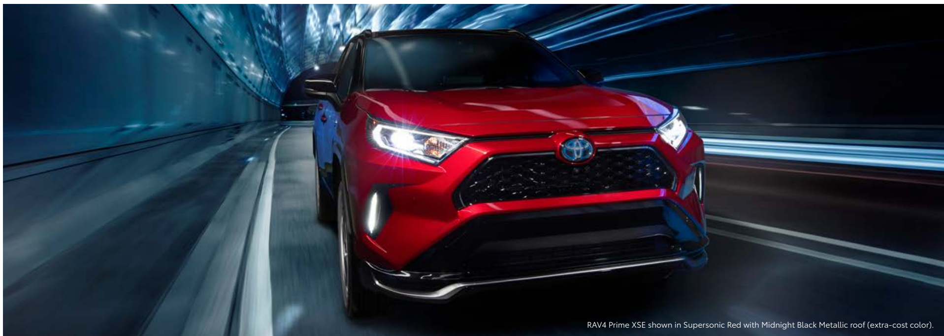
RAV4 Prime XSE shown in Supersonic Red with Midnight Black Metallic roof (extra-cost color).