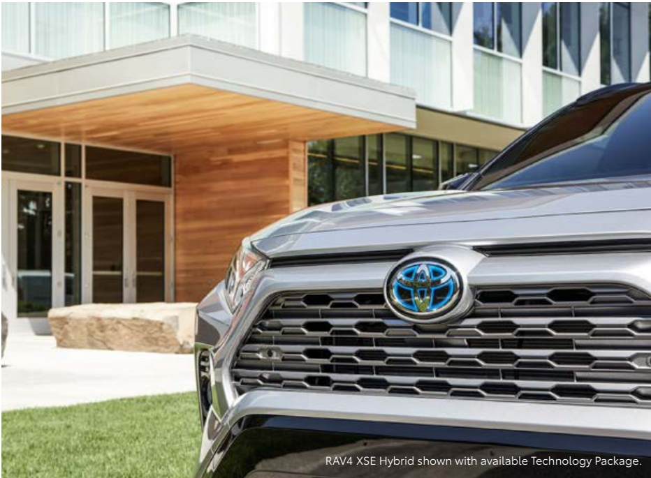
RAV4 XSE Hybrid shown with available Technology Package.