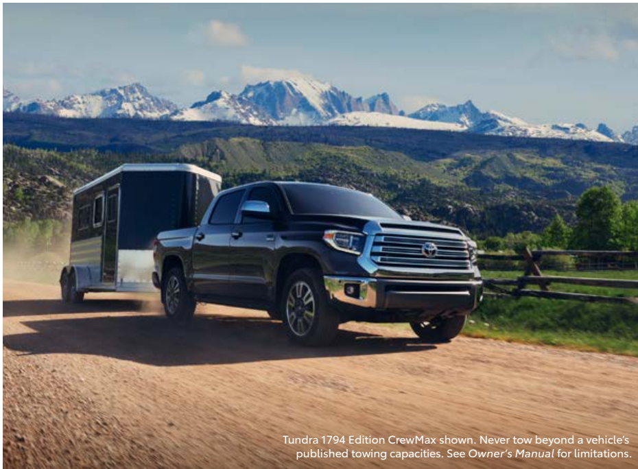
Tundra 1794 Edition CrewMax shown. Never tow beyond a vehicle's published towing capacities. See Owner's Manual for limitations.