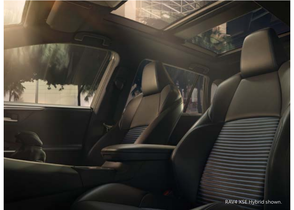
RAV4 XSE Hybrid shown.