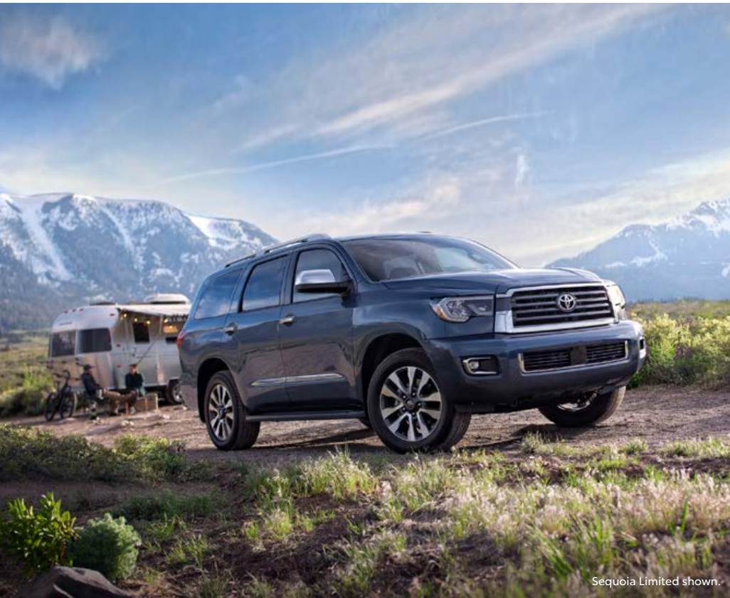
Sequoia Limited shown.