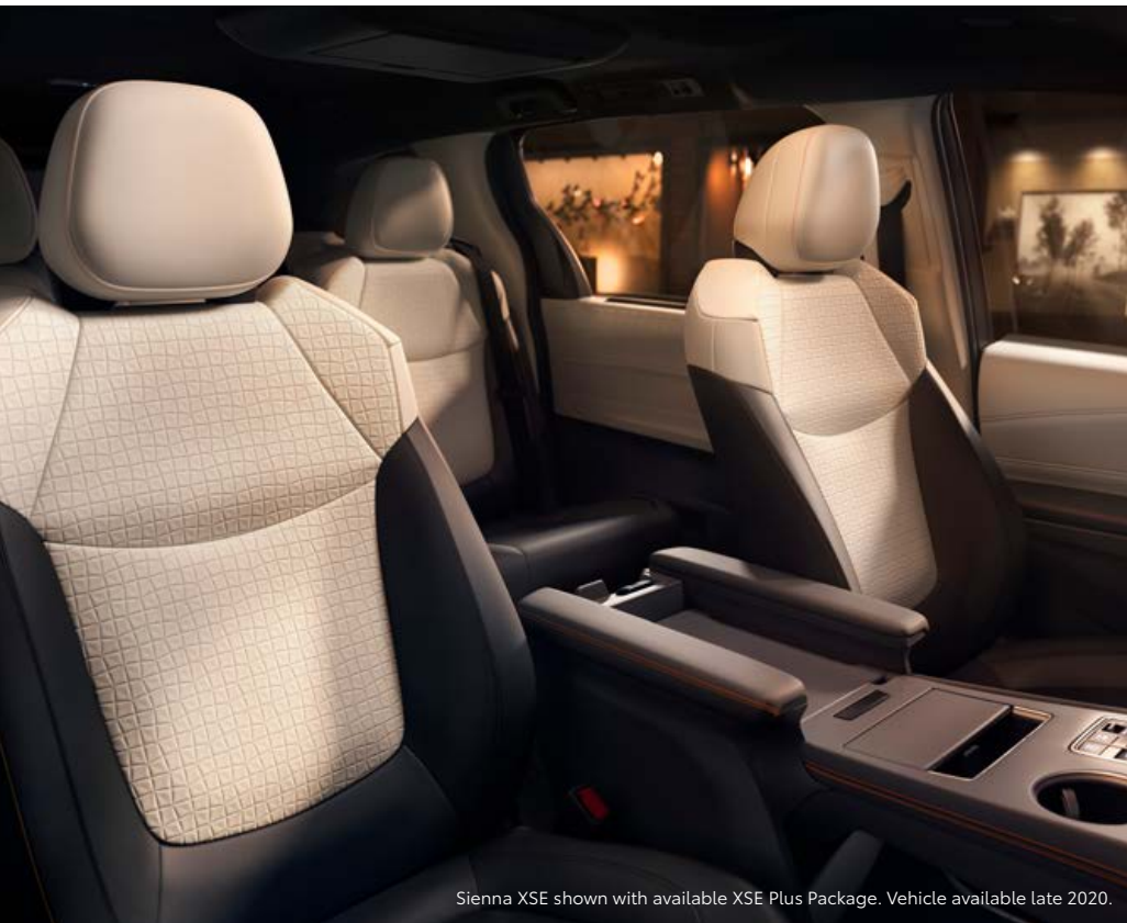
Sienna XSE shown with available XSE Plus Package. Vehicle available late 2020.