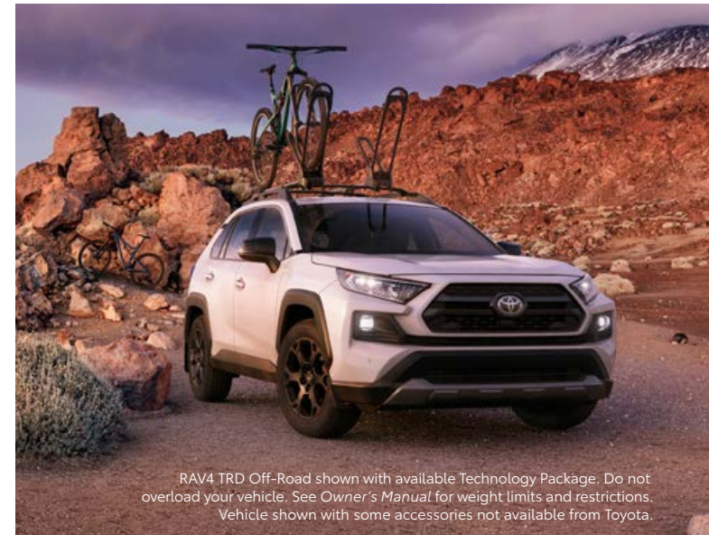
RAV4 TRD Off-Road shown with available Technology Package. Do not overload your vehicle. See Owner's Manual for weight limits and restrictions. Vehicle shown with some accessories not available from Toyota.