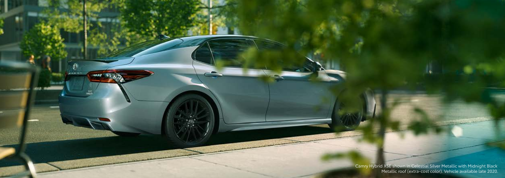
Camry Hybrid XSE shown in Celestial Silver Metallic with Midnight Black Metallic roof (extra-cost color). Vehicle available late 2020.