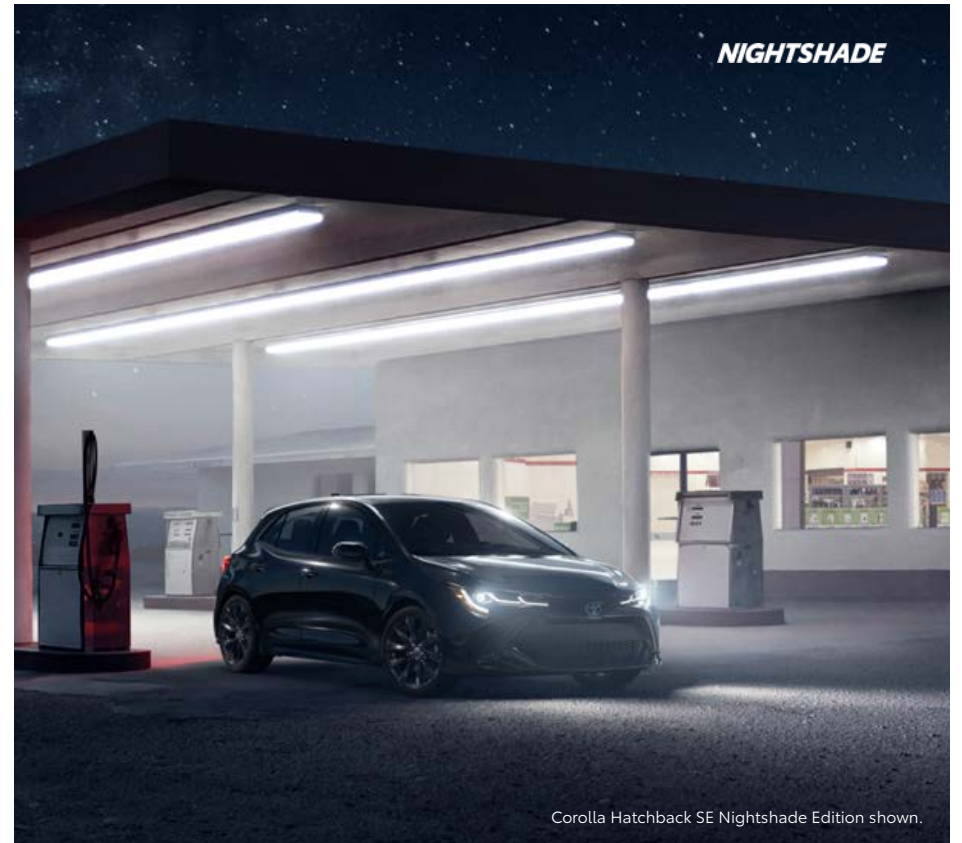
Corolla Hatchback SE Nightshade Edition shown.