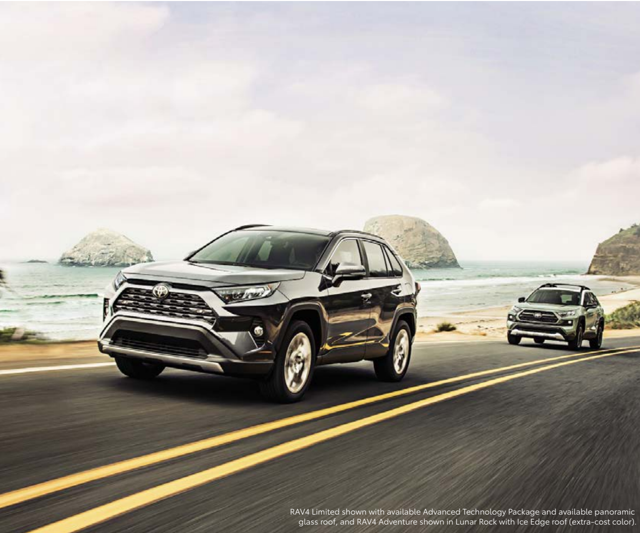
RAV4 Limited shown with available Advanced Technology Package and available panoramic glass roof, and RAV4 Adventure shown in Lunar Rock with Ice Edge roof (extra-cost color).