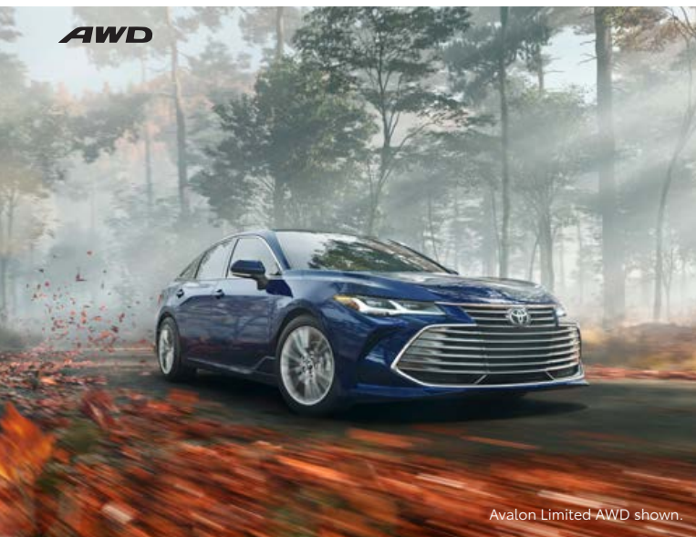
Avalon Limited AWD shown.