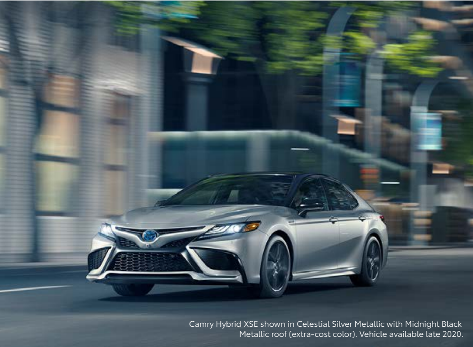
Camry Hybrid XSE shown in Celestial Silver Metallic with Midnight Black Metallic roof (extra-cost color). Vehicle available late 2020.

Camry Hybrid is always dressed to impress with its captivating style, and excels when it comes to responsive performance. Its Dynamic Force Engine offers power while optimizing fuel efficiency.