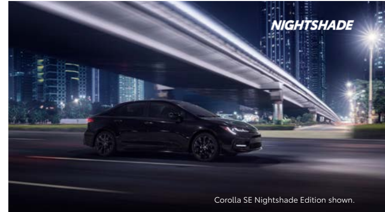
Corolla SE Nightshade Edition shown.