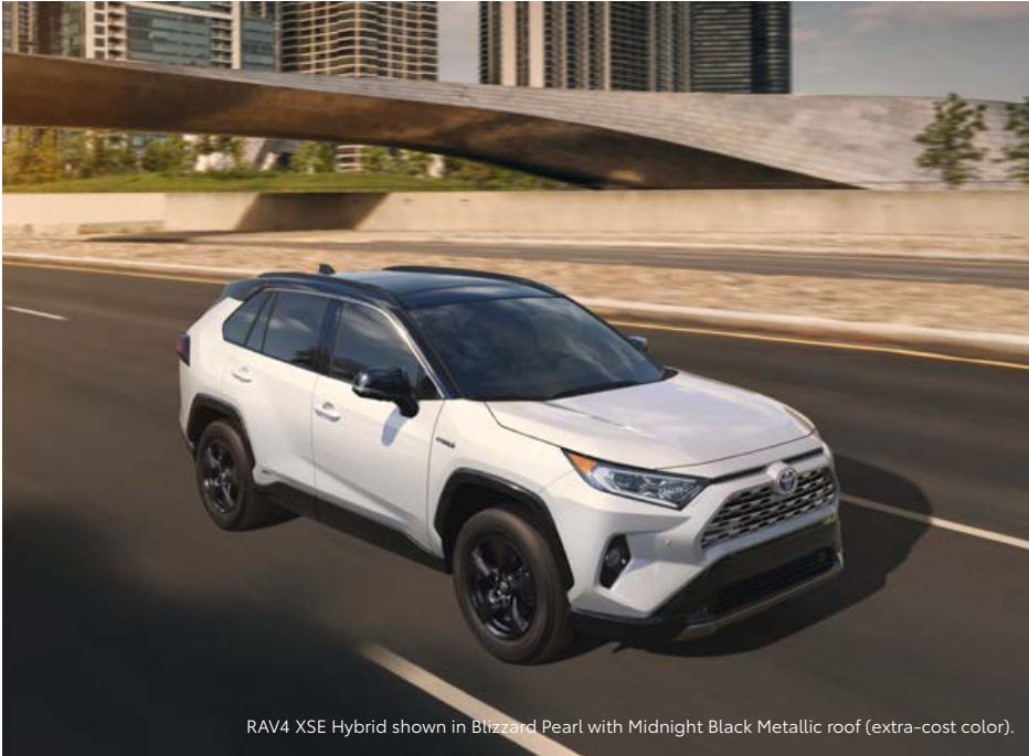
RAV4 XSE Hybrid shown in Blizzard Pearl with Midnight Black Metallic roof (extra-cost color).