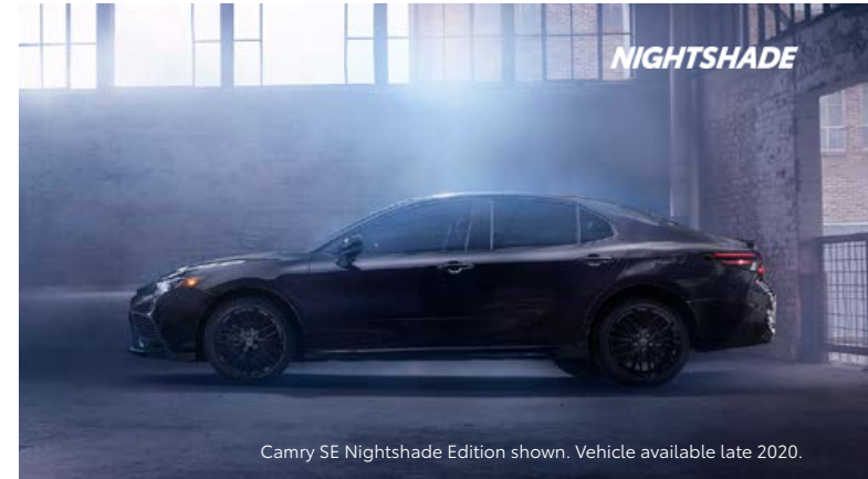
Camry SE Nightshade Edition shown. Vehicle available late 2020.