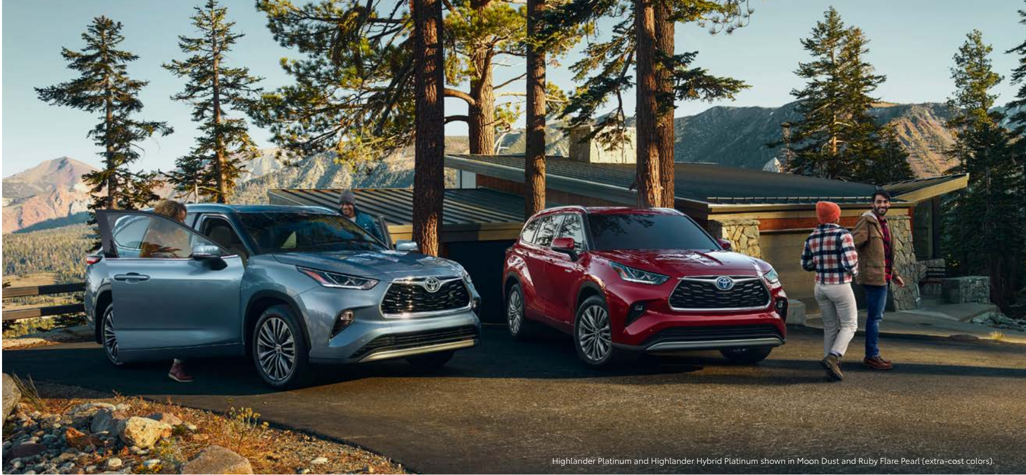
Highlander Platinum and Highlander Hybrid Platinum shown in Moon Dust and Ruby Flare Pearl (extra-cost colors).