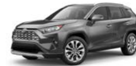
CROSSOVERS & SUVs