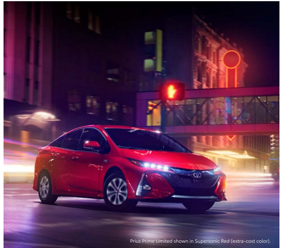
Prius Prime Limited shown in Supersonic Red (extra-cost color).