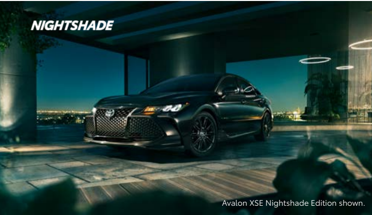
Avalon XSE Nightshade Edition shown.