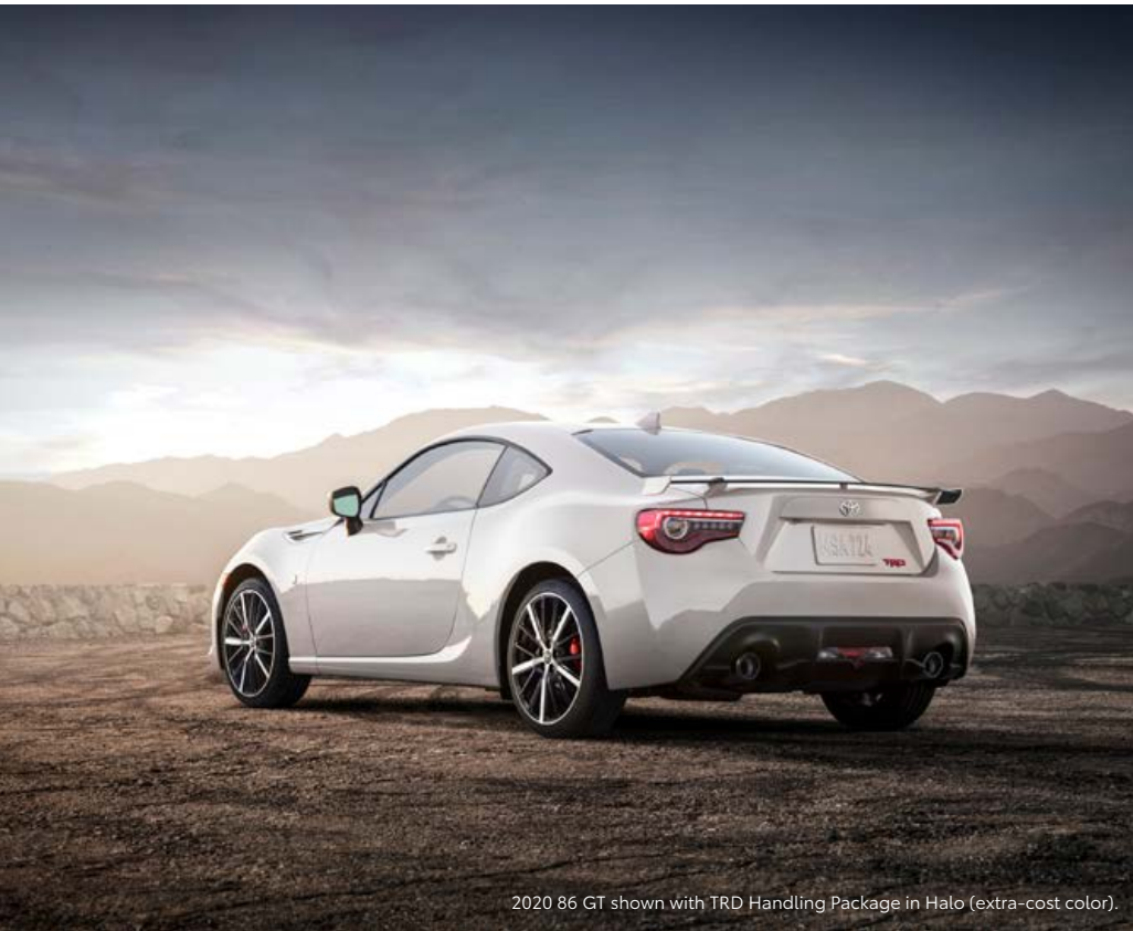
2020 86 GT shown with TRD Handling Package in Halo (extra-cost color).