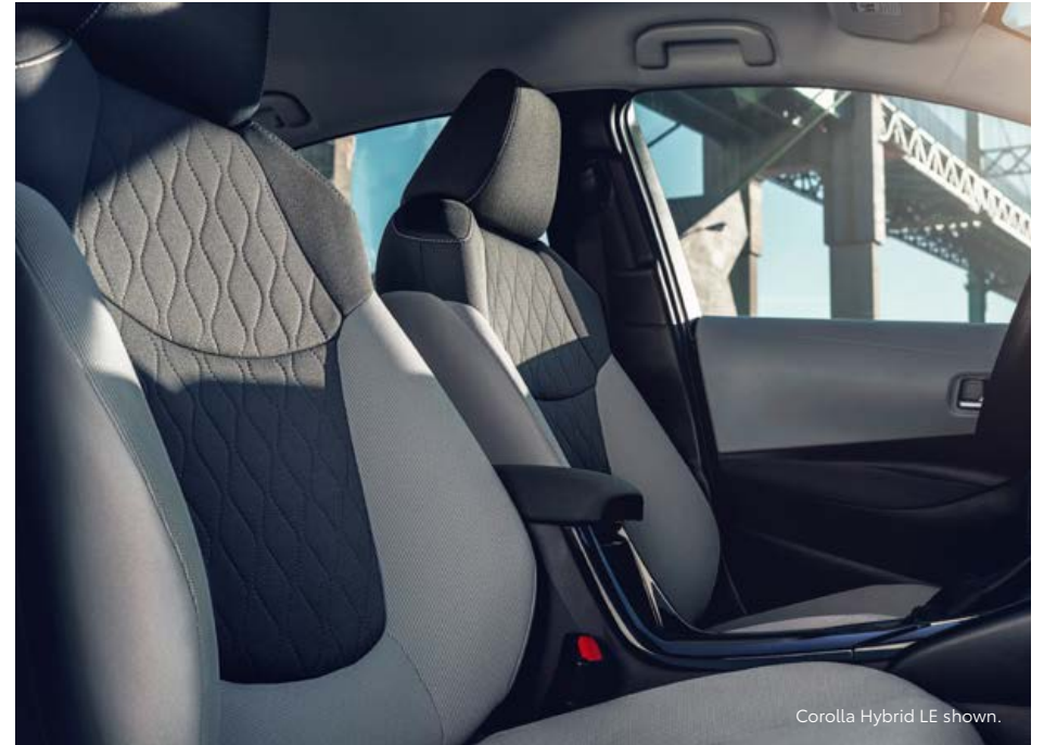
Corolla Hybrid LE shown.