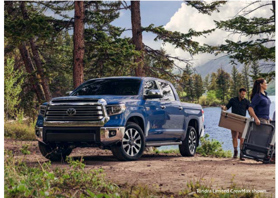
Tundra Limited CrewMax shown.

Tacoma and Tundra are built to climb hills and run long. Play harder than ever before with a truck capable of conquering the earth.