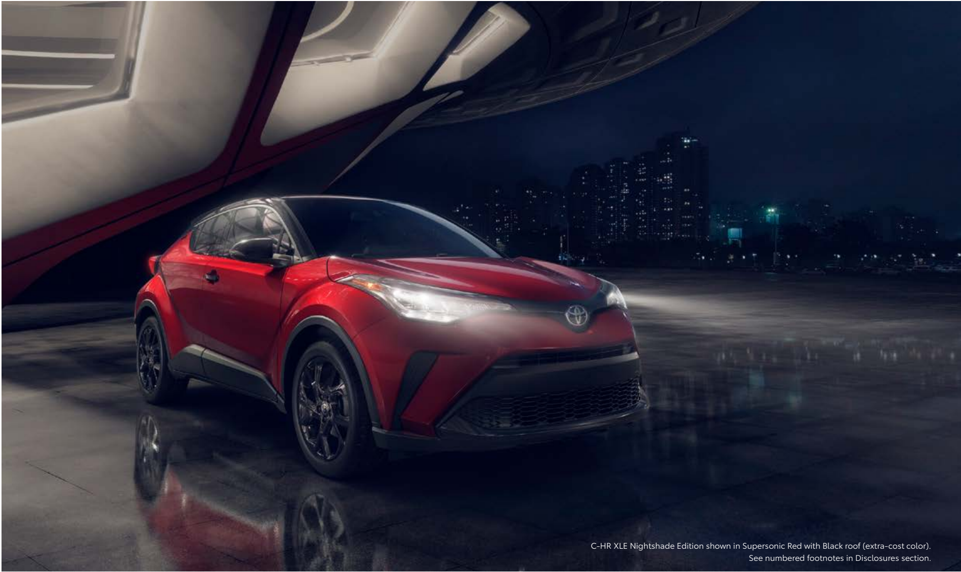
C-HR XLE Nightshade Edition shown in Supersonic Red with Black roof (extra-cost color). See numbered footnotes in Disclosures section.