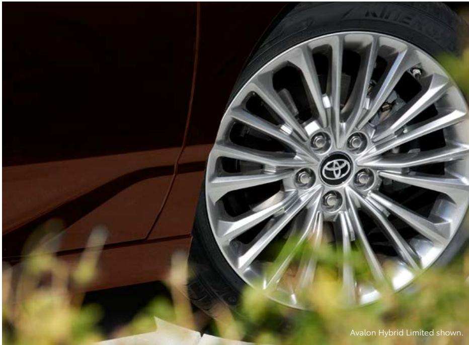
Avalon Hybrid Limited shown.