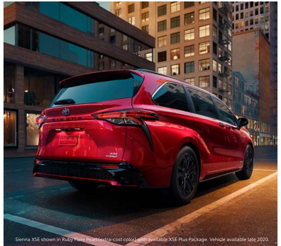
Sienna XSE shown in Ruby Flare Pearl (extra-cost color) with available XSE Plus Package. Vehicle available late 2020.