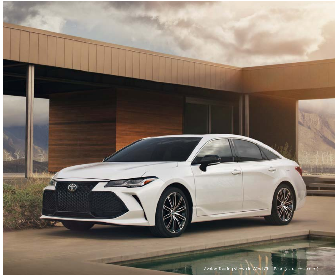
Avalon Touring shown in Wind Chill Pearl (extra-cost color).