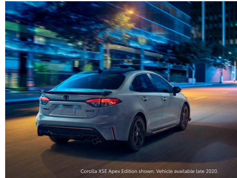
Corolla XSE Apex Edition shown. Vehicle available late 2020.