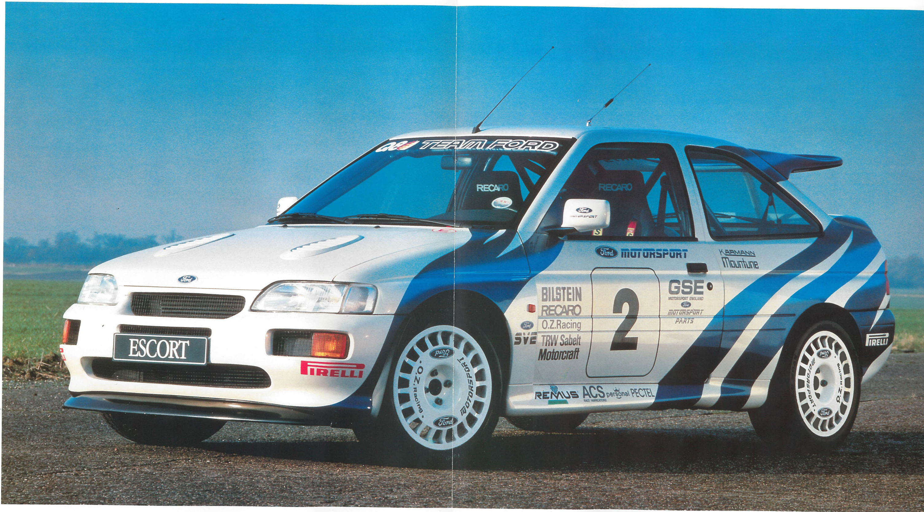
The car illustrated is a Road Sport version modified by the addition of engine and suspension upgrading components to Group N Competition Standards. It is planned to make these components available through Motorsport Parts Operations.

DOUBLE G MOTORSPORT www.doublegmotorsport.com