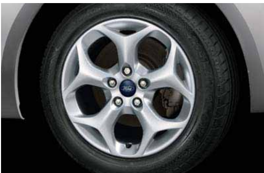
16" 5-spoke 'Y-design' alloy wheel [D2XD1] (Only available with Style Sport Pack)