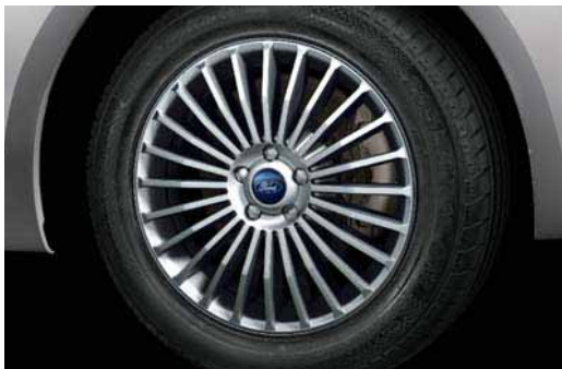
16" multi-spoke alloy wheel [D2XVF] (Standard on Titanium)