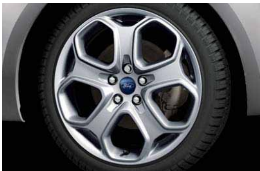
18" 5-spoke alloy wheel [D2UL1] (Only available with Titanium Sport Pack)