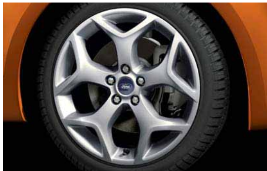
18" 5-spoke alloy wheel [D2UBJ] (Standard on ST)