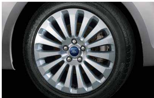
17" multi-spoke alloy wheel [D2YB7] (Accessory)