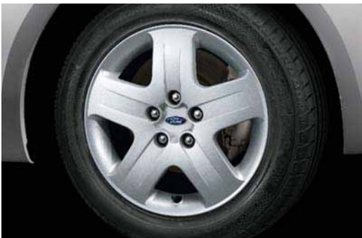
16" 5-spoke 'Design' wheel [D5ABN] (Standard on Style)