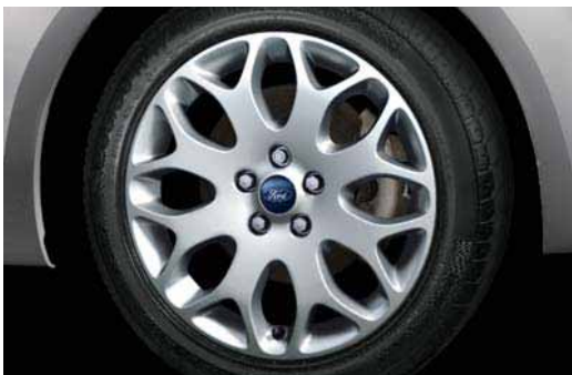
17" 8-spoke alloy wheel [D2YBU] (Only available with Zetec Sport Pack)