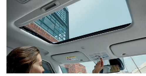
Power tilt-and-slide sunroof