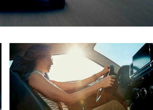
Tilt-and-telescopic steering wheel