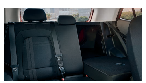
60/40 split-folding rear seats