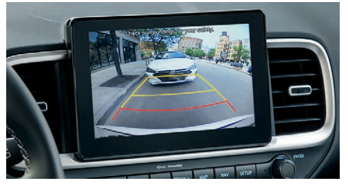
Rear View Monitor with dynamic guidelines