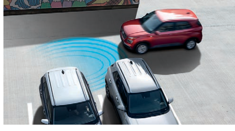
Rear Cross-Traffic Collision Warning