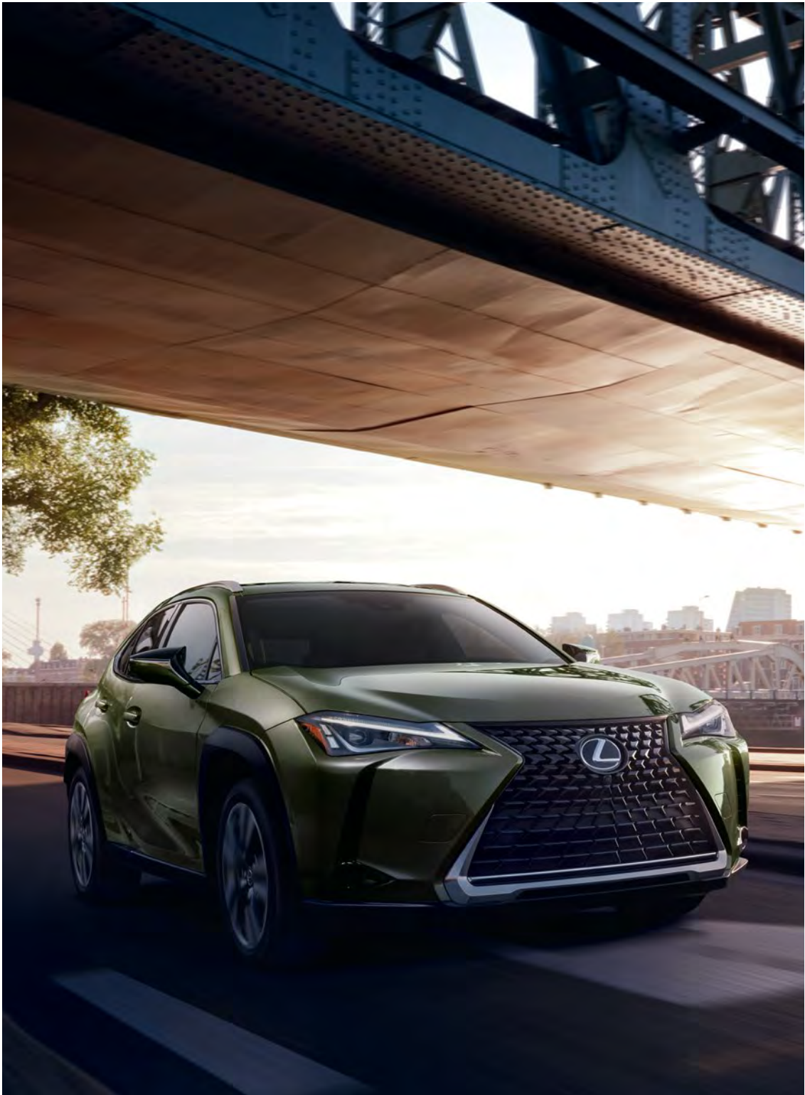
UX shown in Nori Green Pearl