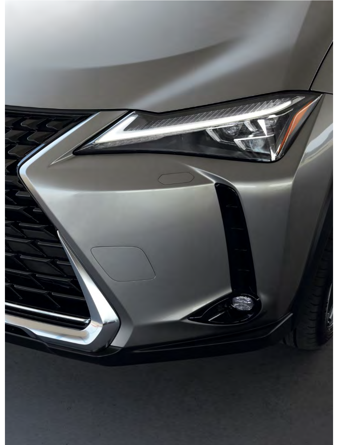
UX shown in Atomic Silver

Delivering a refreshing take on crossover styling, the UX offers striking triple-beam LED headlamps and integrated daytime running lights, and features aerodynamic taillamps that blend 120 LEDs into one continuous line that tapers to a mere three millimeters in the center. And merging traditional Japanese aesthetics with contemporary luxury, available washi trim is uniquely crafted to mimic the soft grain of Japanese paper, adding distinctive texture and style to the dash. For added convenience, the UX 250h features a configurable cargo area 15 to accommodate taller items.