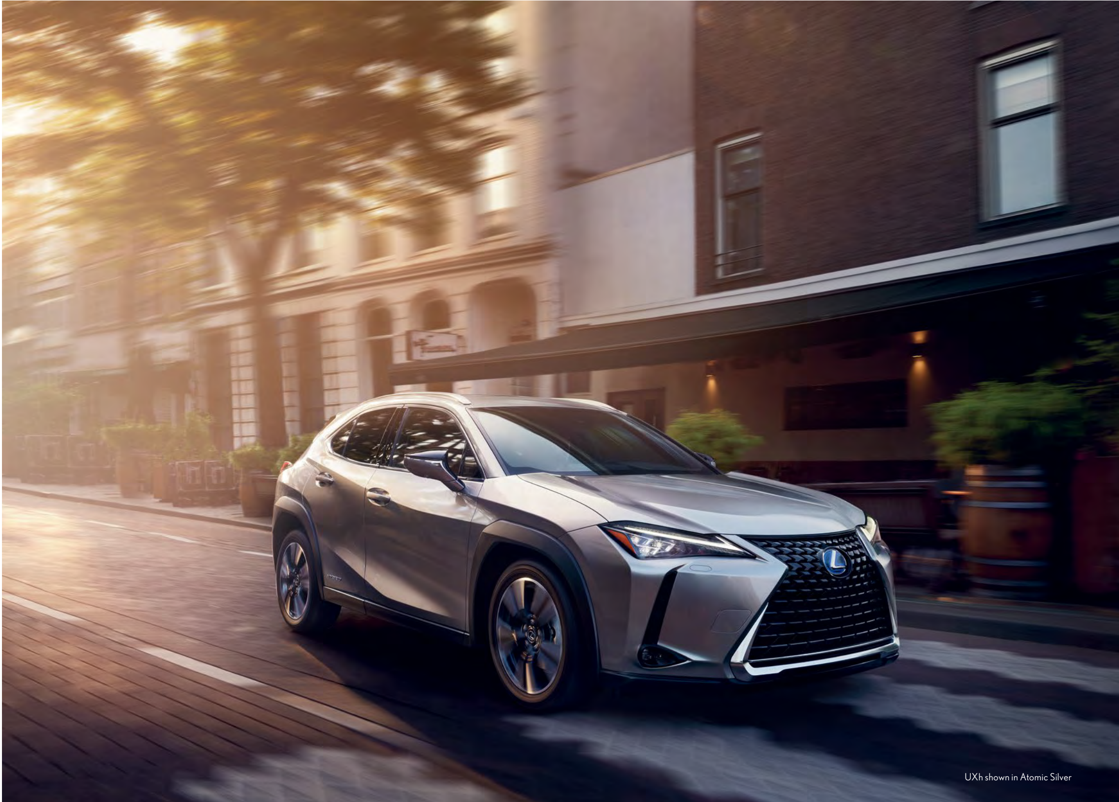
UXh shown in Atomic Silver

can send up to 80% of the power to the rear wheels