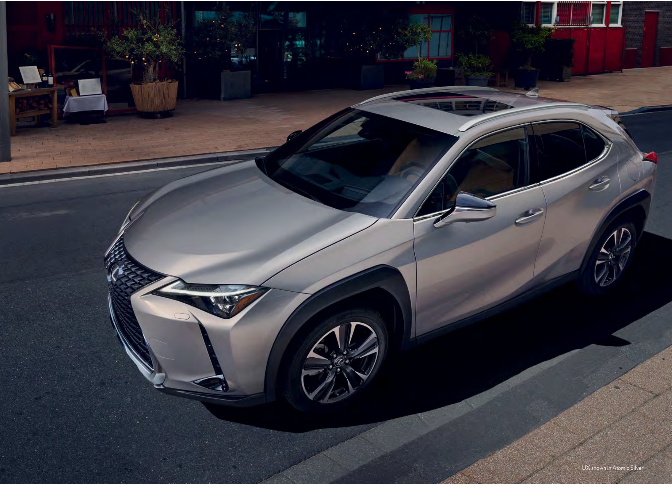
UX shown in Atomic Silver

Accessory alloy wheels 55 with Gloss Black and machined finish AVAILABLE