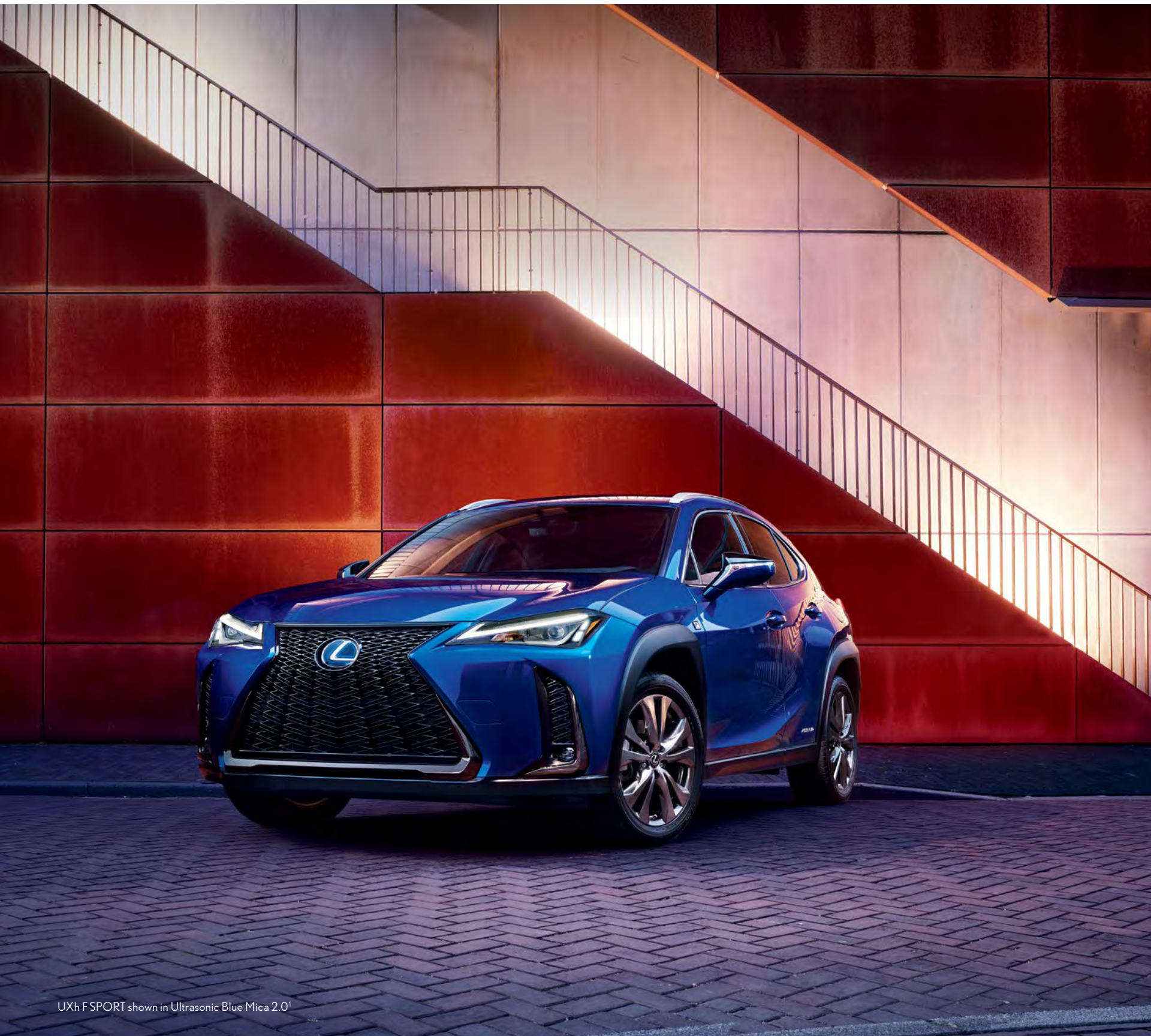
UXh F SPORT shown in Ultrasonic Blue Mica 2.0 1