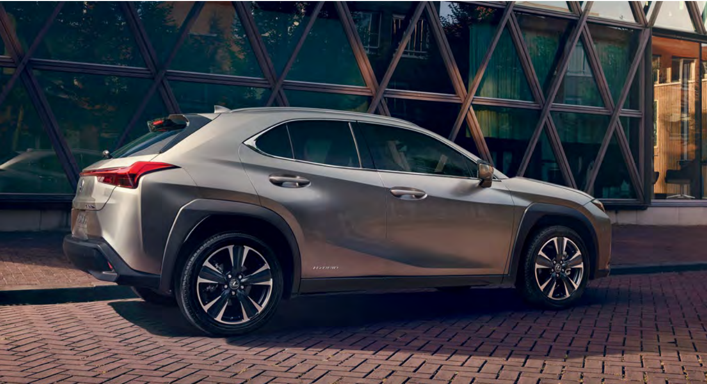
UXh shown in Atomic Silver with Glazed Caramel NuLuxe interior trim

Featuring generous rear legroom and 60/40-split folding rear seats, the UX also offers numerous compartments in the cargo area, as well as a 110V power outlet, 19 wireless charger 20 and two new, faster-charging USB 6 ports. This is versatility fit for the modern explorer.