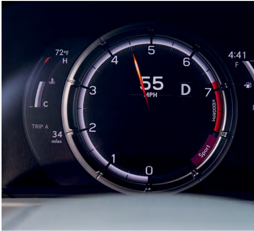
UXh F SPORT shown in Ultra White 1

Both UX F SPORT models offer the next level of dynamic handling, rigidity and responsiveness. From lightning-fast paddle shifters to an exclusive sport-tuned suspension, they deliver performance as aggressive as their design. For an even more visceral driving experience, they also emit a throaty engine note at higher rpm. Meanwhile, performance-inspired digital gauges move in concert with a sliding bezel, expanding and retracting digital readouts when information is accessed.