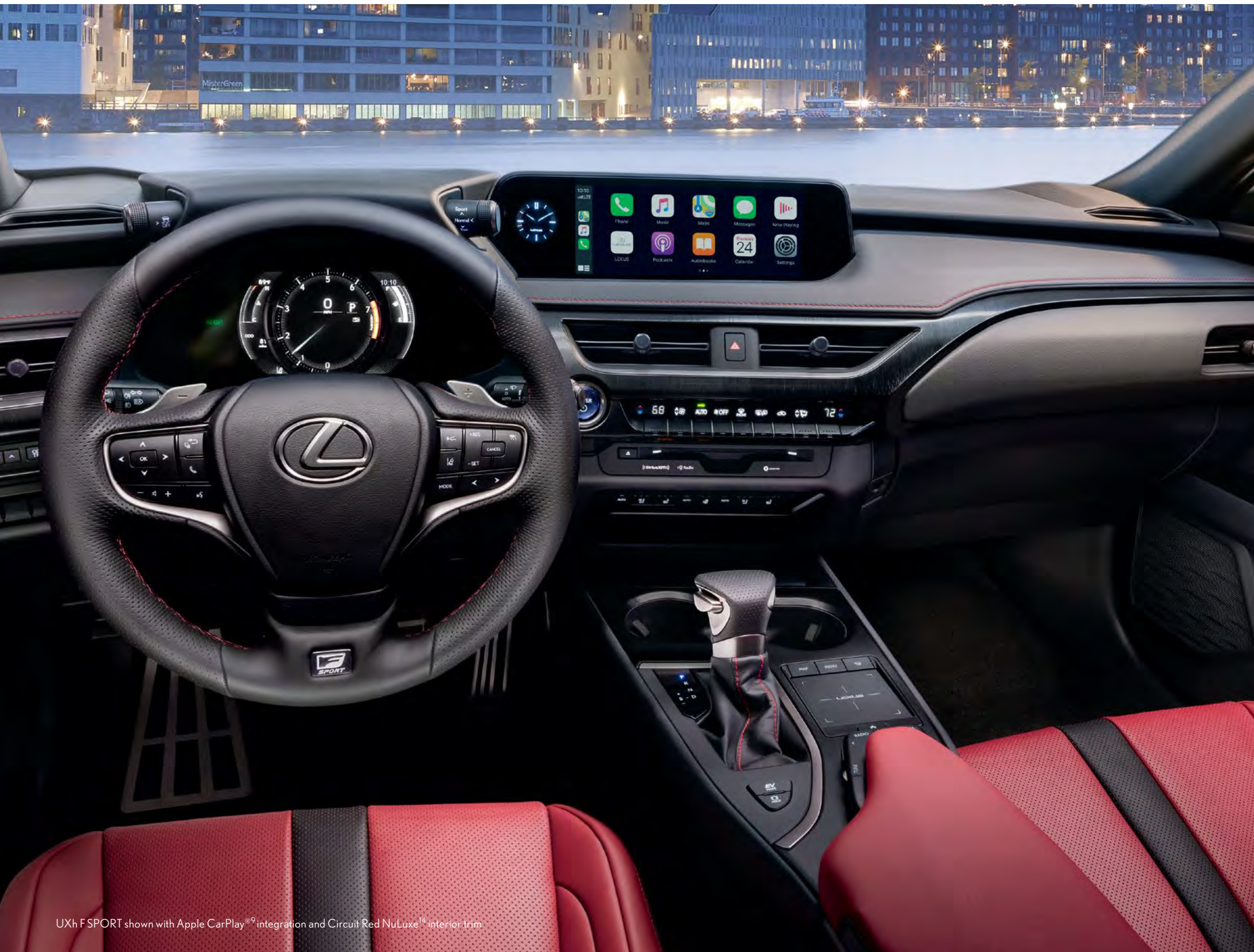
UXh F SPORT shown with Apple CarPlay ®9 integration and Circuit Red NuLuxe 14 interior trim