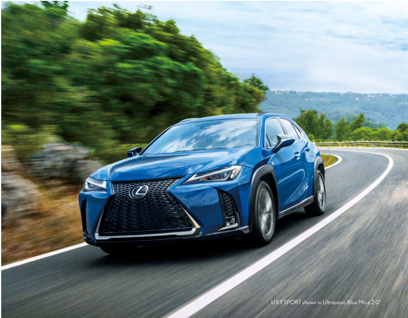
UX F SPORT shown in Ultrasonic Blue Mica 2.0 1

Merging the visual appeal of a low, wide stance with the performance benefits of an extremely lightweight and rigid platform, the UX is truly a feat of engineering. It uses structural adhesives and laser screw welds, which significantly reduce the need for weighty screws and fasteners while enhancing agility and ride quality. It also utilizes high-strength aluminum throughout the vehicle. The result is not only efficiency to do more, but also a lower center of gravity for nimble handling and easier navigation of every road.