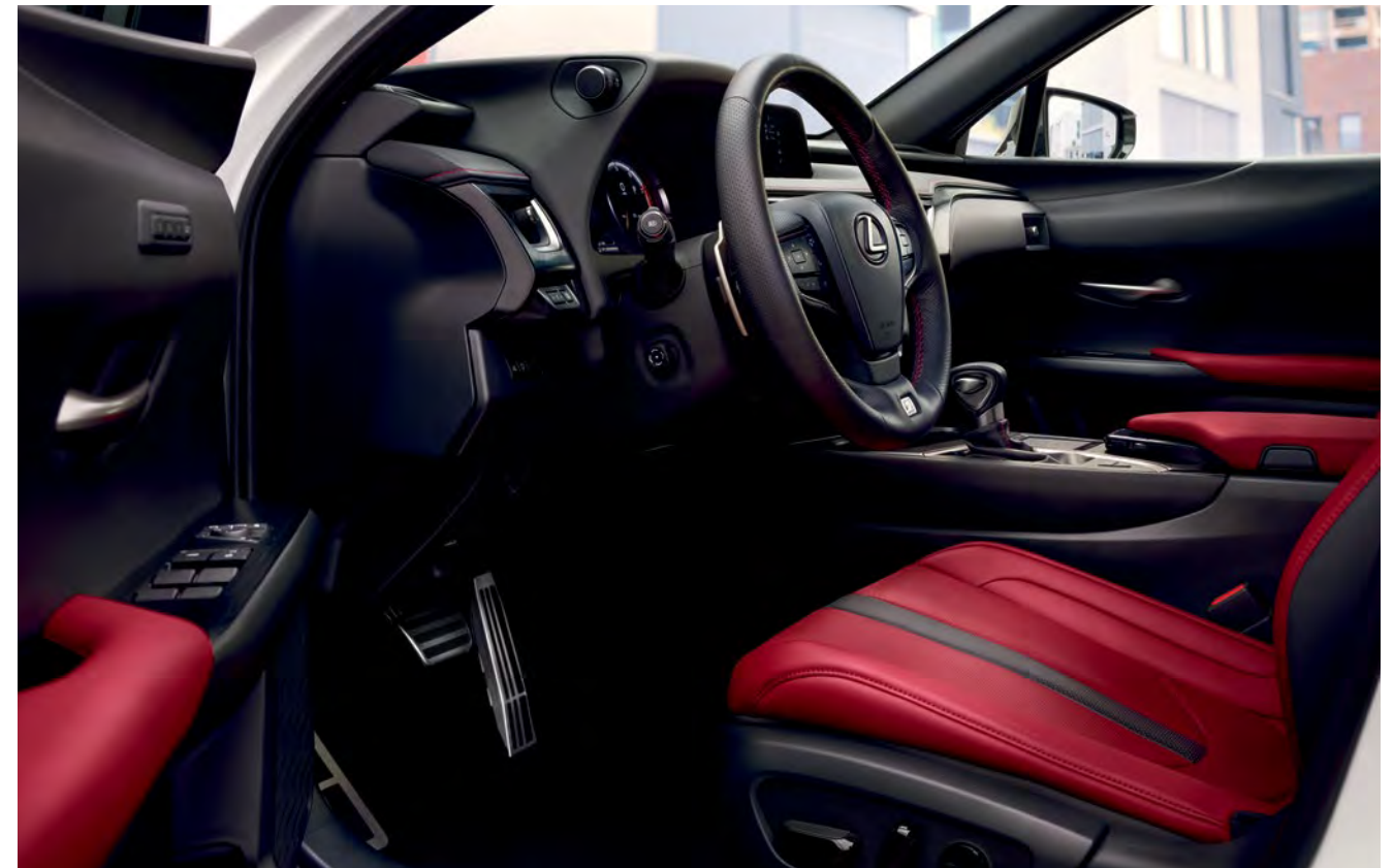
UX F SPORT shown with Circuit Red NuLuxe 14 interior trim