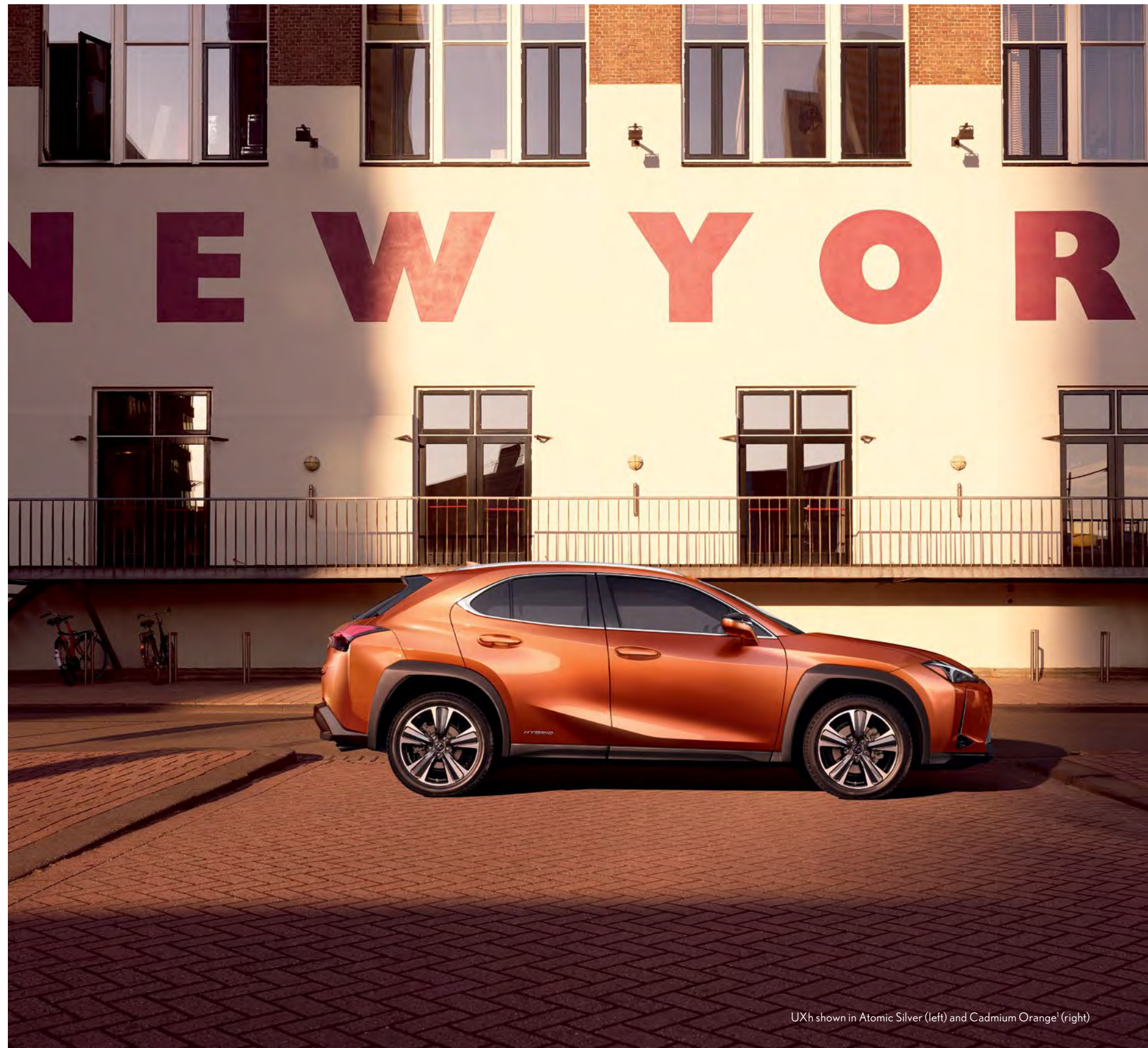
UXh shown in Atomic Silver (left) and Cadmium Orange 1 (right)