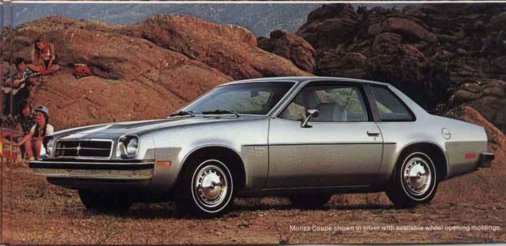
Monza Coupe shown in silver with available wheel opening moldings.