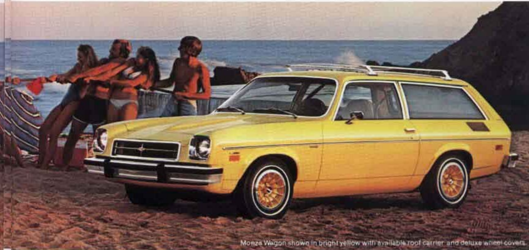
Monza Wagon shown in bright yellow with available roof carrier and deluxe wheel covers.