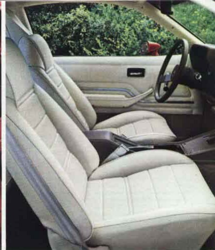
Monza 2+2 Sport Hatchback standard Custom vinyl interior shown in oyster with available deluxe seat and shoulder belts.