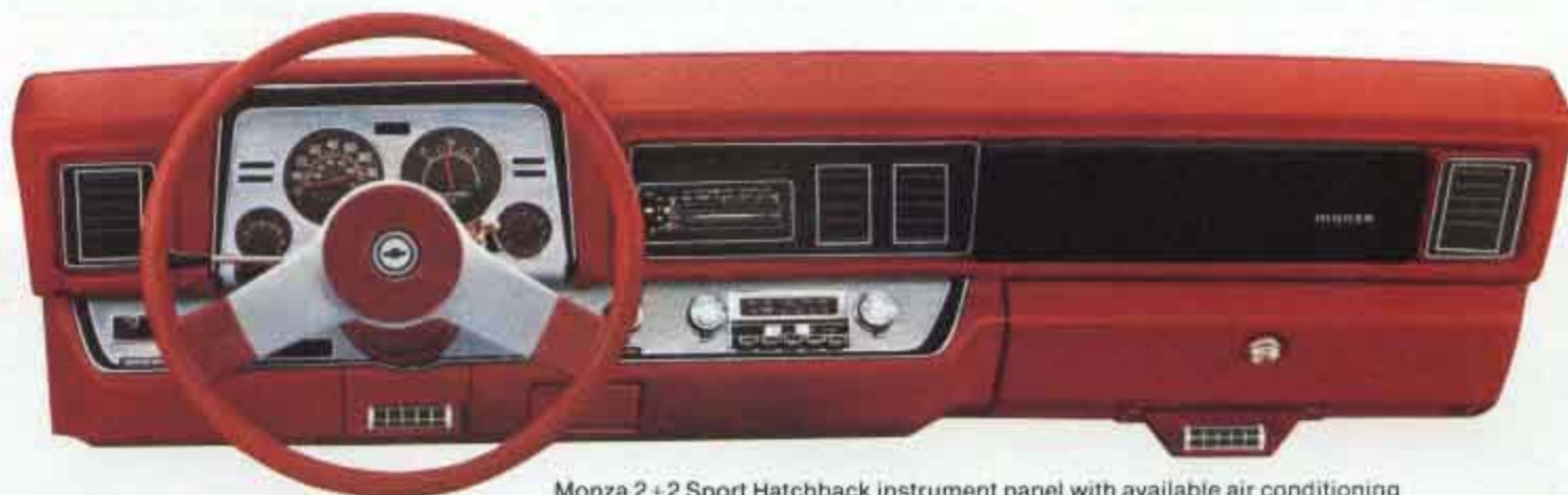
Monza 2+2 Sport Hatchback instrument panel with available air conditioning and AM/FM stereo radio.

If this isn't enough for your kind of Monza, there's a list of Available Options on pages 10 and 11 and on the back cover. Right now, use the chart below to pick out just the interior you want in your new Monza.