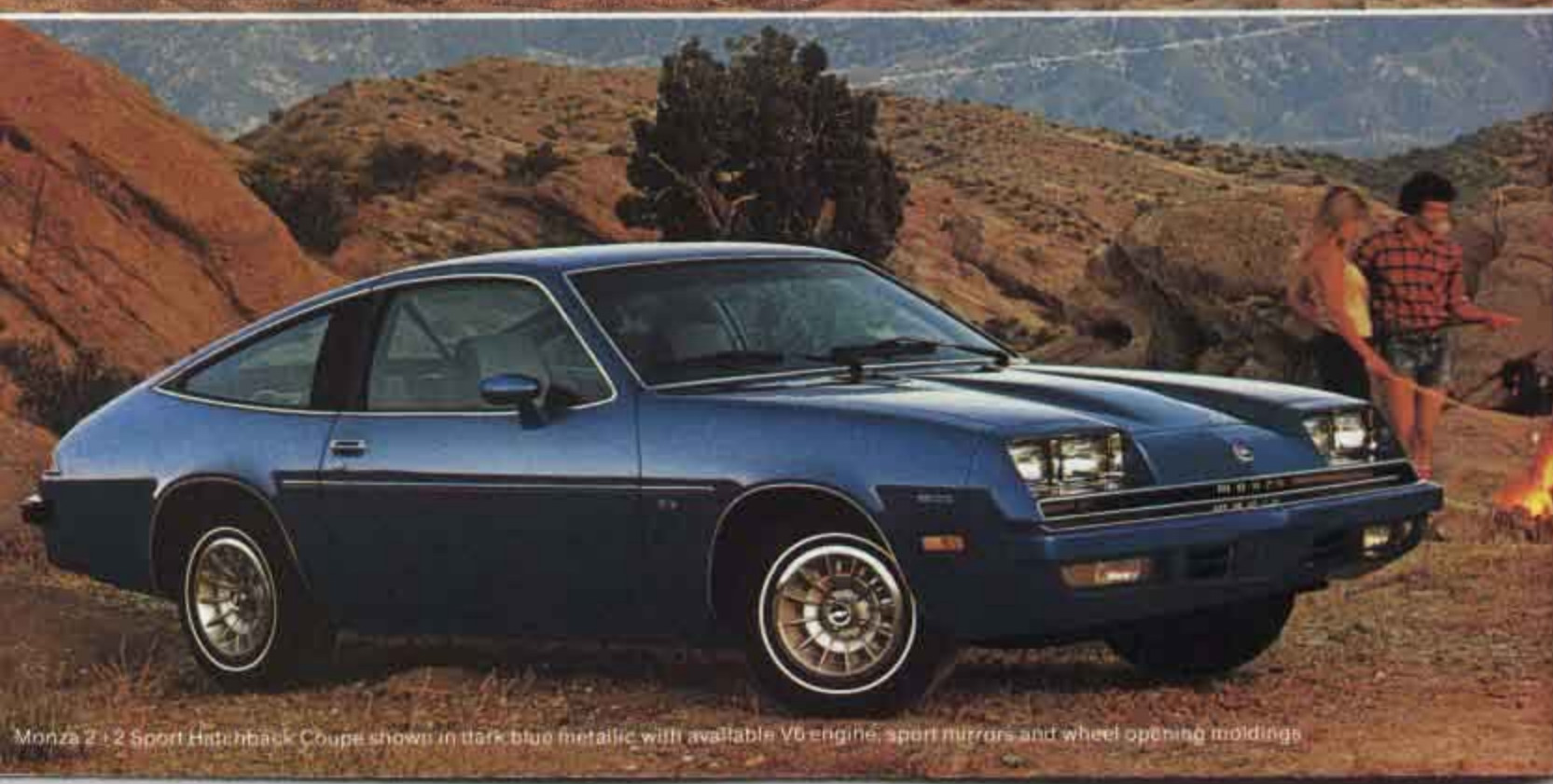
Monza 2+2 Sport Hatchback Coupe shown in dark blue metallic with available V6 engine, sport mirrors and wheel opening moldings.