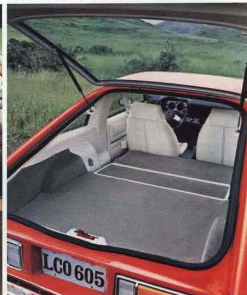
Monza 2+2 Hatchback Coupe load deck (rear seat folded). Over 27 cubic feet of cargo space.