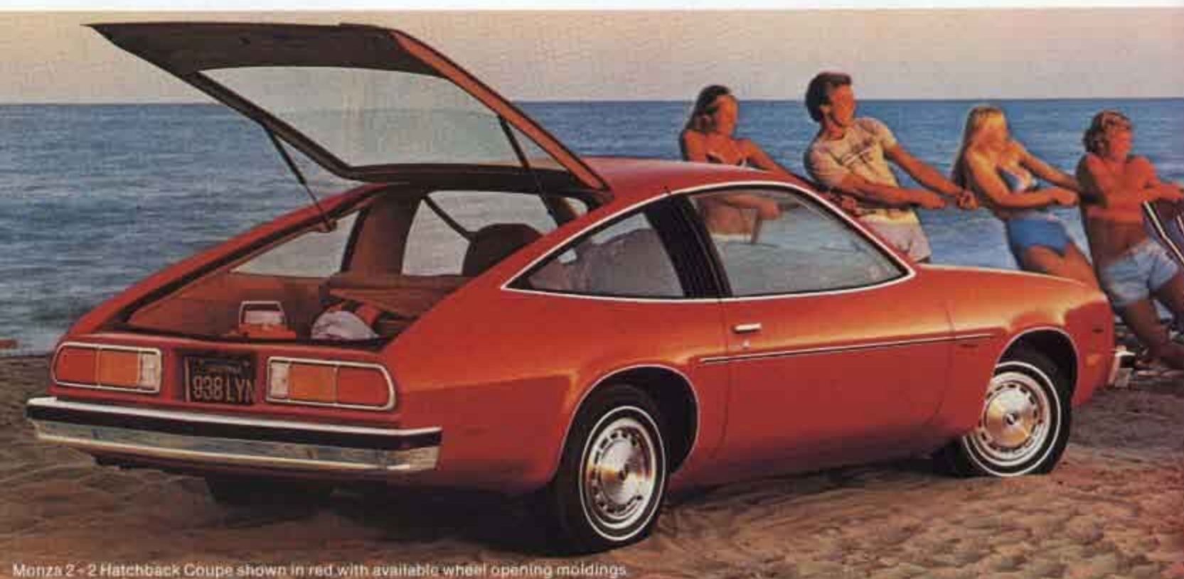
Monza 2+2 Hatchback Coupe shown in red with available wheel opening moldings.

folded, this smart Monza Wagon can take aboard up to 46.6 cubic feet of cargo. With a cargo deck that's a full 65.3 inches long and a tailgate that's less than 23 inches above the road, it's easy to load and unload. And for your people loads, the Monza Wagon even offers a bit more head room and rear seat leg room than our other Monzas. For more details, ask your dealer for a station wagon catalog.