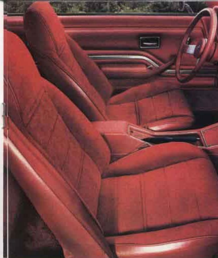
Monza Custom interior shown in carmine with available Custom cloth upholstery and deluxe seat and shoulder belts.

for complete information on vinyl roof availability.