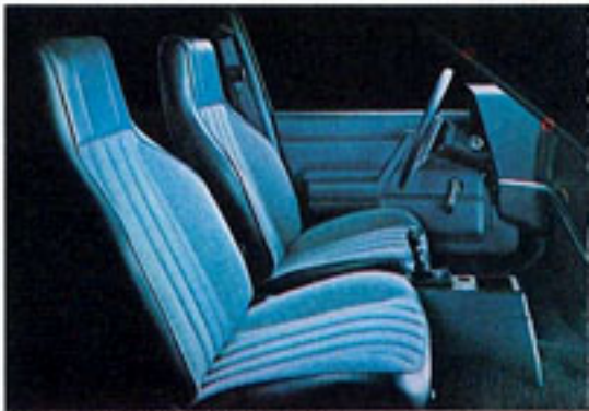
Cavalier cloth interior.