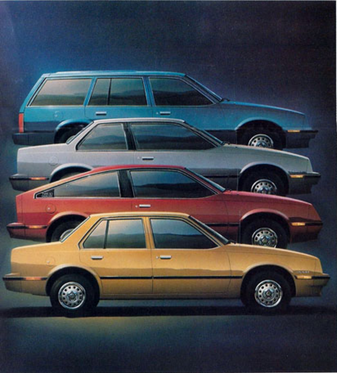
Cavalier's model line-up is complete. Top to bottom: Station Wagon, 2-Door Coupe, Hatchback Coupe and 4-Door Sedan.