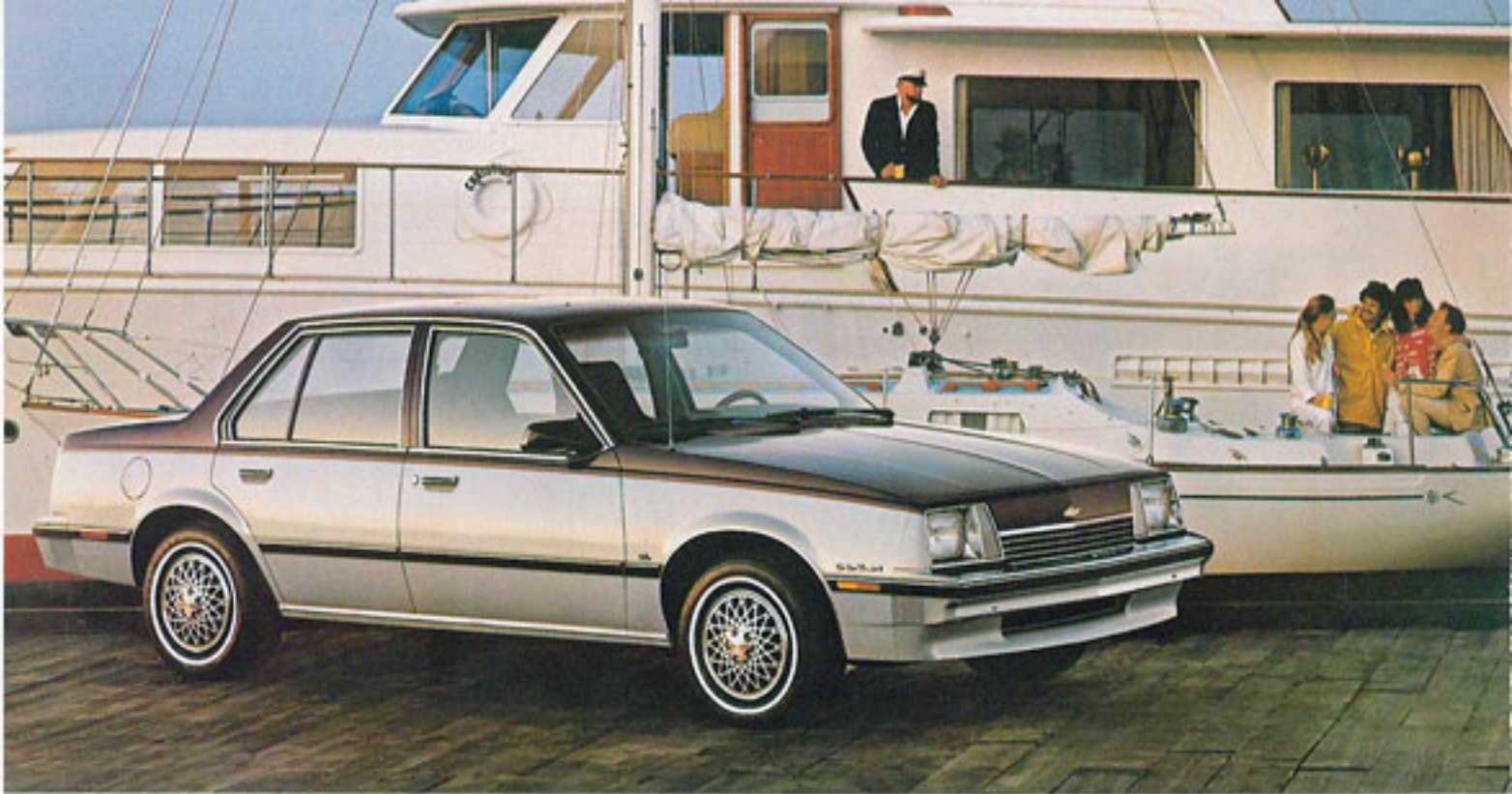
Cavalier CL 4-Door Sedan.

Chevy Cavalier. Designed to make your life more complete. For a long time to come.