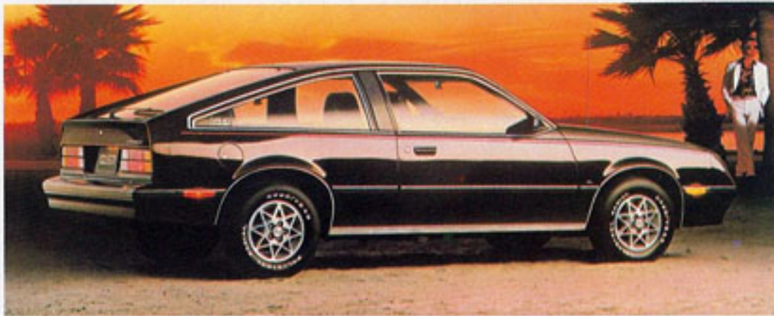
Cavalier CL 2-Door Hatchback Coupe.