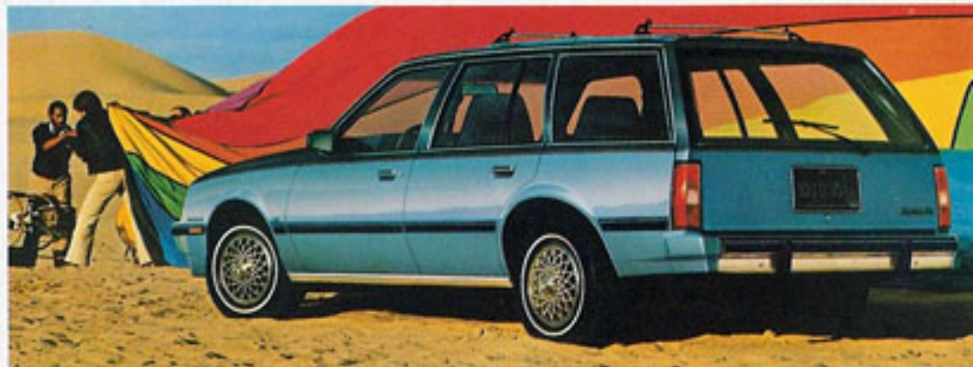
Cavalier CL 4-Door Station Wagon.