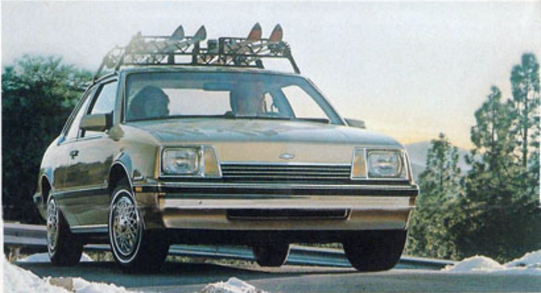
Cavalier CL 2-Door Coupe.