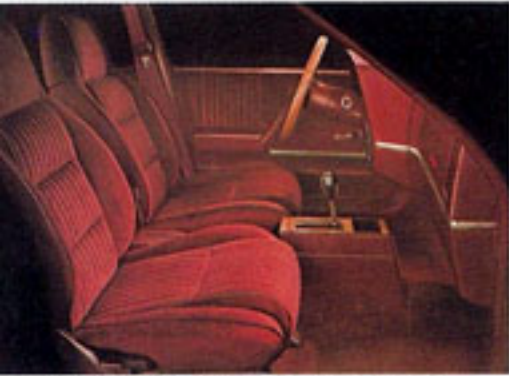
Cavalier CL Custom Cloth interior.