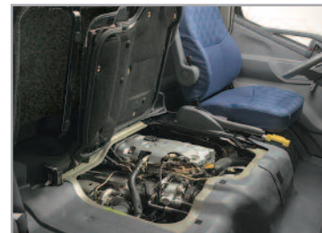
Doghouse engine access under front seats