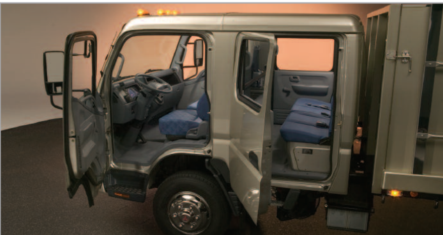
Comfortable cab with ample room for 7