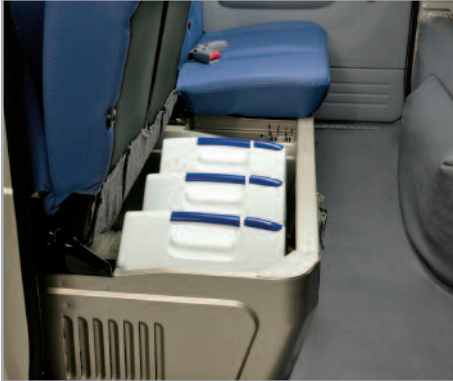
Storage area under rear seats

Forward swing doors for easy, safe entry