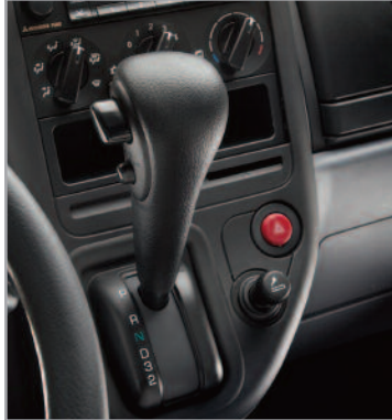
Dash-mounted shifter maximizes leg room