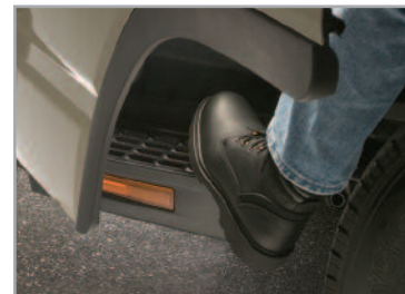
Covered, open-grate front steps stay cleaner