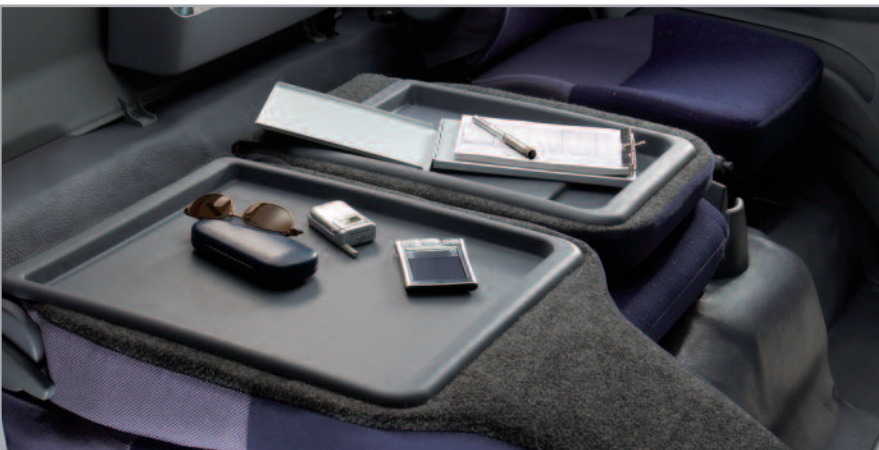
Folding-seat workstation plus added storage.

Forward swing doors for easy, safe entry