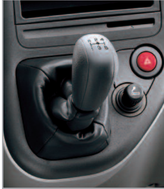
Dash-mounted shifter maximizes legroom