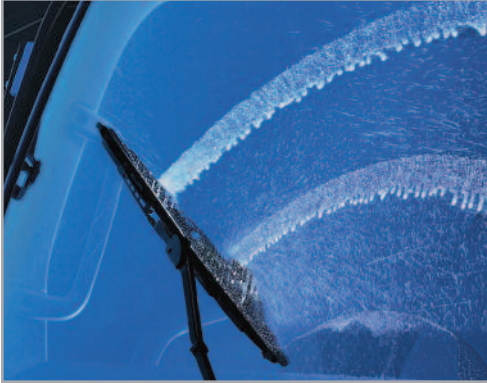
3-speed wet arm windshield wipers