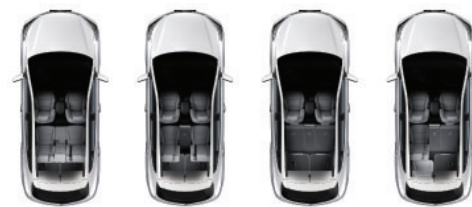
Practical Seat Variations