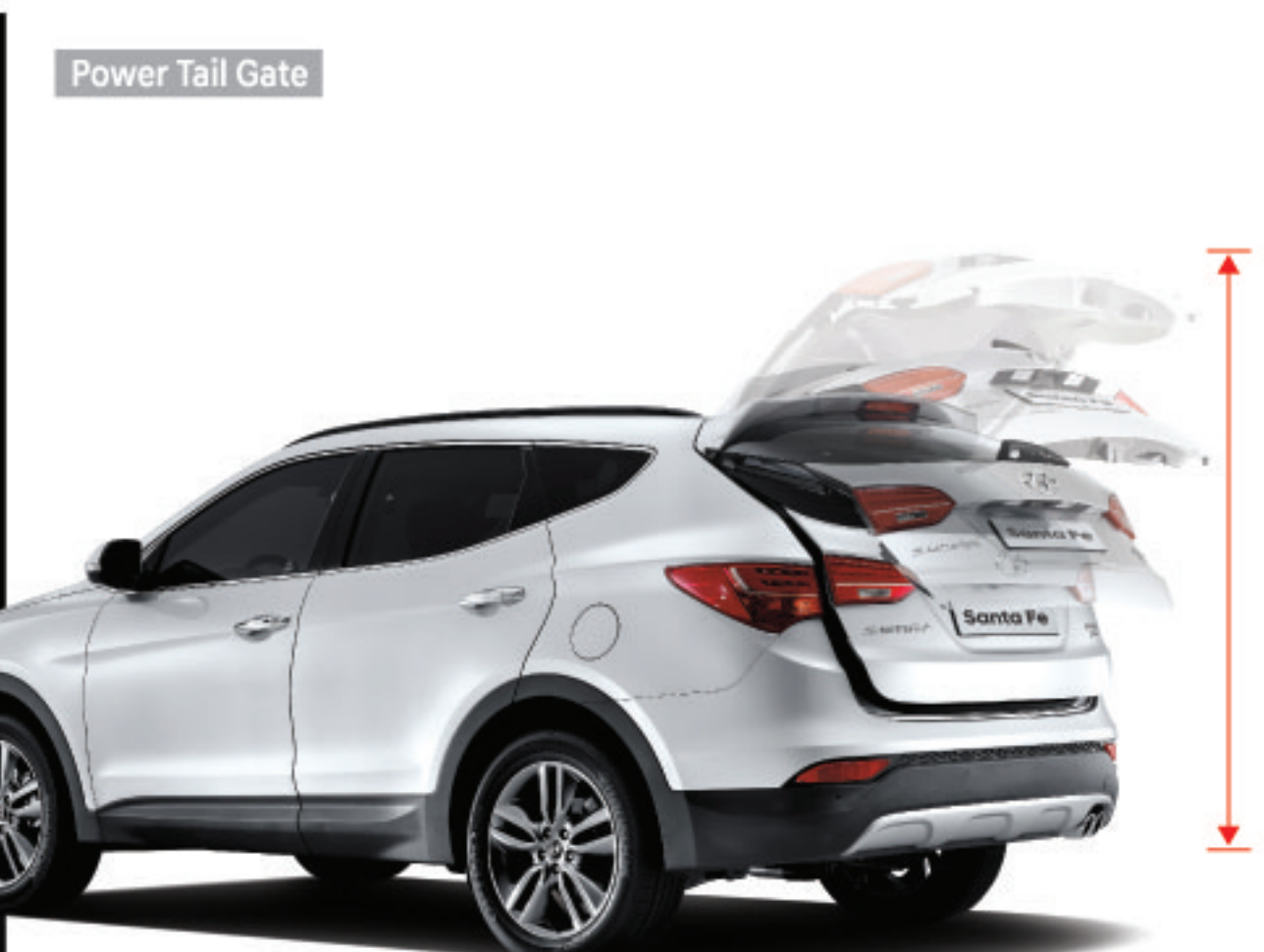
Power Tail Gate