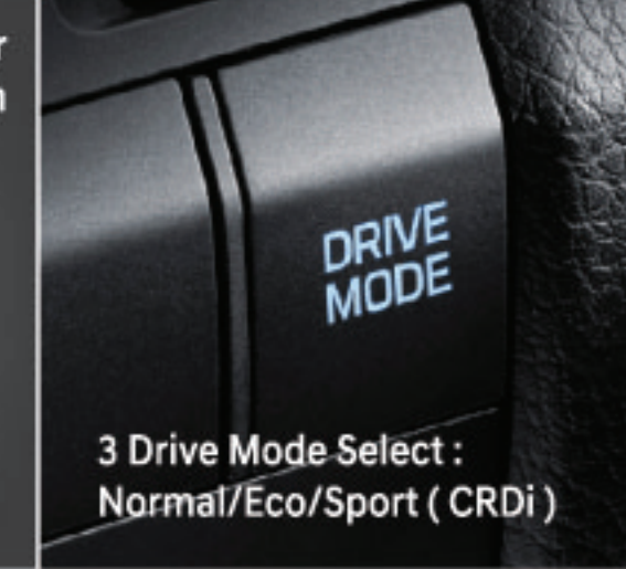
3 Drive Mode Select : Normal/Eco/Sport ( CRDi )