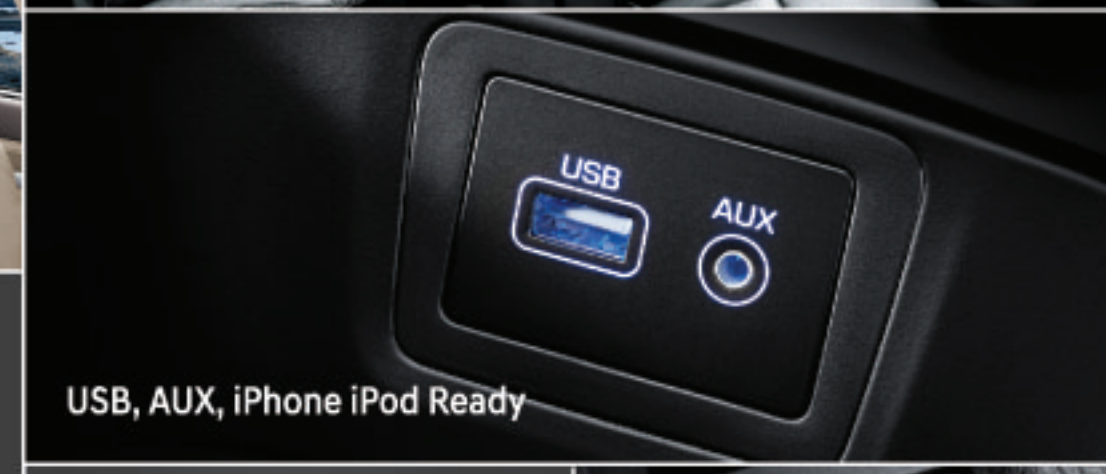
USB, AUX, iPhone iPod Ready