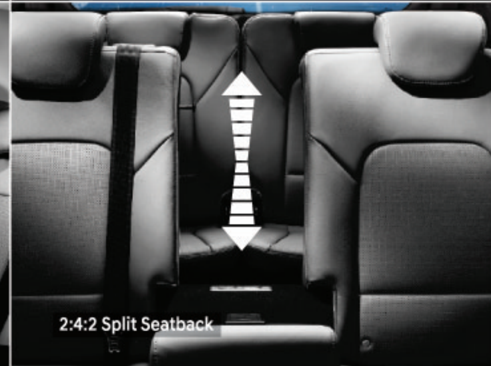
Tilt Steering with Telescopic