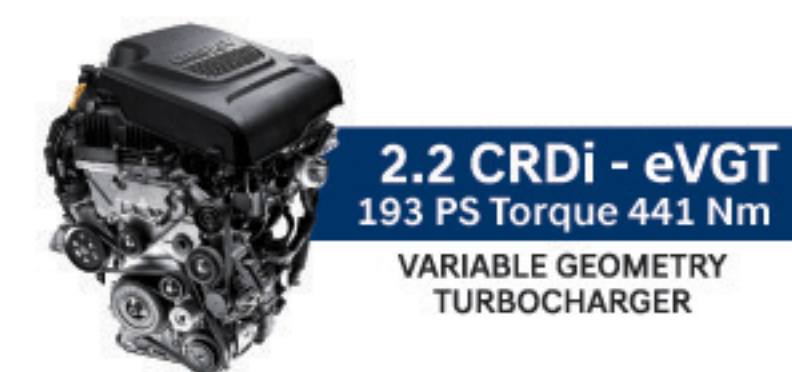
2.2 CRDi - eVGT 193 PS Torque 441 Nm VARIABLE GEOMETRY TURBOCHARGER