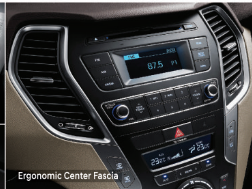
Ergonomic Center Fascia