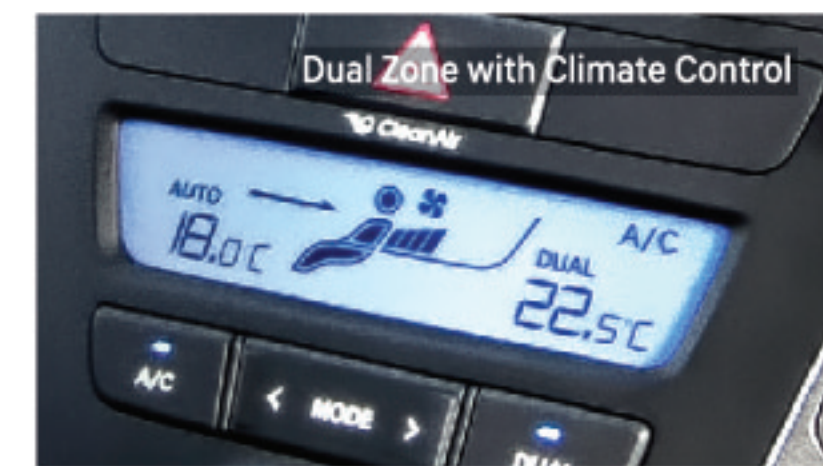
Dual Zone with Climate Control