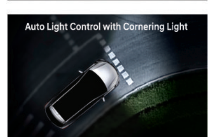
Auto Light Control with Cornering Light