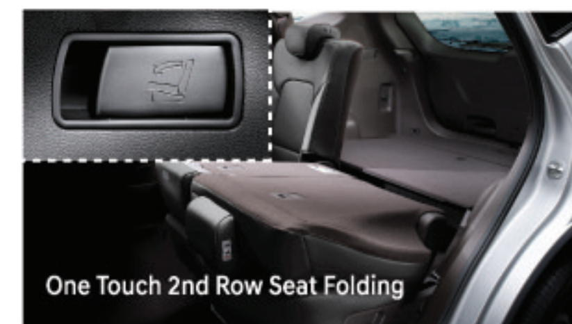
One Touch 2nd Row Seat Folding