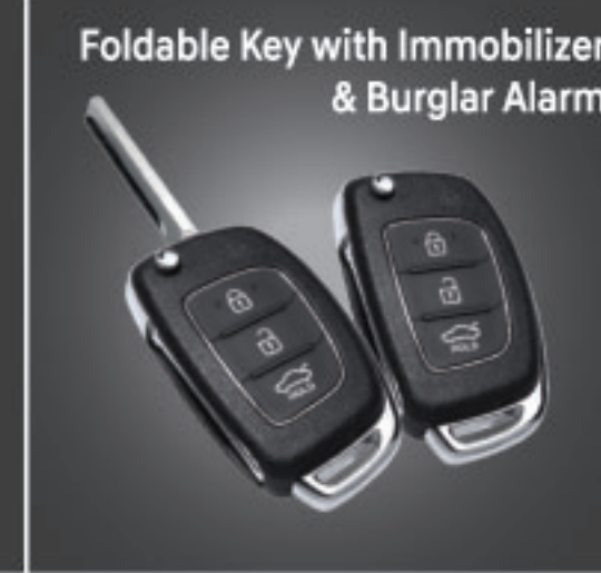
Foldable Key with Immobilizer & Burglar Alarm