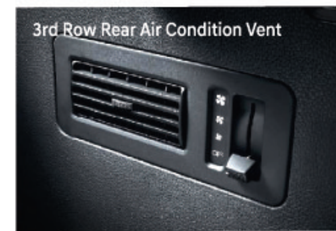
3rd Row Rear Air Condition Vent