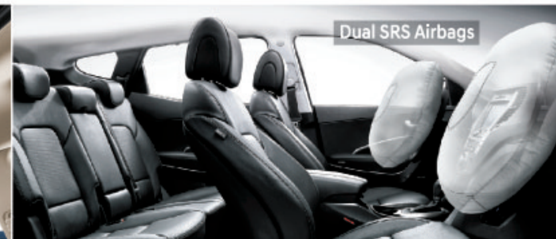
Dual SRS Airbags