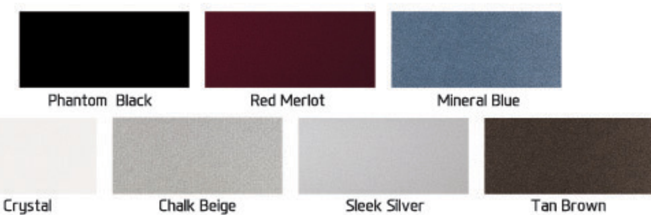
Warna yang ditampilkan berbeda dengan warna sebenarnya karena keterbatasan proses percetakan

Customer Care: (021) 7289 7000, 0800 182 1407, 0812 970 0019 (SMS) cs@hyundaimobil.com | facebook.com/hyundaimobil | @hyundaimobil santafe.hyundaimobil.co.id