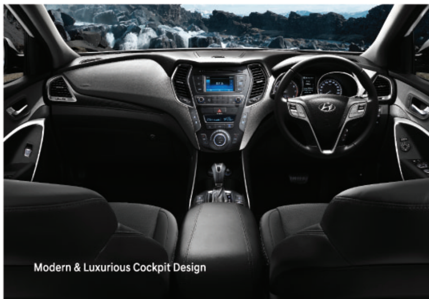
Modern & Luxurious Cockpit Design