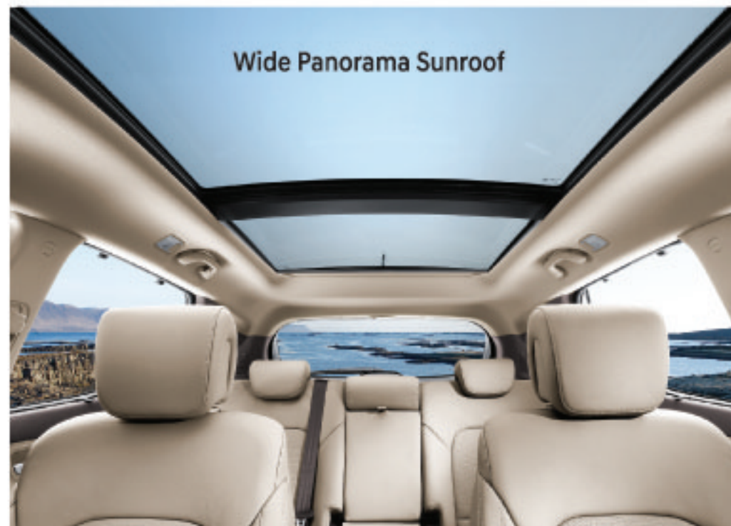
Wide Panorama Sunroof