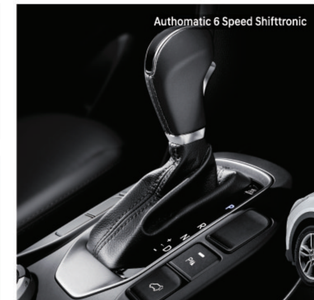
Automatic 6 Speed Shifttronic