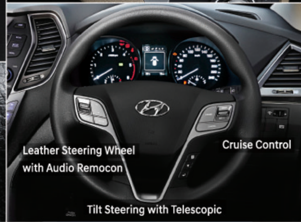
Leather Steering Wheel with Audio Remocon