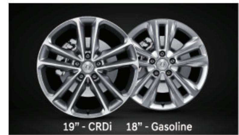
19" - CRDi 18" - Gasoline