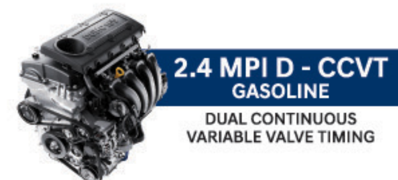
2.4 MPI D - CCVT GASOLINE DUAL CONTINUOUS VARIABLE VALVE TIMING