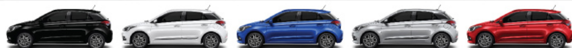
Phantom Black Polar White Pristine Blue Sleek Silver Passion Red

Specifications vary between countries and may change without prior notice. Spesifikasi bisa bervariasi di tiap negara dan sewaktu-waktu bisa berubah tanpa pemberitahuan