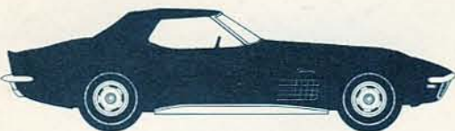
'71 Stingray Convertible

(The one on the reverse side is the Stingray Coupe.)