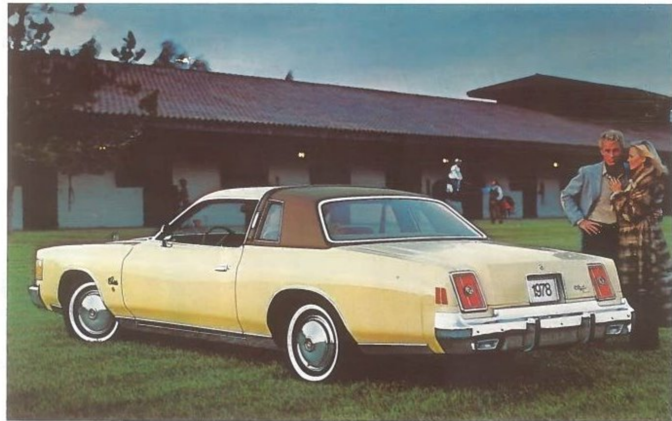
Cordoba with optional Landau vinyl roof

You might call Cordoba inside "contemporary plush". A new thin-back bench seat with centre armrest in Cortez/Whittier body cloth is standard. Or you can choose from new low-back cloth and vinyl or leather bucket seats with applied head restraints. Available also: a new 60/40 bench in Saxony/Whittier body cloth. All 60/40 bench and centre armrest seats feature the new thin-back design that provides more rear seat knee room and easier entry to and exit from rear seats.