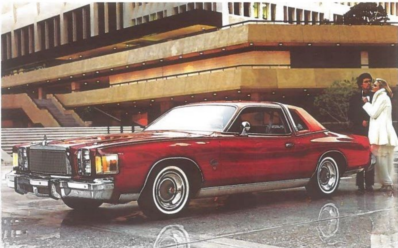
Cordoba with optional "Crown" Landau vinyl roof