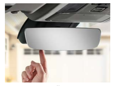
Frameless HomeLink®<sup>39</sup> mirror