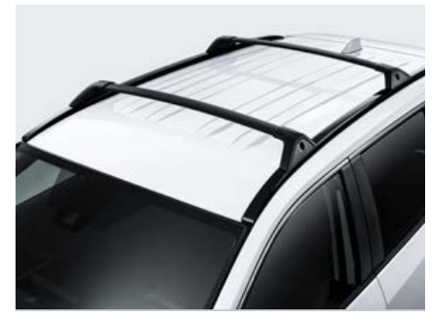
Roof rack cross bars