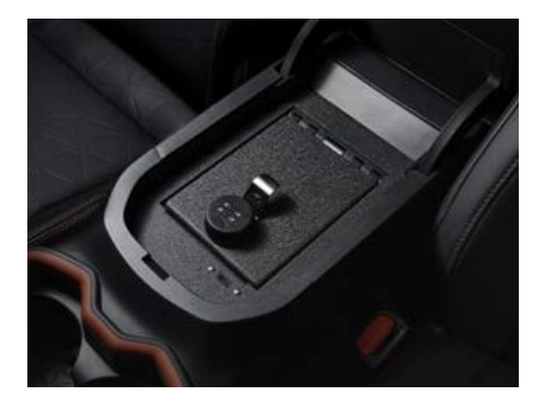
In-vehicle safe by Console Vault®

This is a great way to add extra personality to your RAV4. Not every accessory is available in your area, so for a complete list of accessories, go to toyota.com/rav4/accessories.