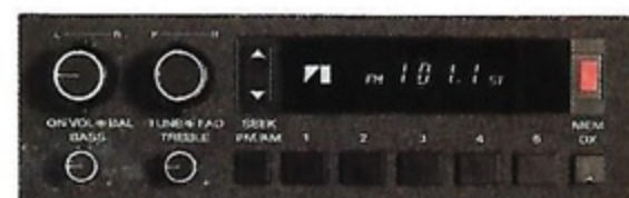
AM/FM ETR STEREO RADIO