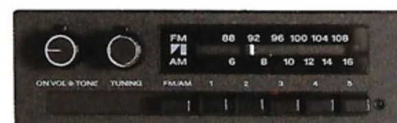
AM/FM MONAURAL RADIO