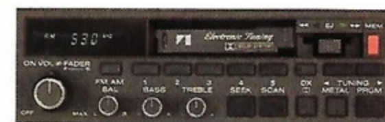
AM/FM ETR DOLBY CASSETTE STEREO RADIO