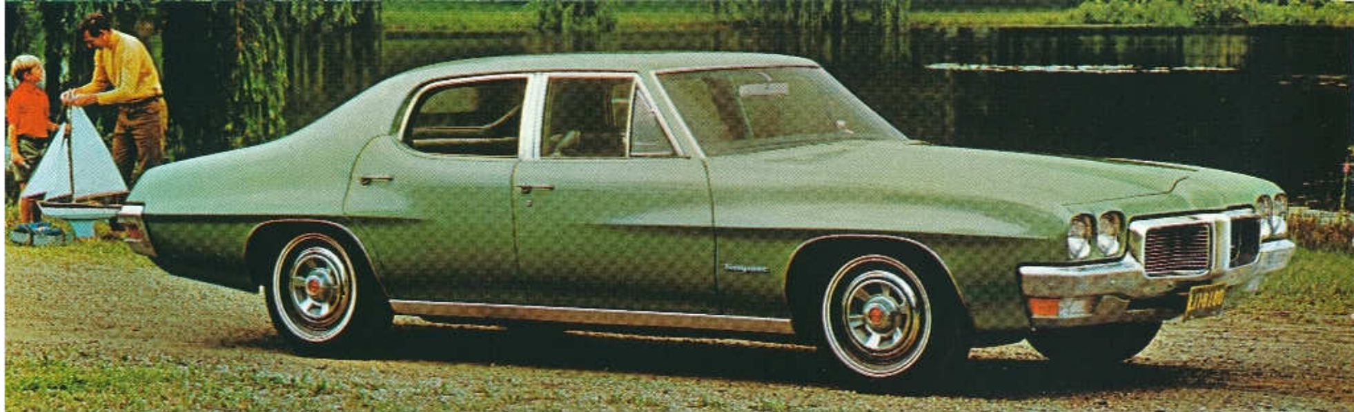
TEMPEST 4-Door Sedan