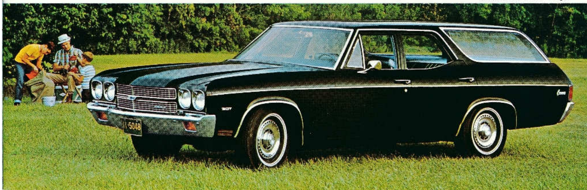
CONCOURS Station Wagon

Chevrolet's 1970 CONCOURS ESTATE, CONCOURS, GREENBRIER and NOMAD station wagons—all built on a 116-inch wheelbase—feature front power disc brakes as standard equipment on all V8 models except Nomad. A distinctive new grille, new front bumper, new parking and front side marker lamps and new body trim add distinction to utility. All-vinyl interiors, a new instrument cluster design and dual-action tailgates are standard on all models.