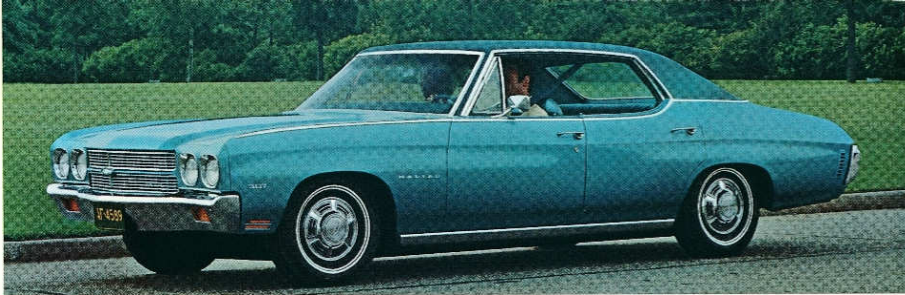
CHEVELLE MALIBU Sport Sedan