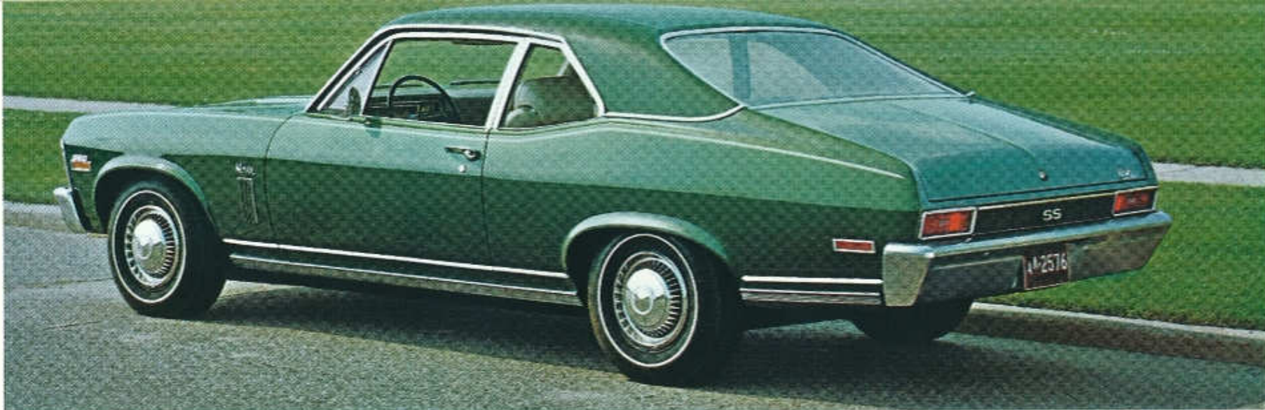
NOVA SS Coupe