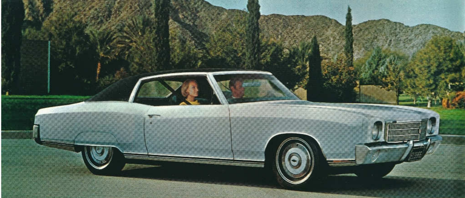
MONTE CARLO Coupe