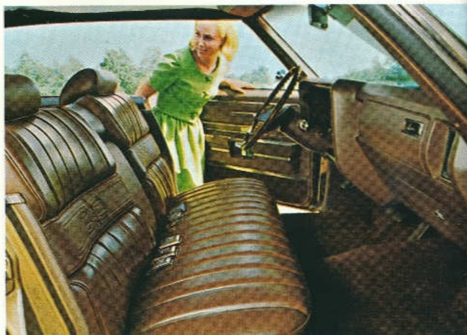
ELECTRA 225 CUSTOM 4-Door Hardtop

The classical elegance of the 1970 Buick ELECTRA 225 is enhanced by its responsive performance and ease of handling. This top-of-the-line Buick has earned a well-deserved reputation for beauty and comfort. Discerning and distinctive styling appointments and a host of standard comfort and convenience items add to the appeal of this luxurious automobile. A big 455 cubic inch V8 engine, Turbo Hydra-matic 400 automatic transmission, power steering and power brakes are all standard equipment. So are a new engine cooling system, a new radio antenna built into the windshield, AccuDrive front suspension and bias-ply, glass-belted tires. A host of optional features allow you to order your Electra 225 to meet your personal standards of motoring style.