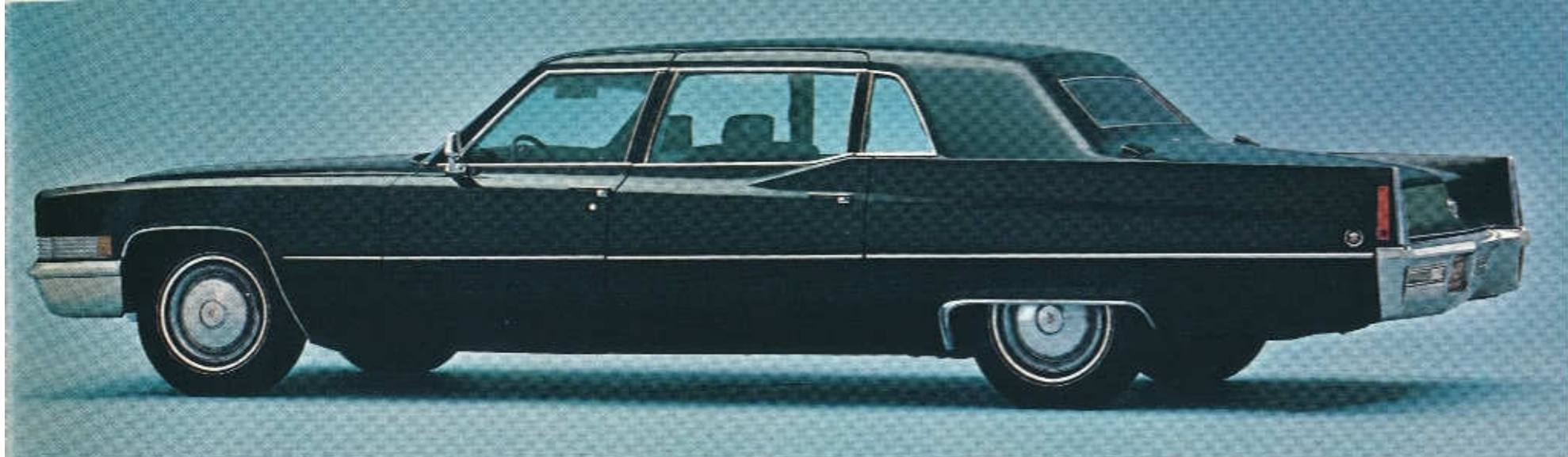
FLEETWOOD SEVENTY-FIVE Sedan