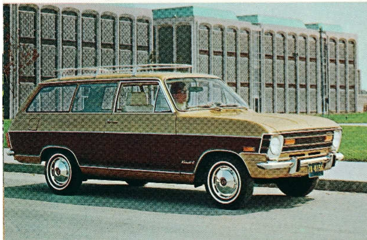
KADETT 2-Door Station Wagon

The 1970 OPEL GT is a true sports car at a moderate price. In addition to its distinctive European styling, standard equipment includes a 67 hp engine, front disc brakes, four-speed console shift, all-steel integral body with roll protection, high performance ignition, concealed headlamps, sculptured bucket seats, tachometer, ammeter, oil gauge and odometer. A 102 hp engine and a fully automatic transmission are available as options. The Opel GT is available through Buick-Opel dealers.