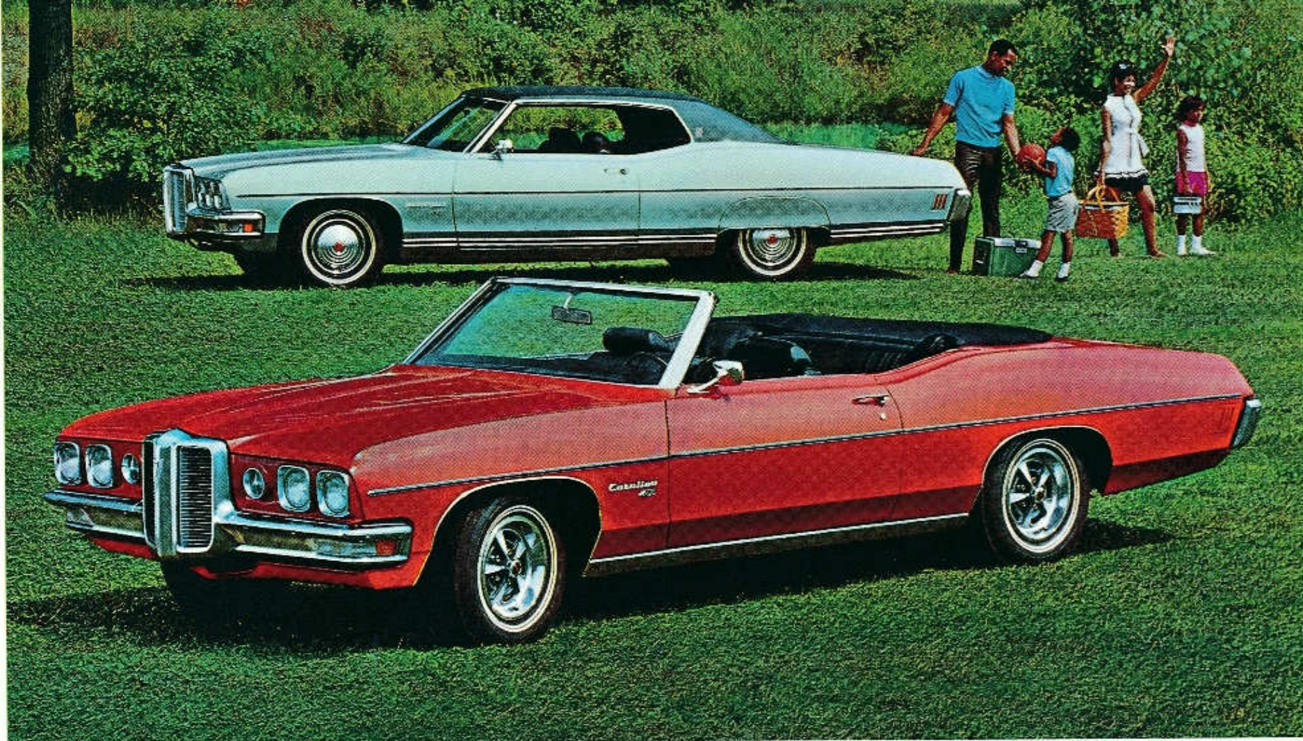
BONNEVILLE Hardtop Coupe