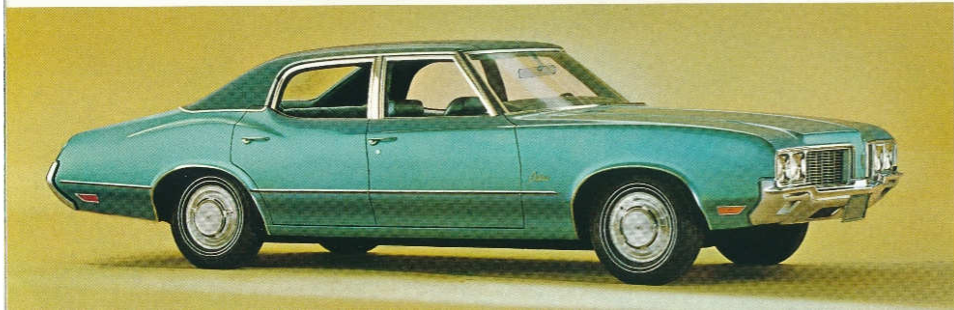
CUTLASS 4-Door Sedan

The stylish and sporty F-85 is a budget-pleasing package that includes a convenient turn-signal lever with a built-in lane-change feature and a selection of the big Action-Line 6 or Rocket 350 V8 engines—both of which get along beautifully and economically on regular fuel. Order your new F-85 in a choice of 19 exterior colors.