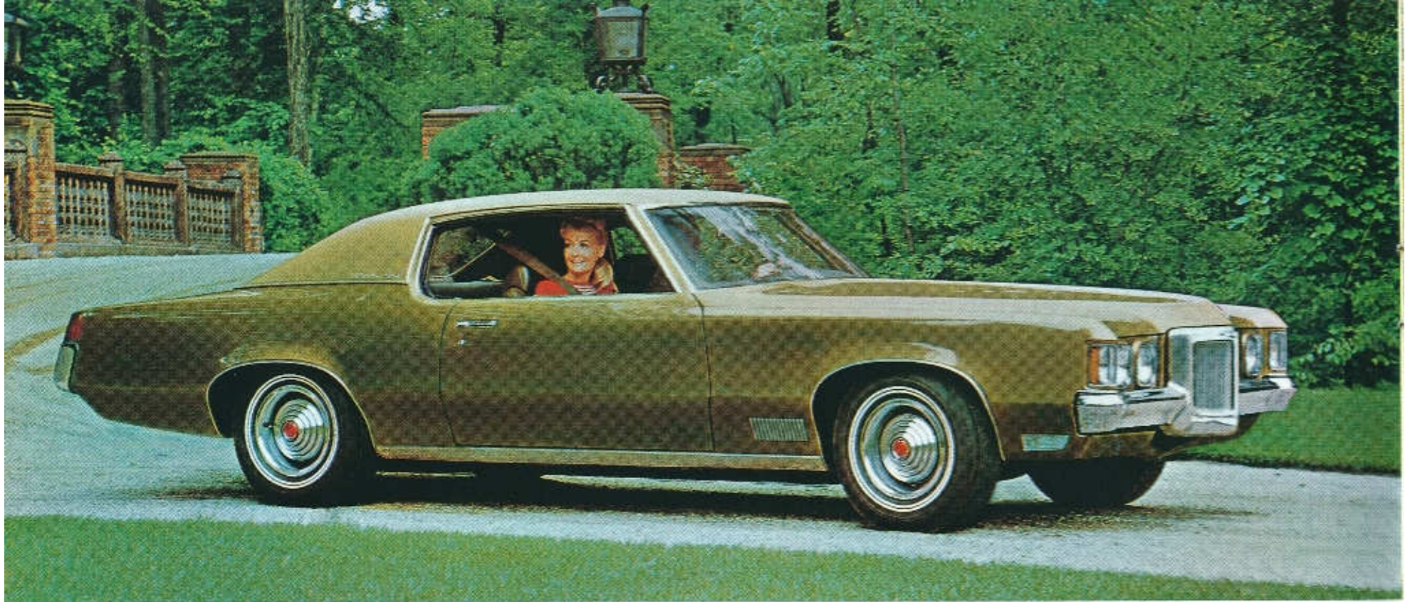
GRAND PRIX Hardtop Coupe