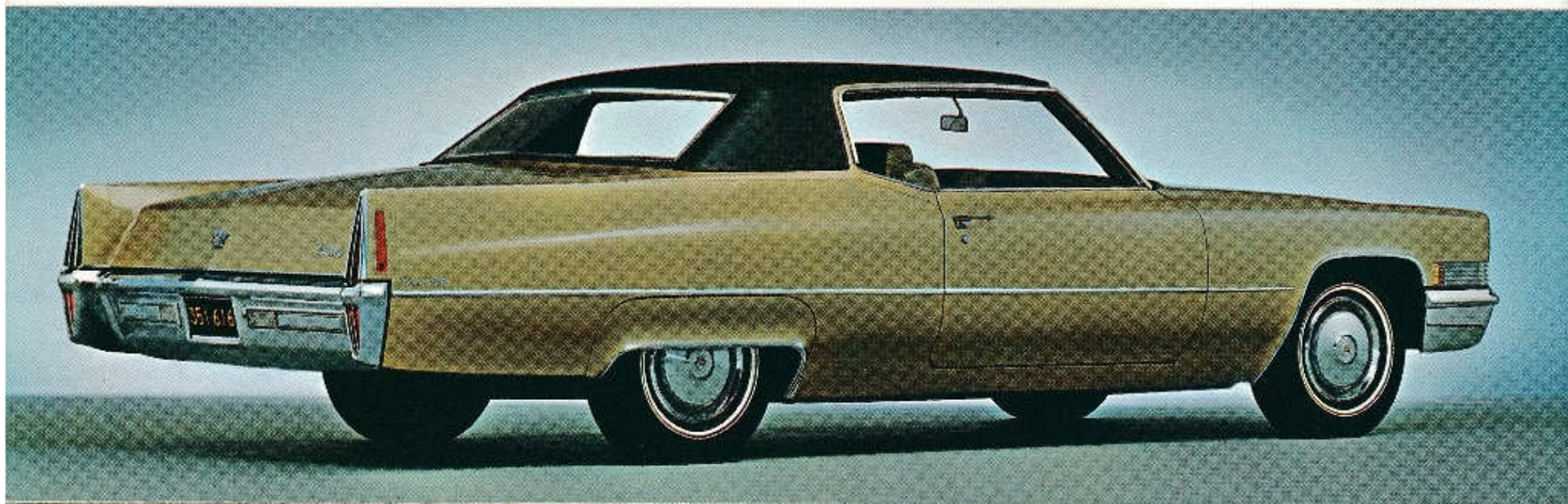
COUPE DE VILLE

car is truly a tasteful and spirited convertible. The COUPE DE VILLE for 1970 captures the spirit of a new era of luxury motoring in the grace of its lines, the spaciousness of its interior, the deftness and agility of its handling and the responsiveness of its engine.