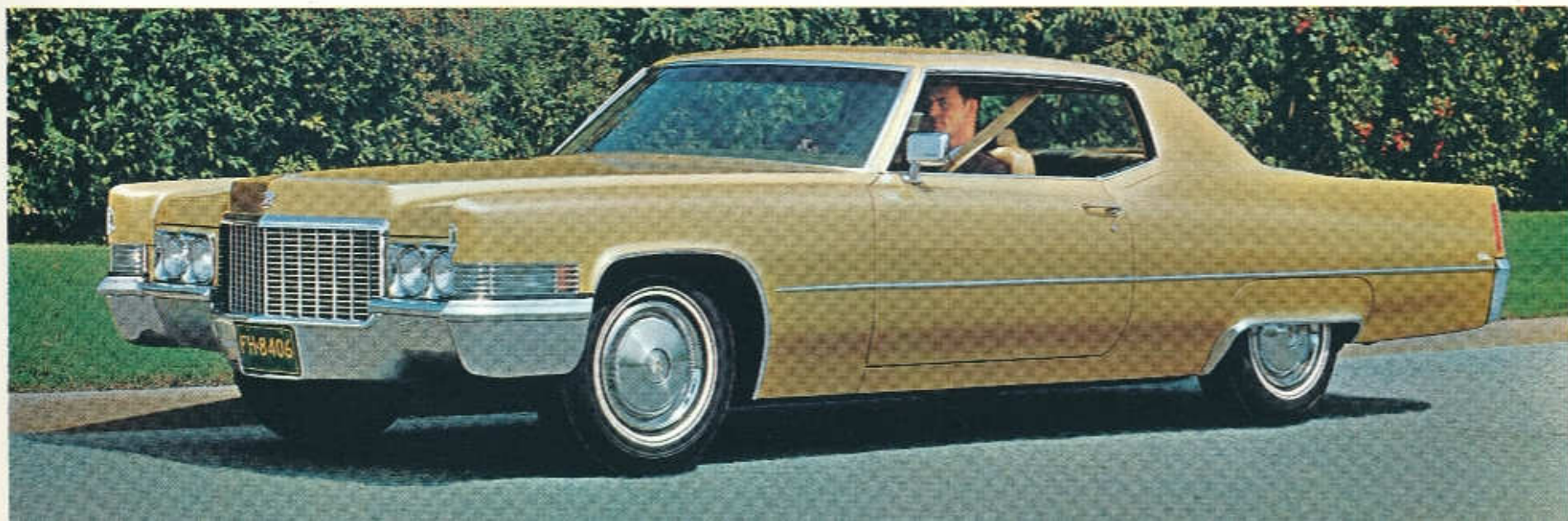
CALAIS Hardtop Coupe

The FLEETWOOD SEVENTY-FIVES offer unmatched splendor. No other motor cars are so luxuriously appointed for comfort, convenience and privacy. The Seventy-Fives are regarded the world over—in the business community and in the social sphere—as the most impressive of motor cars.