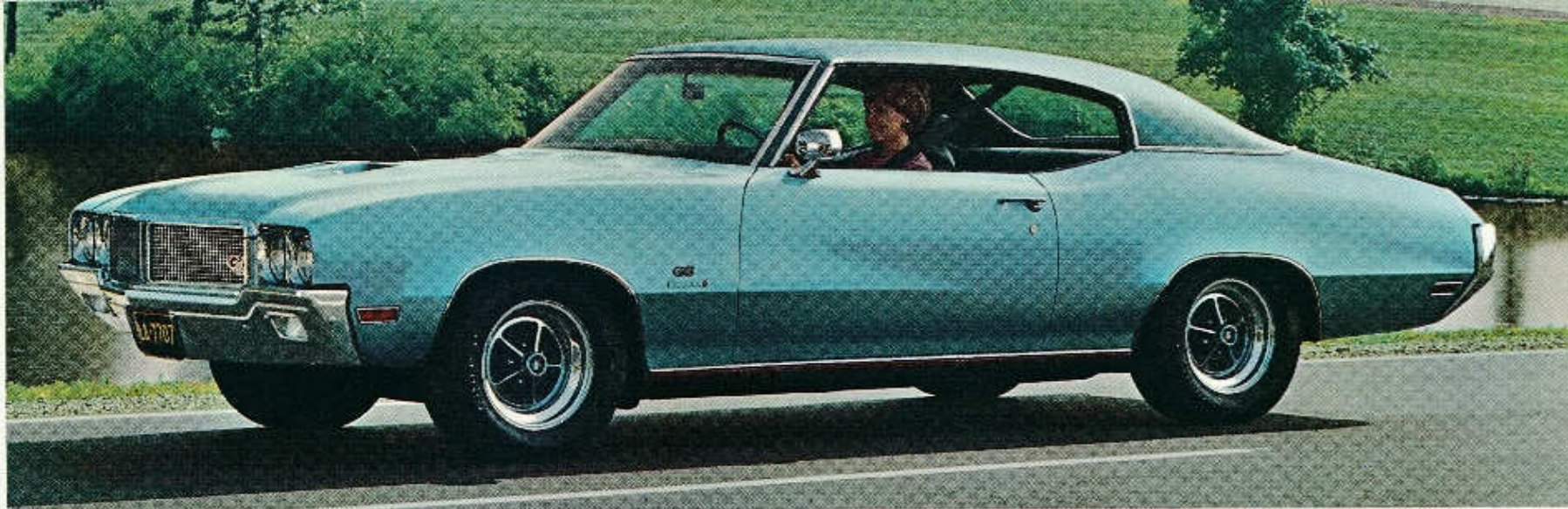
GS 455 STAGE 1 Hardtop Coupe