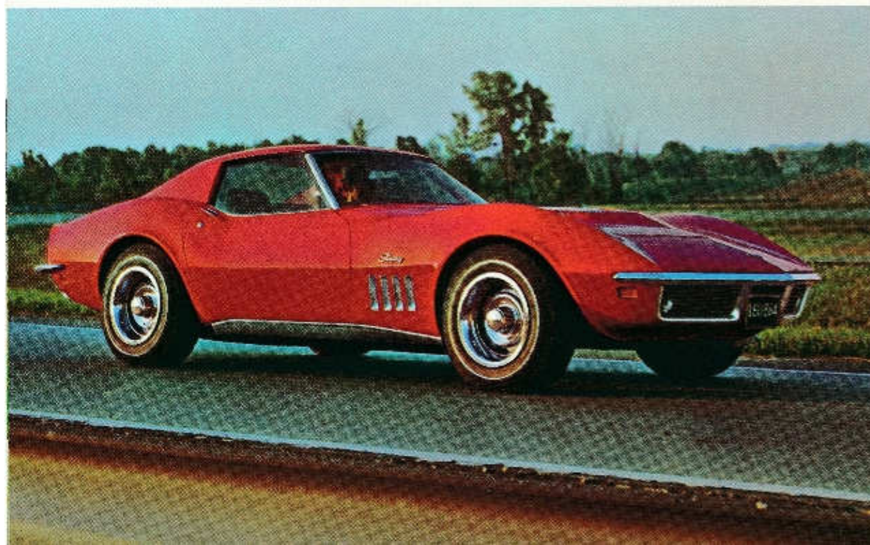
CORVETTE STINGRAY Sport Coupe