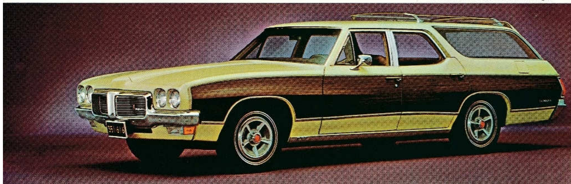
LE MANS SPORT SAFARI Station Wagon

Pontiac's FIREBIRD combines sleek, sports car styling with big car ride and performance. Firebird's handsome exterior is matched only by the luxury of its interior. Firebird is also available in Sprint and 400 models. Nineteen-seventy model Firebirds will be introduced in early 1970. Firebird shown is continued from previous model year.