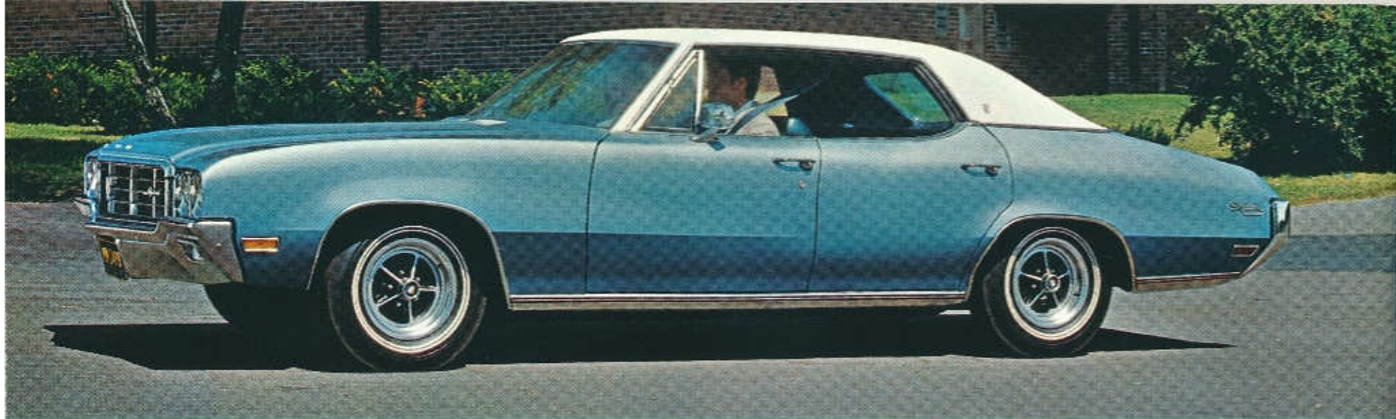
SKYLARK CUSTOM 4-Door Hardtop