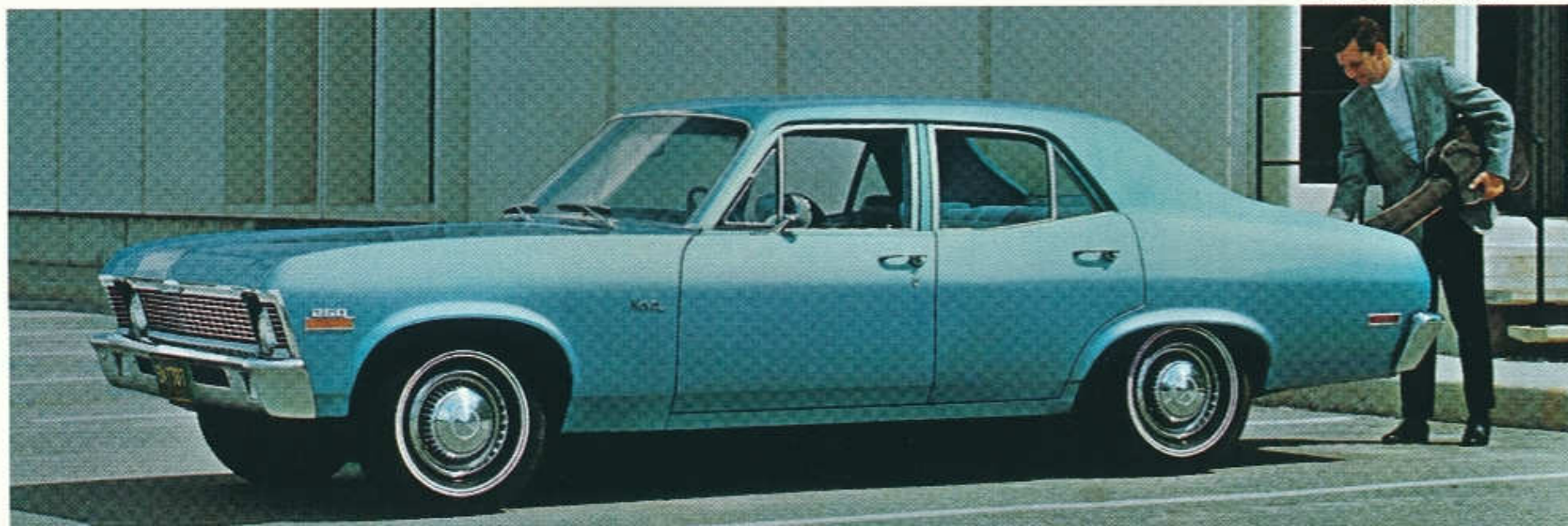
NOVA 4-Door Sedan

shoulder room. The beautiful Body by Fisher means more value, more corrosion resistance, more strength. Nova can be ordered with a choice of six engines and five transmissions—including the low-cost, no clutch Torque-Drive—as well as many other exciting and useful options.