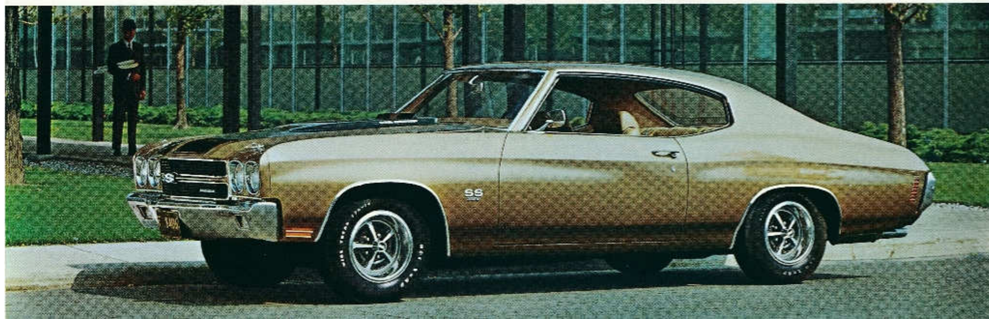
CHEVELLE SS 396 Sport Coupe

ment panel of molded fiberglass-reinforced plastic. The Chevelle SS 396 option includes power front disc brakes and special exterior ornamentation. In addition, a Cowl Induction Hood that delivers extra air to the engine, may be ordered with the SS 396 package.