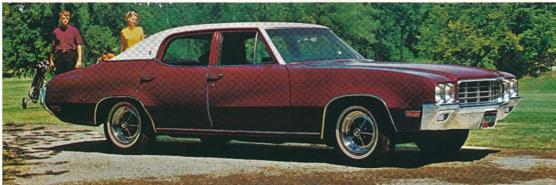
SKYLARK 4-Door Sedan

convenience and passenger protection. A 350 cubic inch V8 engine which gives four-barrel performance on regular-grade gasoline is optional on all 1970 Skylarks. The availability of the Turbo Hydra-matic transmission on all Skylark models is also new this year.