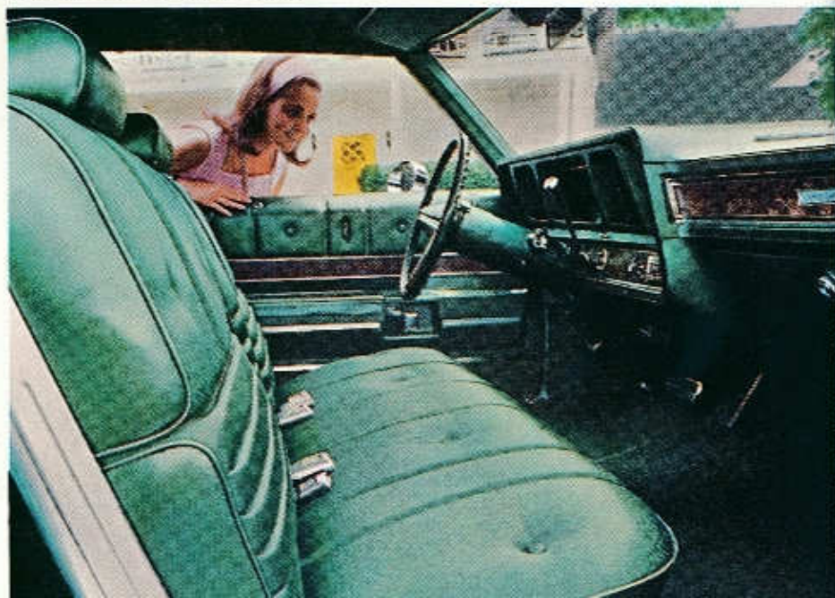
NINETY-EIGHT Holiday Coupe

The 1970 Oldsmobile NINETY-EIGHT sets new standards in its field. Its long, classic look and luxurious appointments continue to emphasize elegance. Styling refinements include a new vertical taillamp pattern, a restyled grille and a hood designed to further the impression of fleetness. Everywhere you look, the Ninety-Eight has been improved—even to the standard equipment it provides for effortless motoring: Vari-Ratio Power Steering, for more responsive handling; new Tandem Power Booster Brakes, with front disc brakes for quick, efficient stops; and Turbo Hydra-matic transmission and Rocket 455 V8 engine, both engineered for still smoother and more precise power. Special interior treatments and fabrics reflect the luxurious Ninety-Eight tradition.