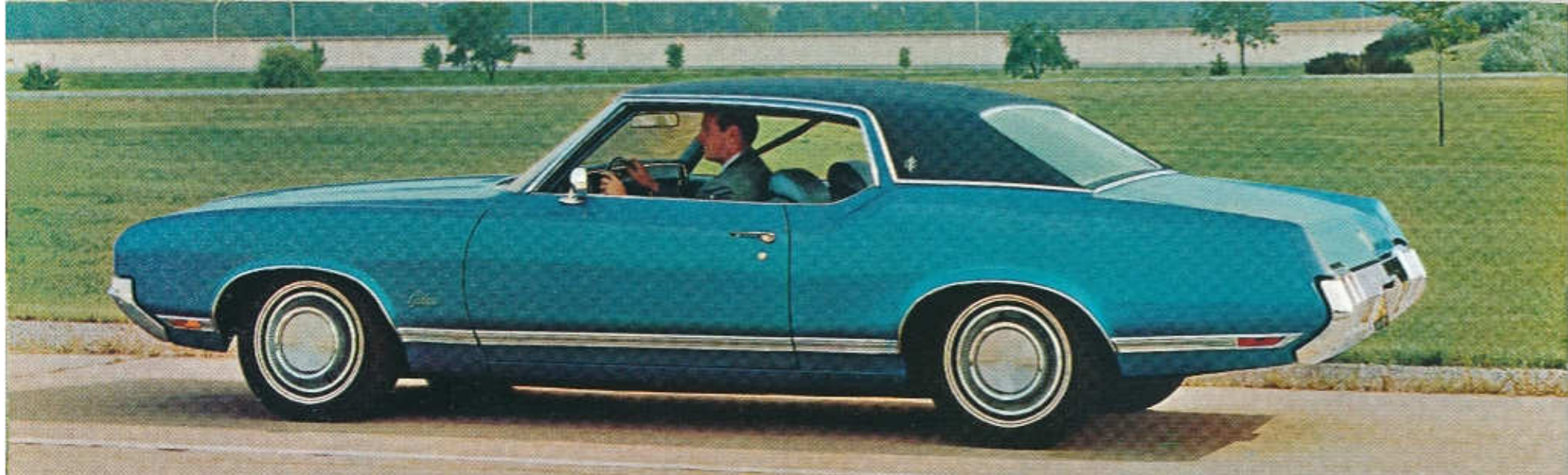
CUTLASS SUPREME Holiday Coupe