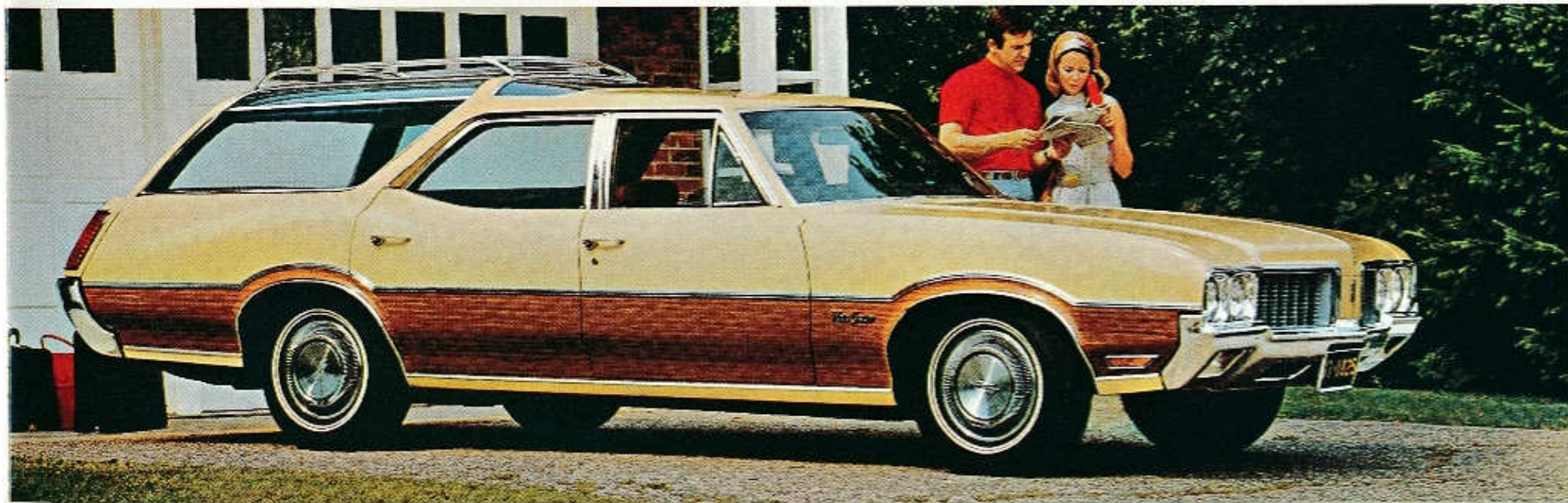
VISTA-CRUISER Station Wagon

VISTA-CRUISER Station Wagons for 1970 are loaded with work-saving features. The second seat (in the 3-seat model) folds forward for quick and easy in-and-outing. There is more than 100 cubic feet of cargo space, and a dual-action tailgate is available. To top it off, there's Vista-Cruiser's beautifully unique windowed roof.