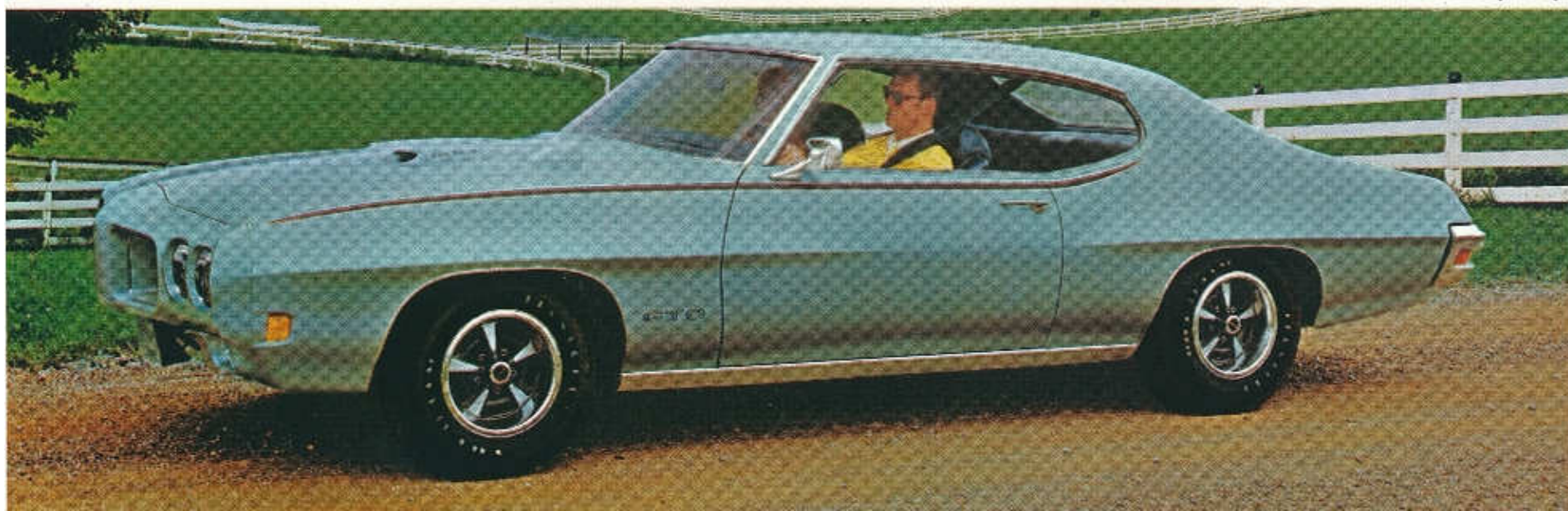
GTO Hardtop Coupe

GTO. New colors and redesigned instrument panels are combined with safety and comfort features inside the restyled 1970 Pontiac TEMPEST. Instruments and controls are deeply recessed and surrounded by thick vinyl padding. Three optional engines are available.