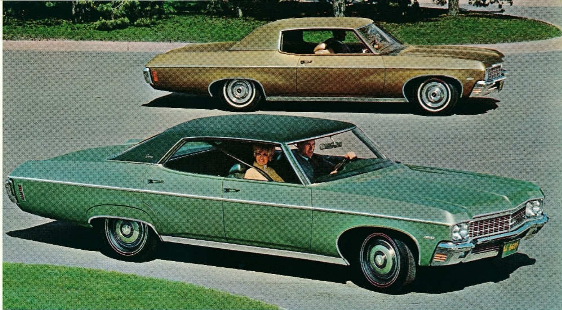
CAPRICE Sedan (foreground)