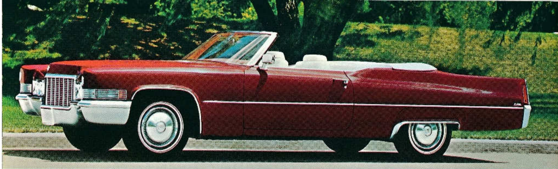
DE VILLE Convertible