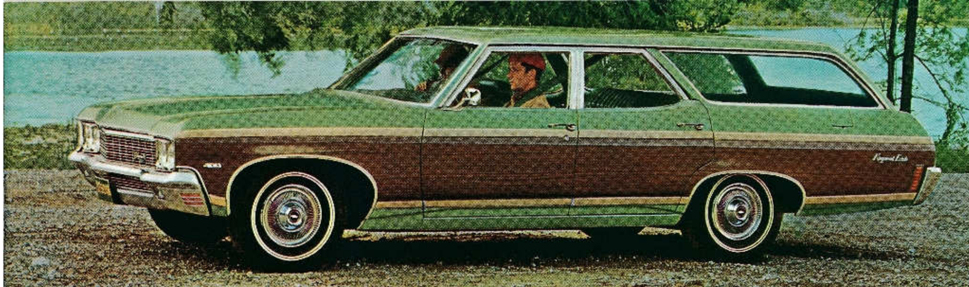
KINGSWOOD ESTATE Wagon