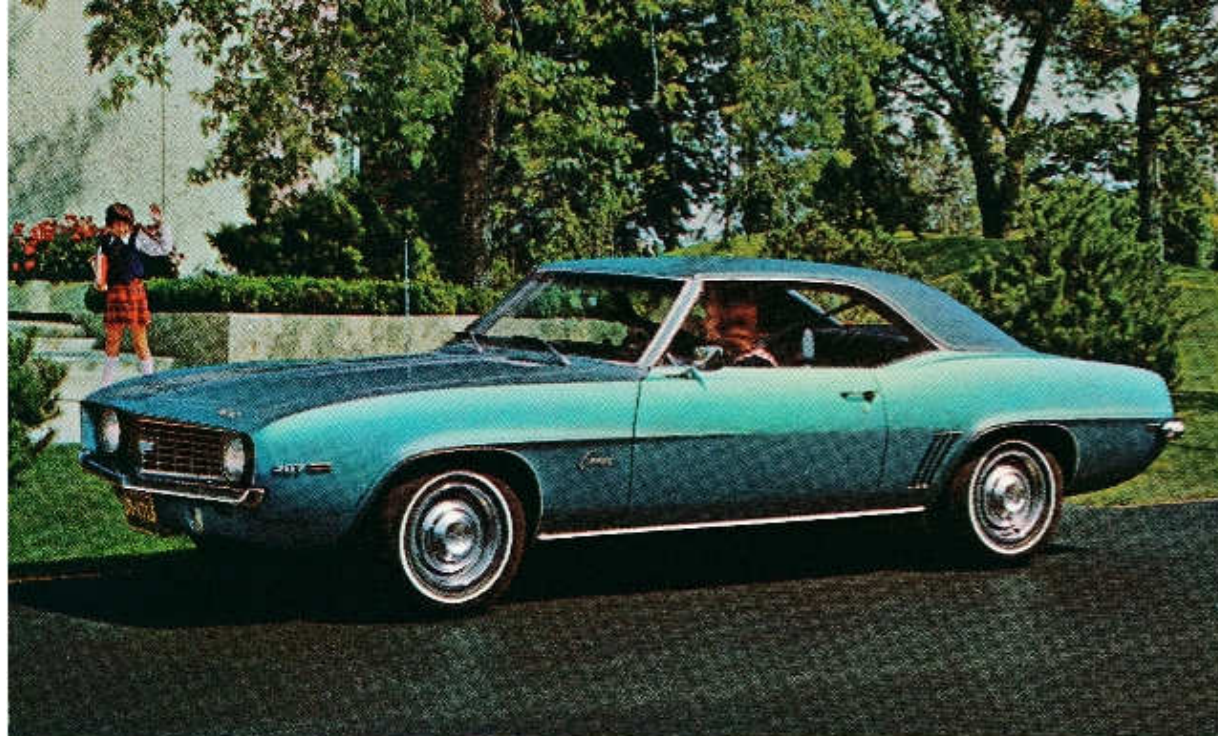
CAMARO Sport Coupe

The aerodynamic lines of Chevrolet's CORVETTE distinctively identify America's original modern sports car—one that goes, stops and handles like few other automobiles. A 350 cubic inch 300 hp V8 engine and front and rear disc brakes are standard. Other standard Corvette features include an anti-interference ignition system, a high-output Delcotron generator, rust-proof fiberglass body and a full complement of GM safety and anti-theft features. A wide range of performance, trim, comfort and convenience options is available.