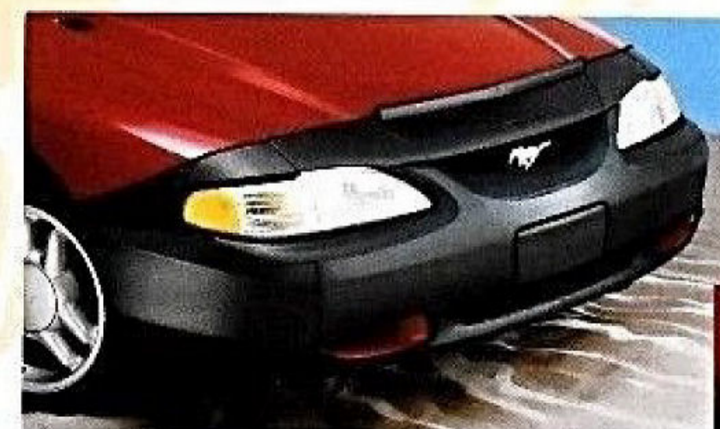
Full Front End Cover