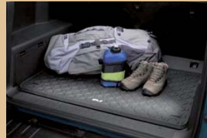
All-weather cargo mat