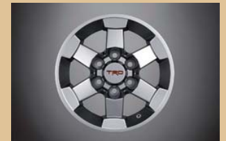
TRD 16-in. 6-spoke alloy wheels