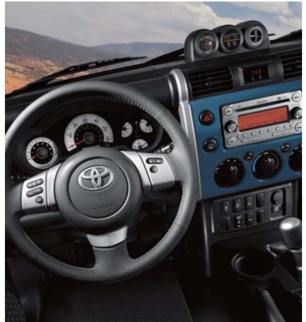
FJ Cruiser 4x4 interior shown with available Upgrade Package.

Leave no stone unclimbed. That's the spirit with which the 2012 FJ Cruiser is built. And to help it live up to that credo, it's got nearly eight inches of wheel travel in the front and more than nine in back. FJ boasts a rock-solid boxed steel ladder frame, 260 hp and 271 lb.-ft. of torque. It also offers an available locking rear differential and Active Traction Control (A-TRAC). With a rugged, versatile and easy-to-clean interior, FJ Cruiser can handle almost anything Mother Nature can dish out. Moving Forward.