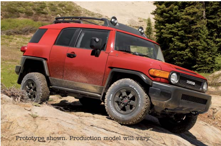
Prototype shown. Production model will vary

Package includes Radiant Red exterior color (including roof); black bumpers, grille, door handles, power outside mirrors with illuminated markers and rock rails; Trail Teams badge, TRD 16-in. 6-spoke Special Edition alloy wheels with BFGoodrich® All-Terrain LT265/75R16 tires, wheel locks, rear wiper, privacy glass on rear side, quarter and rear door windows, roof rack; cruise control, leather-trimmed steering wheel, floating-ball Multi-Information Display with inclinometer, compass and outside temperature; red-accented door trim, fabric seat inserts and steering wheel; remote keyless entry system, auto-dimming rearview mirror with integrated backup camera 2 display, one 115V/400W AC power outlet, Daytime Running Lights (DRL), Active Traction Control (A-TRAC), electronically controlled locking rear differential, 3 and Trail-tuned Bilstein® shock absorbers