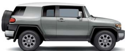
SILVER FRESCO METALLIC