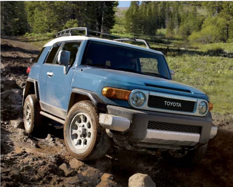
FJ Cruiser shown in Cavalry Blue with available Upgrade Package and available accessory roof rack and rock rails.