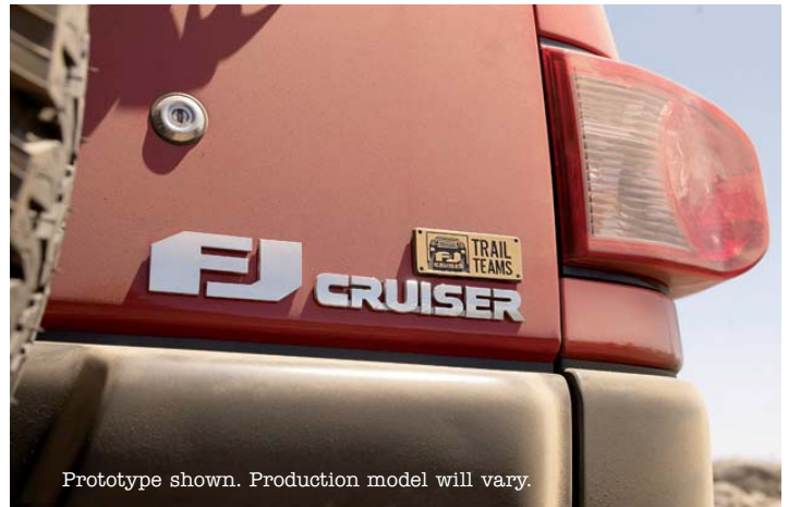
Prototype shown. Production model will vary.