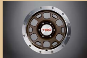
TRD 16-in. off-road beadlock-style wheels (black or bronze)