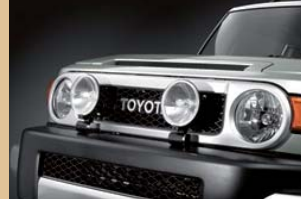
Auxiliary driving lights