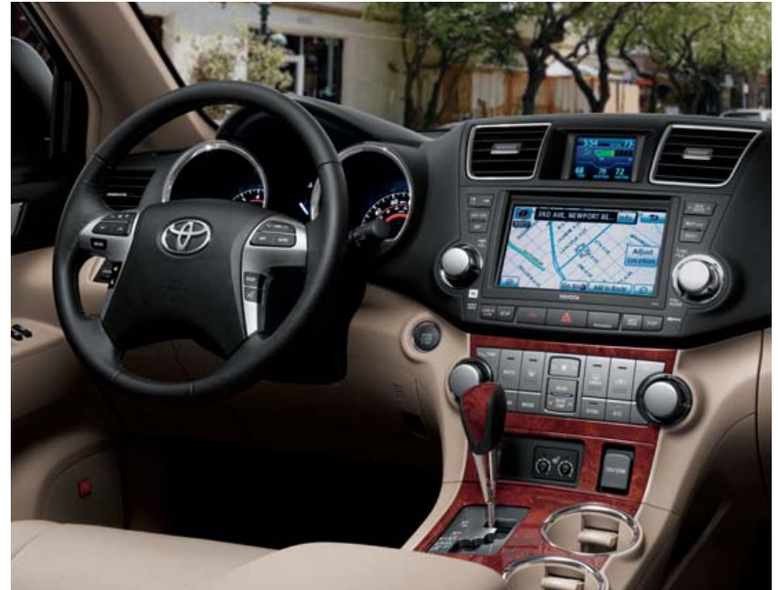
Limited interior shown in Sand Beige with available voice-activated touch-screen navigation system 1 .

Life can be filled with challenges. Happily, the 2012 Toyota Highlander is filled with solutions. For starters, it seats up to seven. And with a 50/50 split fold-flat third-row seat and a second-row Center Stow™ system, it's remarkably versatile. It provides an array of standard safety features, including the Star Safety System™ and seven airbags 2 . There's a host of thoughtful features, like an available power liftgate and Smart Key System. 3 But Highlander shines especially brightly when it's filled with one thing in particular: your family. 2012 Toyota Highlander. Moving Forward.