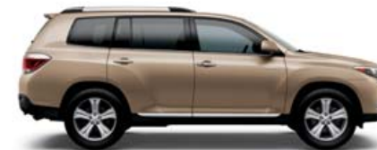
SANDY BEACH METALLIC 1