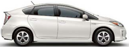
BLIZZARD PEARL (extra-cost color)