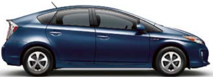
NAUTICAL BLUE METALLIC