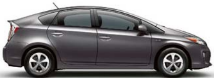
WINTER GRAY METALLIC