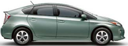
SEA GLASS PEARL