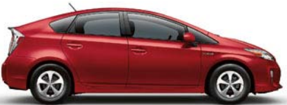
BARCELONA RED METALLIC