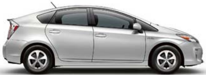
CLASSIC SILVER METALLIC