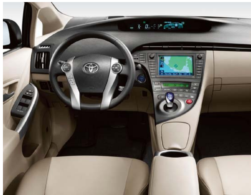
Prius Four interior shown in Bisque SofTex trim with available Deluxe Solar Roof Package 1

The 2012 Toyota Prius has demonstrated that there can be harmony between man, nature and machine. Prius has also shown that there can be consensus among many different types of drivers. Those who demand fuel efficiency, and those who like to take the fast lane. Those intrigued by advanced technology, and those who want proven reliability. Those interested in reducing their carbon footprint, and those hesitant to sacrifice practicality in order to do it. With all that Prius has to offer, it may be the one vehicle we can all agree on. 2012 Toyota Prius. Moving Forward.