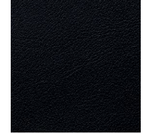
BLACK LEATHER or SEMI-ANILINE LEATHER*