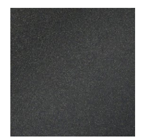
SILVER METALLIC FINISH**