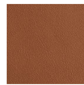
SADDLE SEMI-ANILINE LEATHER*