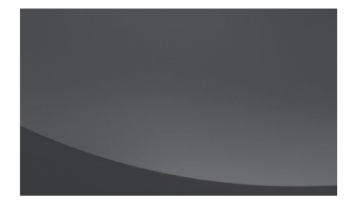
NEBULA GRAY PEARL