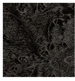
DARK GRAY BIRD'S-EYE MAPLE*