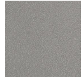
LIGHT GRAY SEMI-ANILINE LEATHER*