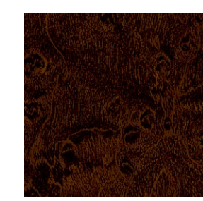
ESPRESSO BIRD'S-EYE MAPLE*