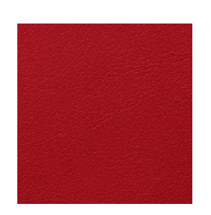
RED SEMI-ANILINE LEATHER*