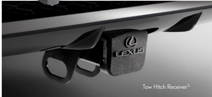
Tow Hitch Receiver 5