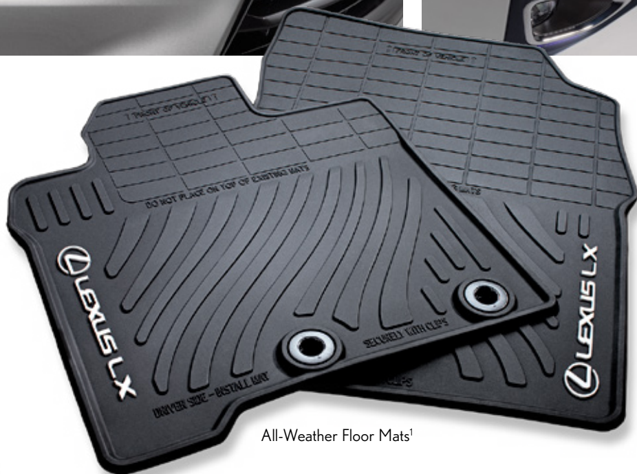
All-Weather Floor Mats 1