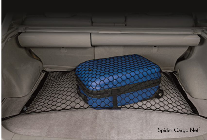
Spider Cargo Net 2