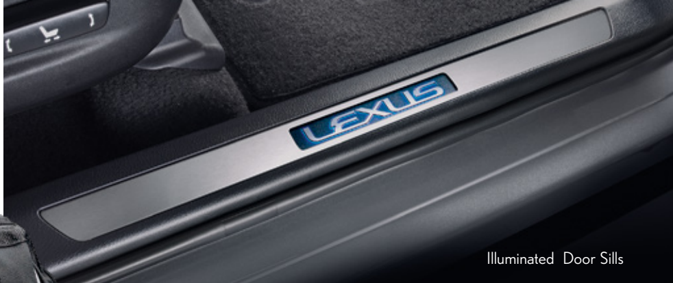
Illuminated Door Sills