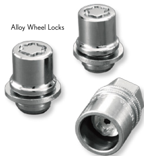
Alloy Wheel Locks