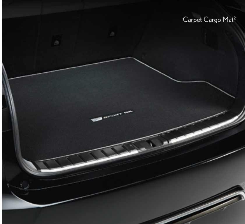
Carpet Cargo Mat 2