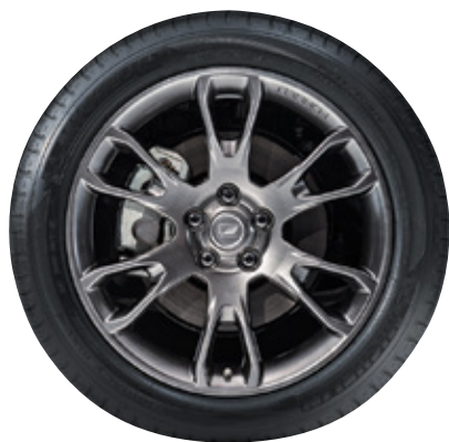
19-in Split-Six-Spoke Forged Alloy Wheels 6