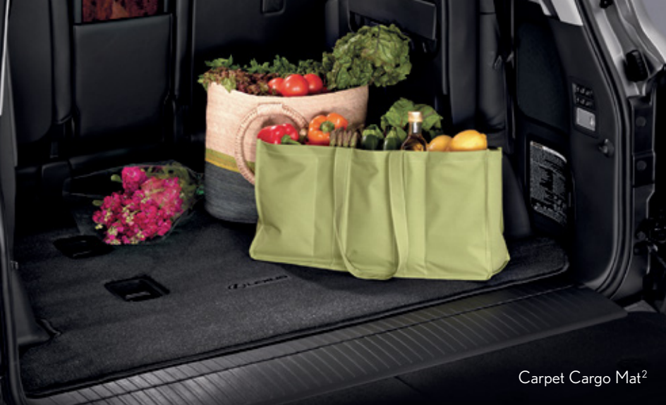
Carpet Cargo Mat 2