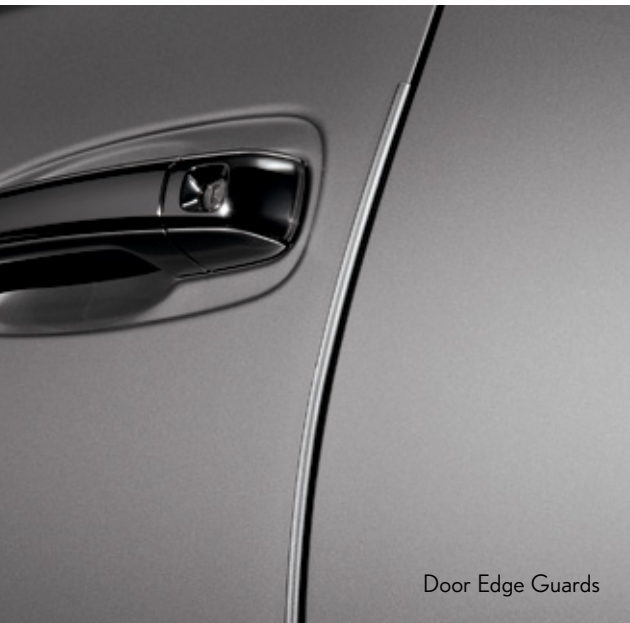
Door Edge Guards