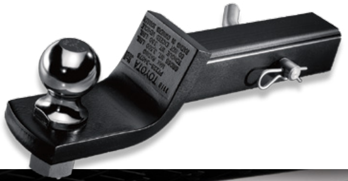
Ball Mount/Trailer Ball 5