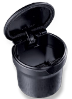
Coin Holder/Ashtray Cup