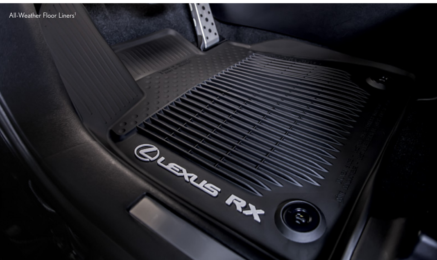
All-Weather Floor Liners 1