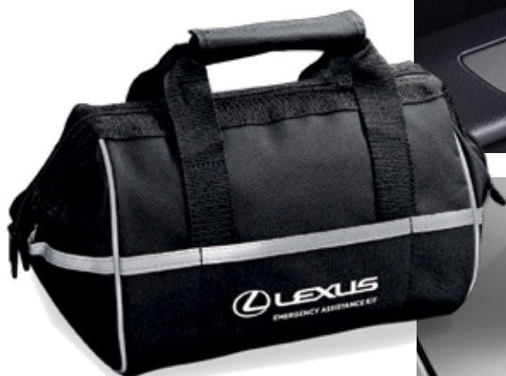
Emergency Assistance Kit