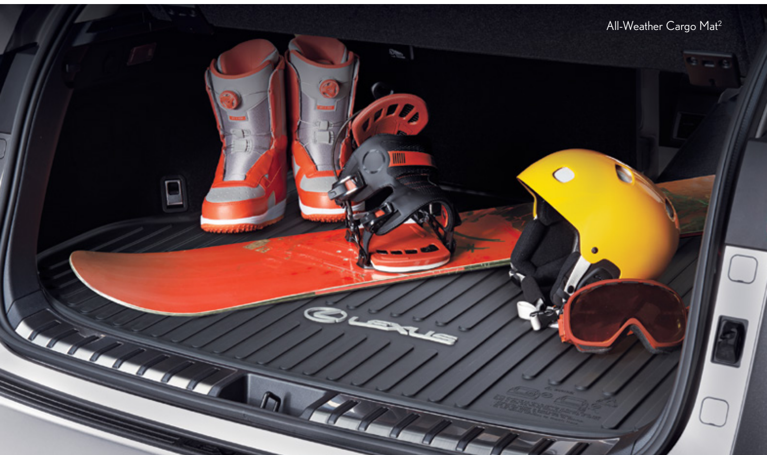
All-Weather Cargo Mat 2