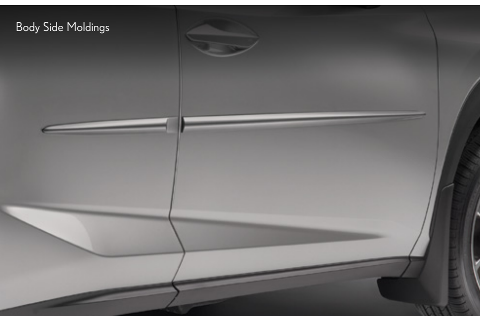
Body Side Moldings