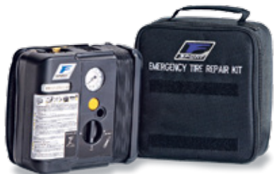
Flat Tire Repair Kit