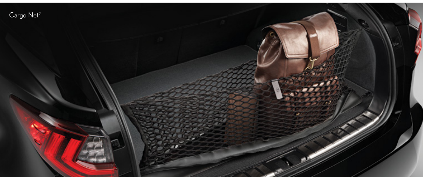
Cargo Net 2