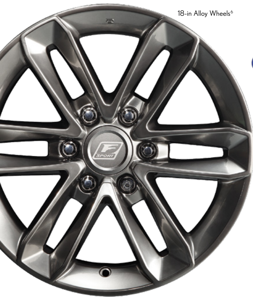
18-in Alloy Wheels 6

Engineered to the highest standards, F SPORT 7 accessories are designed and developed to Lexus specifications for quality and refinement, and come with complete warranty coverage. Most importantly, they offer performance improvements to help maximize the capabilities of your Lexus.