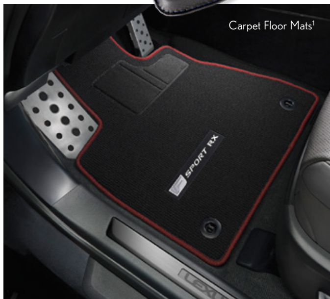
Carpet Floor Mats 1