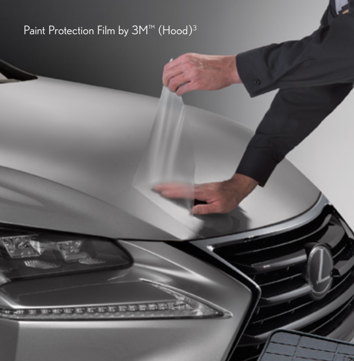
Paint Protection Film by 3M™ (Hood) 3