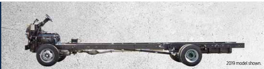
2019 model shown.