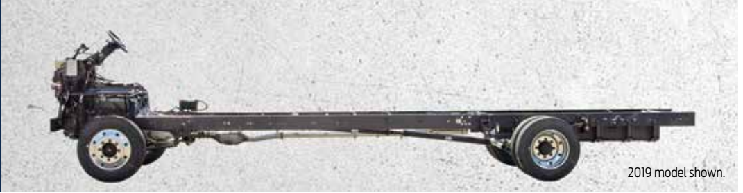
2019 model shown.