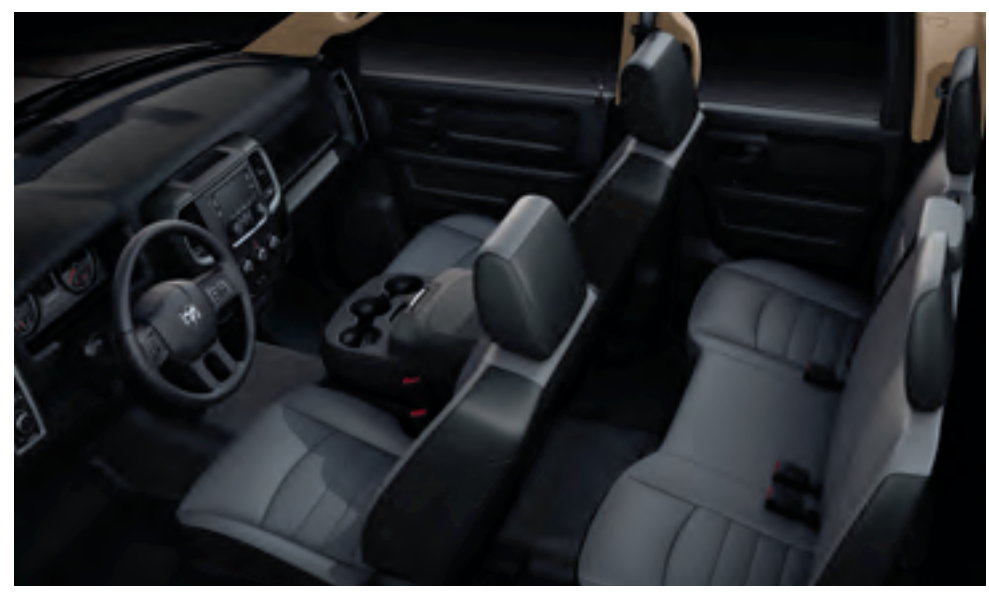
Tradesman interior in Diesel Gray/Black Vinyl