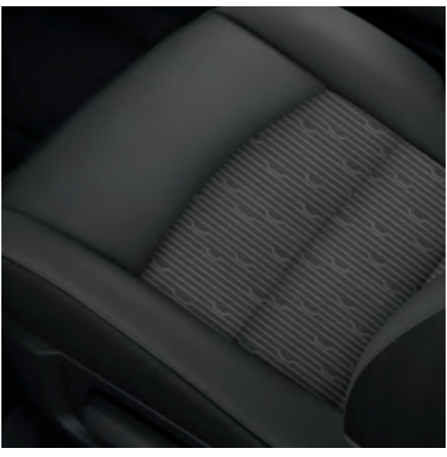
Soulmate/Gear-embossed Cloth Diesel Gray/Black Tradesman and Express