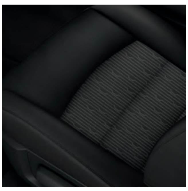
Soulmate/Gear-embossed Cloth Black Tradesman, Express and Warlock