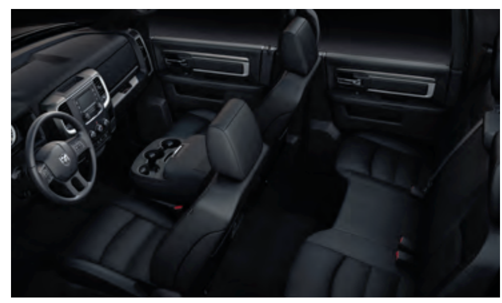
Warlock interior in Black Soulmate/Gear-embossed Cloth