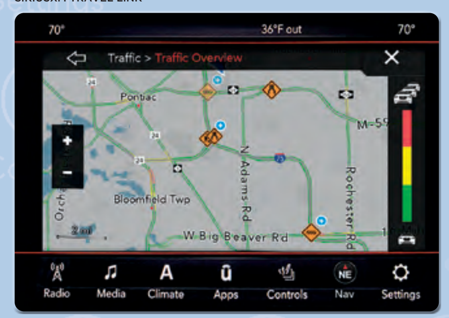
SIRIUSXM TRAFFIC PLUS<sup>16</sup>