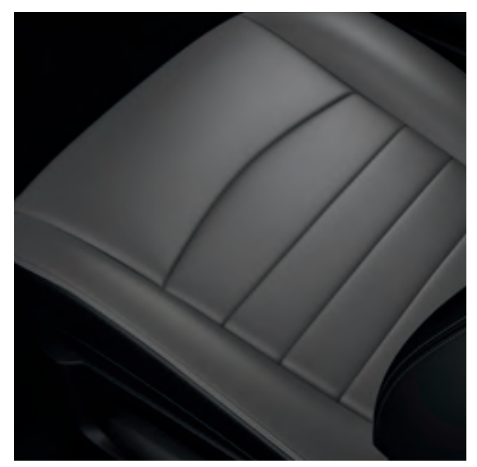
Work-grade Bristol Vinyl Diesel Gray/Black Tradesman® and Express