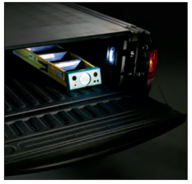
TAKE IT ALL WITH YOU AND THEN SOME The available class-exclusive RamBox® Cargo Management System<sup>5</sup> gives you covered and secure storage while still allowing traditional bed space for the essentials.

STANDARD SHEETS FIT The available RamBox System gives you ample storage, while the bed still accommodates standard 4x8 sheets of building materials.