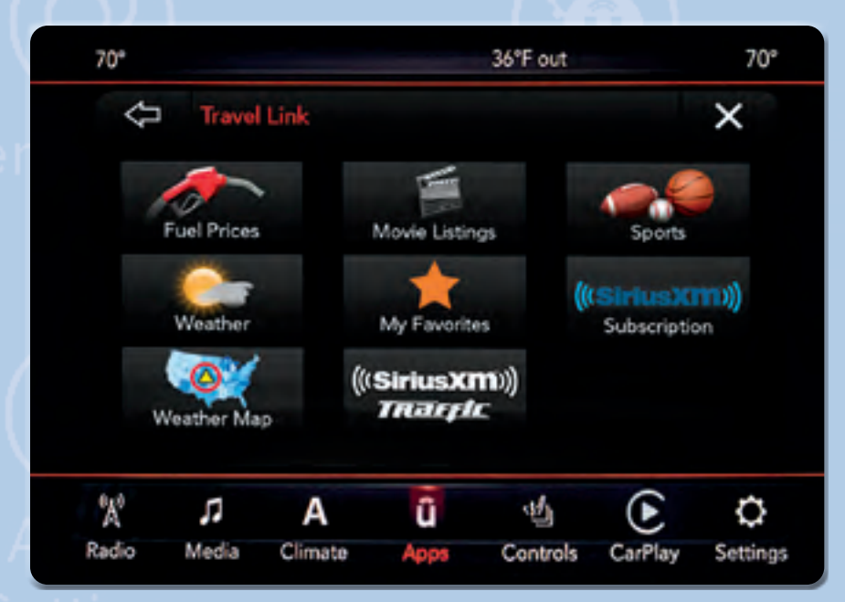
SIRIUSXM TRAVEL LINK<sup>16,17</sup>