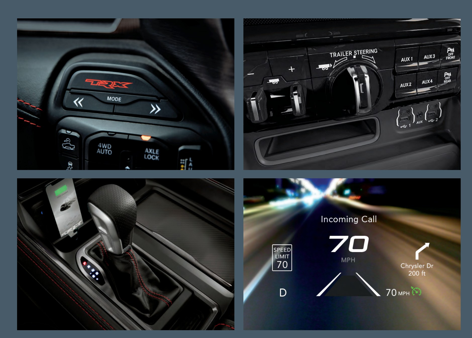
Both Performance Pages and Off-Road Performance Pages let you monitor vital performance stats and component information. The available Trailer Reverse Steering Control uses a directional dial to control the steering wheel and move the trailer in the desired direction. All TRX models feature a console-mounted gear shifter and signature flat-bottom steering wheel with enhanced grips and paddle shifters. Opt for the available reconfigurable Heads-Up Display (HUD) that projects key information in your sight line.