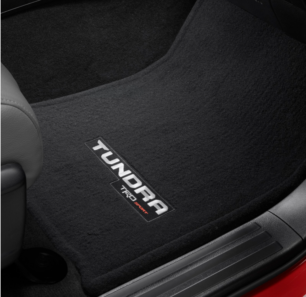
TRD OFF-ROAD CARPET FLOOR MATS