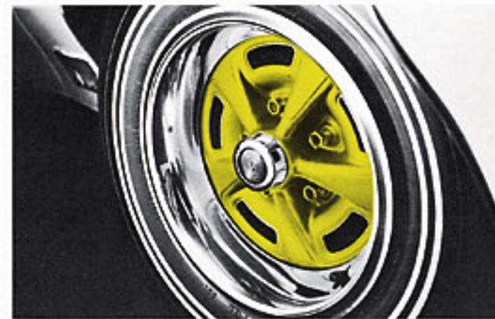
SPECIAL GOLD ACCENTED RALLY II WHEELS

Fire Frost Gold paint on the Rally II wheels highlights the gold accents on the body, giving the wheels a uniquely classic-jeweled appearance. Just one more example of the custom-tailored features of this exquisite automobile. The Model SSJ is an owner's kind of car where pride comes as standard equipment.