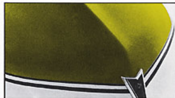
CLASSIC HAND PIN STRIPING

The electrically-operated sun roof has the look of elegance associated with only the most expensive classic automobiles. (In fact, it is the same roof currently installed in the Cadillac Eldorado.) When closed it's weather-sealed and locks out wind noise, too. When opened, it introduces a new world of sunshine and fresh air.