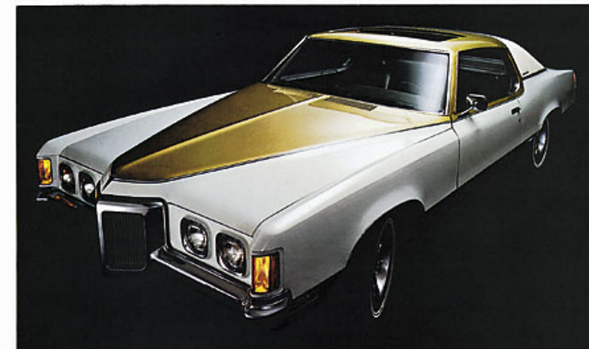
Model SSJ with electrically-operated sun roof open.

PONTIAC GRAND PRIX MODEL SSJ... BY HURST