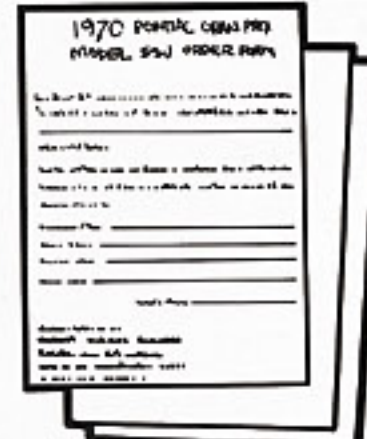
A. Model SSJ Auxiliary Order Form.