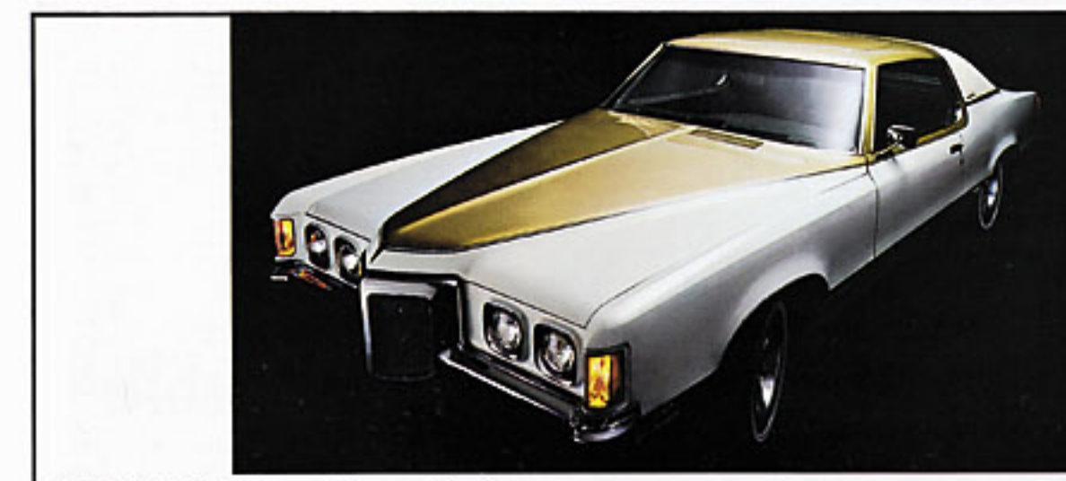
Model SSJ with electrically-operated sun roof closed.