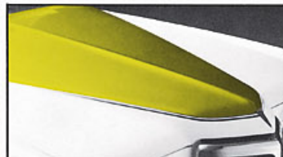
FIRE FROST GOLD PAINT ACCENTS

The Landau-style half-top is soft, fully-padded Cordova trim molding that signify the ultimate in luxury and classic design. The distinctive appearance provides a note of uniqueness that is solely your Grand Prix Model SSJ.