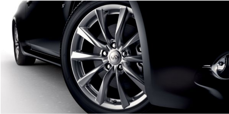
18-INCH ALUMINUM-ALLOY WHEELS