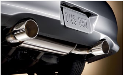
SPORT MUFFLER The polished, stainless steel muffler showcases a deeper, throaty exhaust tone. Larger diameter exhaust tips help let it breathe and the muffler is fabricated with TIG welds for a precision-crafted appearance.