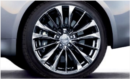
19-INCH BRIGHT FINISH WHEELS These leave no question as to your dedication to making the right impression wherever you go. Their sculpted design utilizes lightweight aluminum alloy and original Infiniti logo center caps. Requires Sport Package or Sport 6MT.