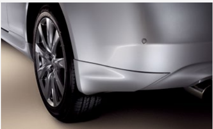
SPLASH GUARDS The color-matched splash guards reduce spray on lower body panels, while helping prevent nicks and scratches caused by road debris under most weather conditions. Not available with Aerodynamic Kit.