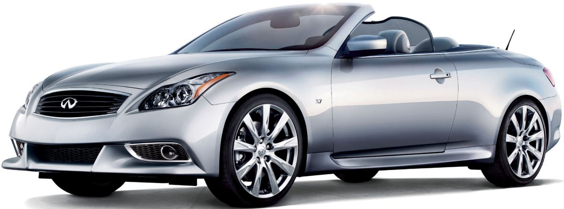
ACCESSORIES SHOWN Aerodynamic kit (3-piece), 19-inch, 9-spoke aluminum-alloy wheels, midnight black grille, rear wind deflector.

The same exacting standards applied to the creation of an Infiniti vehicle go into designing and manufacturing Genuine Infiniti Accessories. With a wide array of quality products designed to integrate seamlessly, you can be assured of a custom fit and finish.