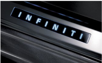
STAINLESS STEEL ILLUMINATED KICK PLATES The Infiniti logo glows softly along the bottom of the doorsills—a signature flourish you and your passenger will appreciate every time you get in.