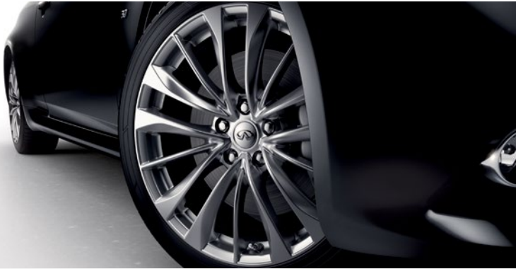
19-INCH ALUMINUM-ALLOY WHEELS