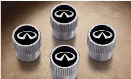
INFINITI VALVE STEM CAPS A distinctive detail that's also functional. These valve stem caps display your pride in choosing to drive an Infiniti, while they help improve the durability of your wheel valve stems by eliminating the seizing that can occur with metal valve stem threads.