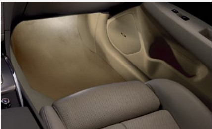
INTERIOR AMBIENT LIGHTING The warm and engaging glow welcomes you as you get settled. It adds ambiance to the interior and enhances the interior's modern appeal.