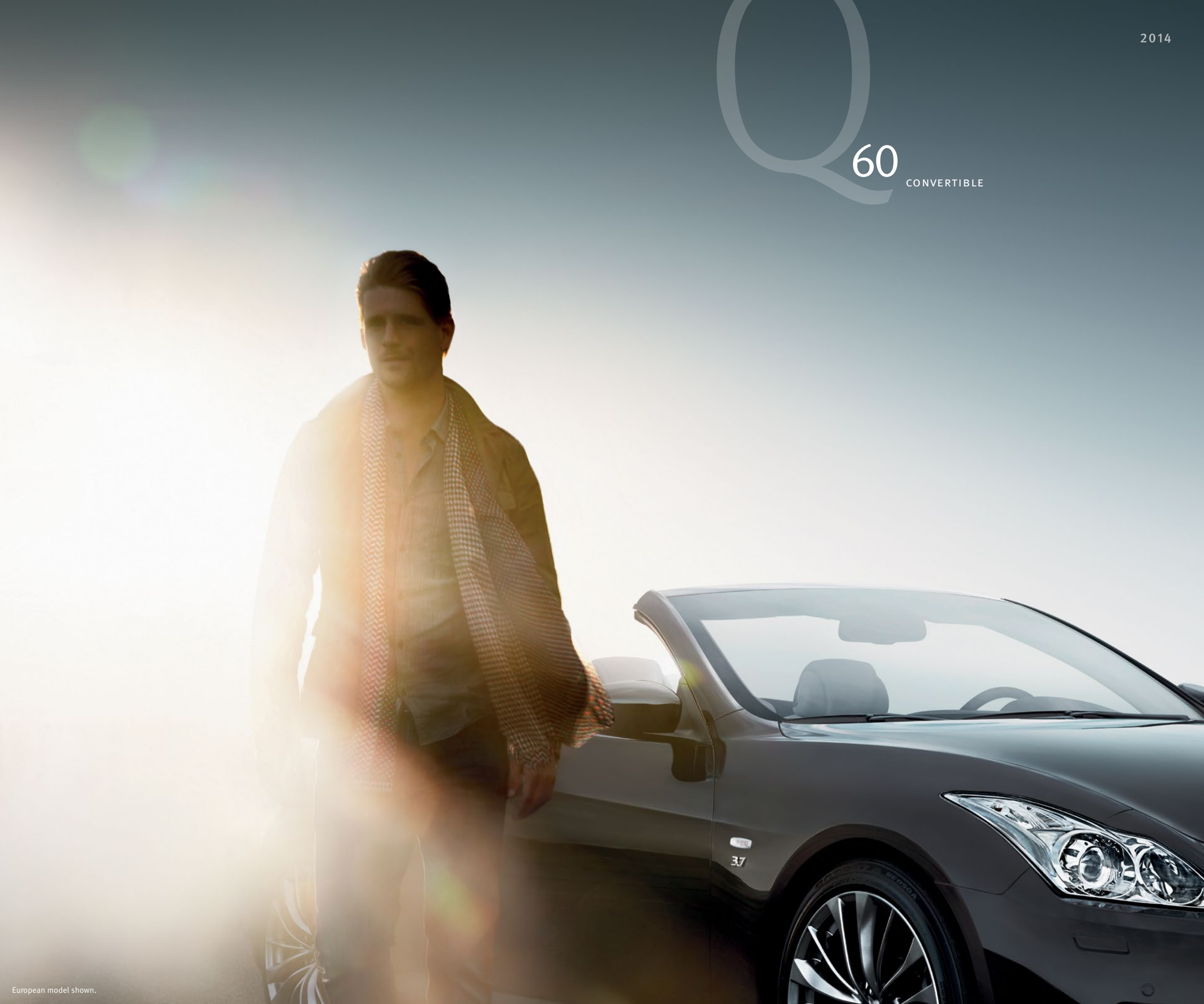
European model shown.