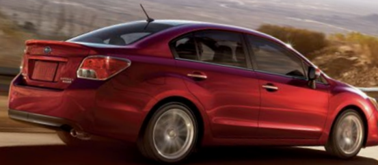
Impreza 2.0i Limited 4-door in Venetian Red Pearl.