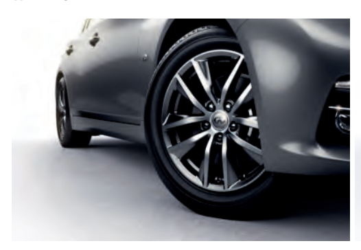
17 X 7.5-INCH, SPLIT 5-SPOKE ALUMINUM-ALLOY WHEELS WITH ALL-SEASON RUN-FLAT PERFORMANCE TIRES

Infiniti has taken care to ensure that the color swatches presented here are the closest possible representations of actual vehicle colors. Swatches may vary slightly due to the printing process and whether viewed in daylight, fluorescent or incandescent light. Please see the actual colors at your local Infiniti Retailer.