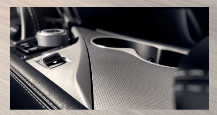
ENHANCING THE DRIVE The Infiniti Drive Mode Selector allows you to personalize the driver settings—from steering, engine and suspension inputs—to best fit your needs of the moment.

A CONTINUOUS RUSH Acceleration Swell is our vision of power, dedicated to delivering a shape and feel to acceleration. By precisely tuning the engine to unleash torque at a broader rev range, the force you feel seems to increase the faster you go, making Swell feel more like a limitless rush than a momentary thrill.