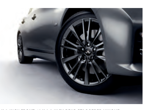
19 X 9-INCH FRONT, 19 X 9.5-INCH REAR STAGGERED UNIQUE ALUMINUM-ALLOY WHEELS*** WITH SUMMER RUN-FLAT PERFORMANCE TIRES**