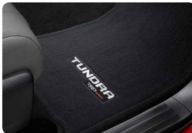
TRD SPORT CARPET FLOOR MATS